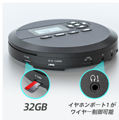
Image: Close-up of the TF card slot and headphone jack on the side of the CD player.

Video: Demonstration of inserting a TF card and activating TF card playback mode. The video shows the user inserting a Micro SD card into the designated slot and then pressing the 'MODE' button to switch to TF card mode, indicated by 'SD' on the display. It also demonstrates skipping tracks in this mode.