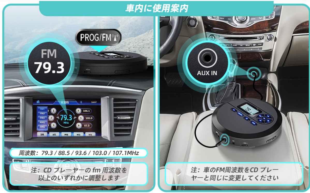
Image: Visual guide illustrating how to connect the CD player to a car stereo using either the FM transmitter function or an AUX cable.