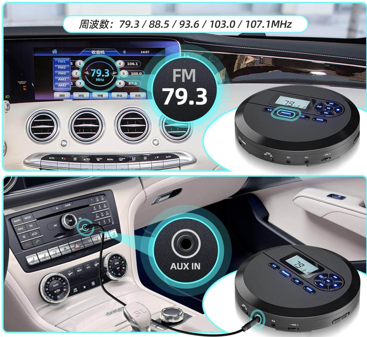
Image: Desobry Portable CD Player with its accessories, including headphones, AUX cable, and USB-C charging cable.