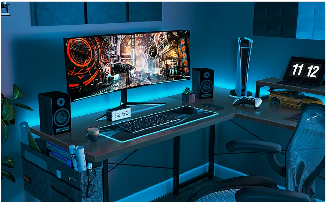
Figure 5.3: The integrated iron hook, shown holding headphones, offers a practical solution for organizing accessories.