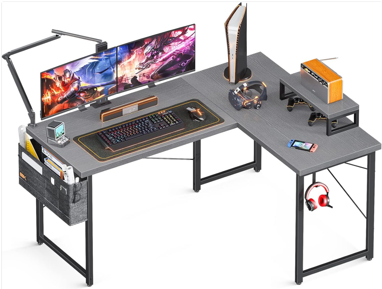
Figure 4.2: Fully assembled ODK L-shaped desk, showcasing its use in a gaming setup with multiple monitors and accessories.