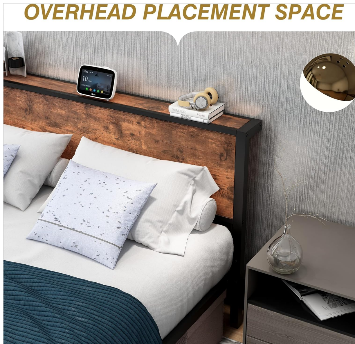
Figure 5: The headboard shelf providing convenient storage and display space.

The integrated headboard shelf can be used to store books, electronic devices, decorative items, or other bedside essentials. Ensure items placed on the shelf are stable and do not obstruct your sleeping area.