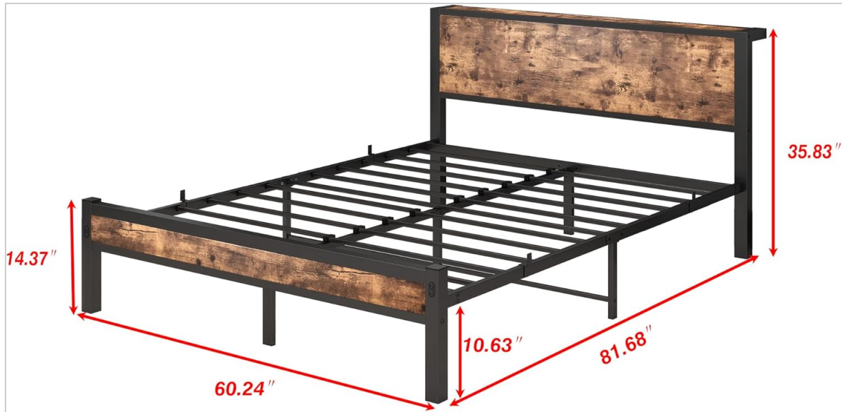
Figure 1: DUMEE Queen Bed Frame with detailed dimensions.

Queen Bed Frame Size: L*W*H: 81.68 * 60.24 * 35.83 inches (207.47 x 151.49 x 91.01 cm).