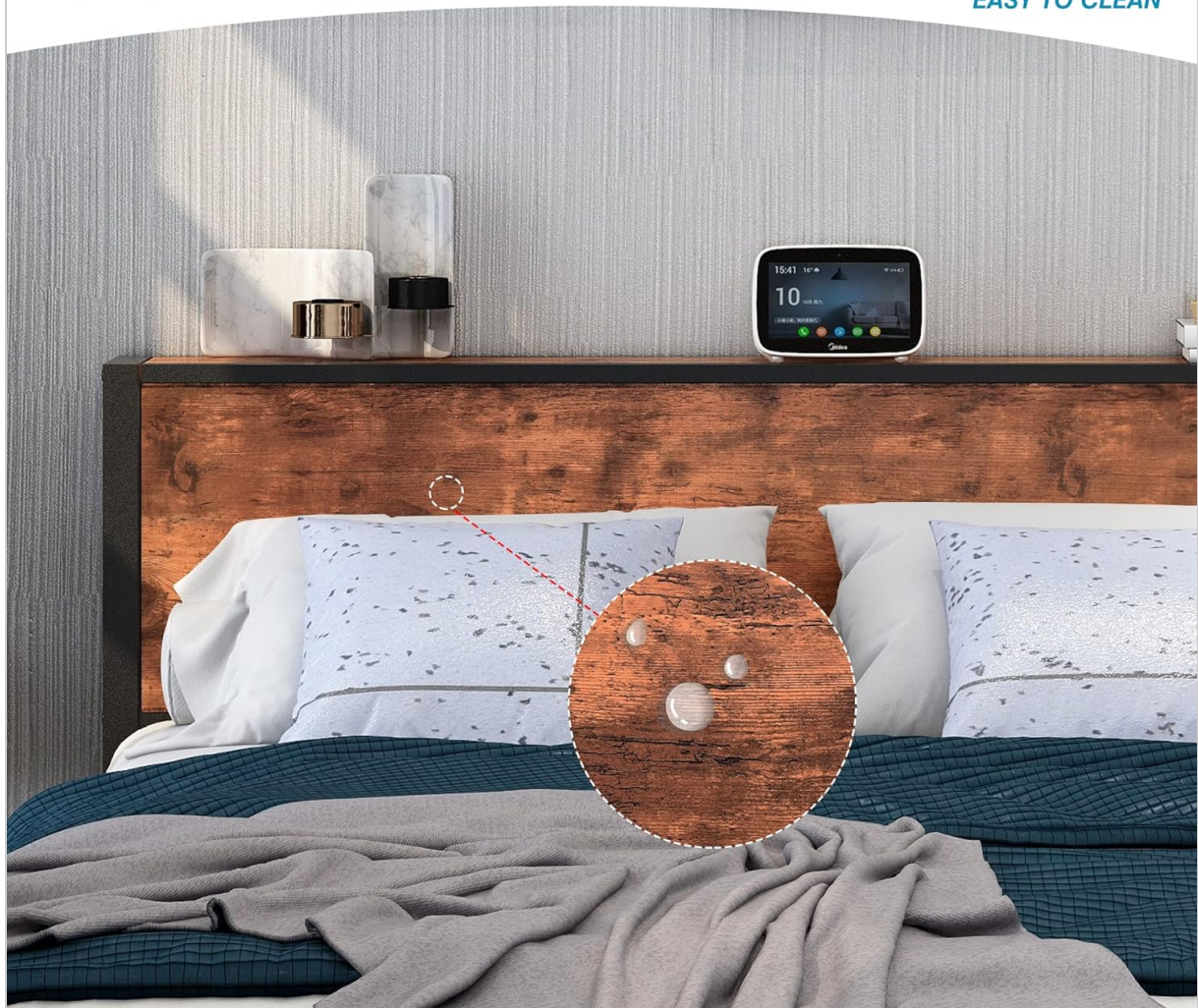
Figure 3: Detail of the stain-resistant headboard surface, showing its easy-to-clean properties.

This image shows a close-up of the headboard, demonstrating its stain-resistant and easy-to-clean surface. Water droplets are visible on the wood-grain finish, illustrating its waterproof quality.