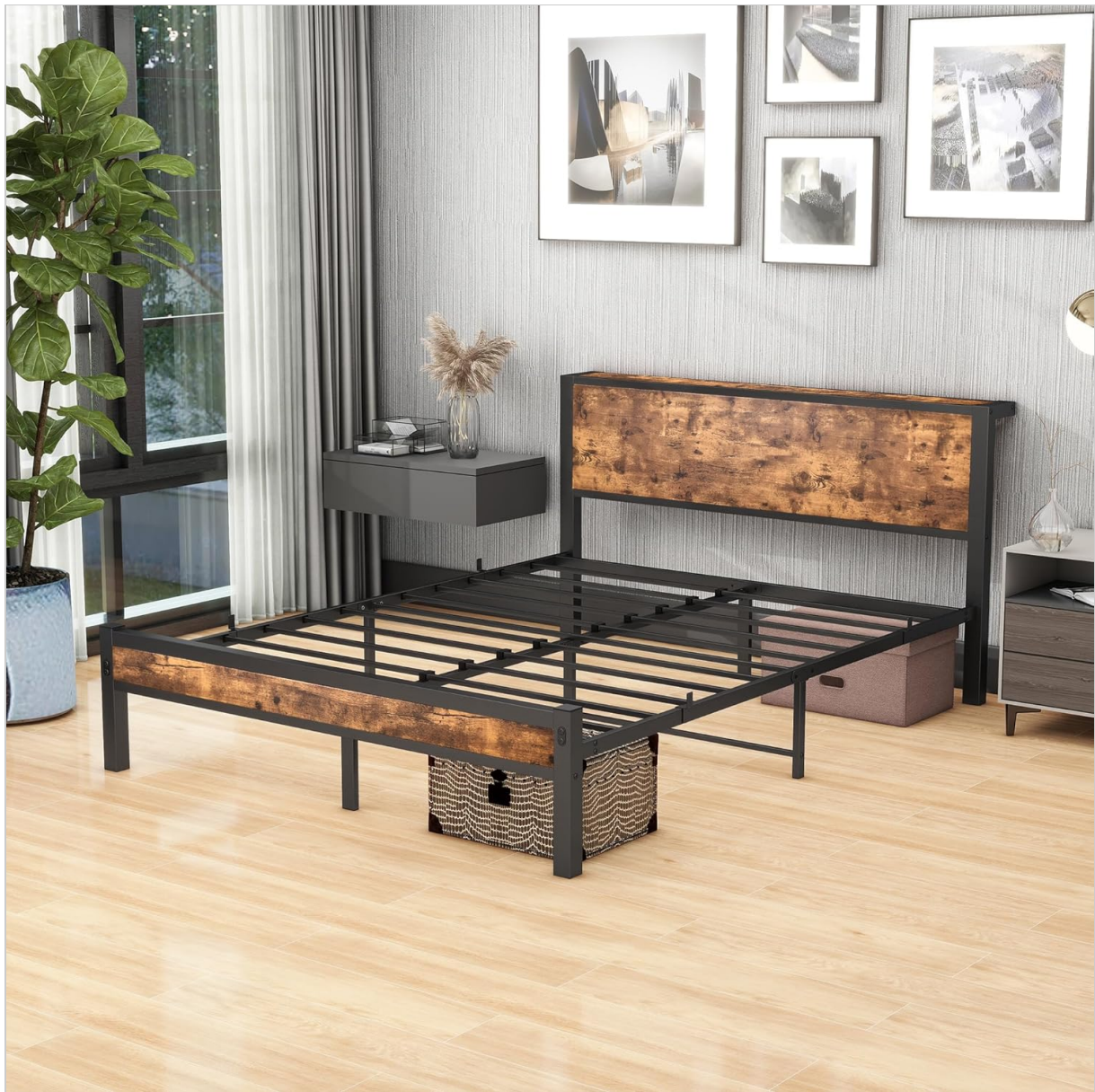
Figure 4: Illustration of the ample under-bed storage space provided by the bed frame design.

This image illustrates the generous under-bed storage space available, with a storage basket placed underneath the frame. This feature allows for efficient organization and decluttering of your bedroom.