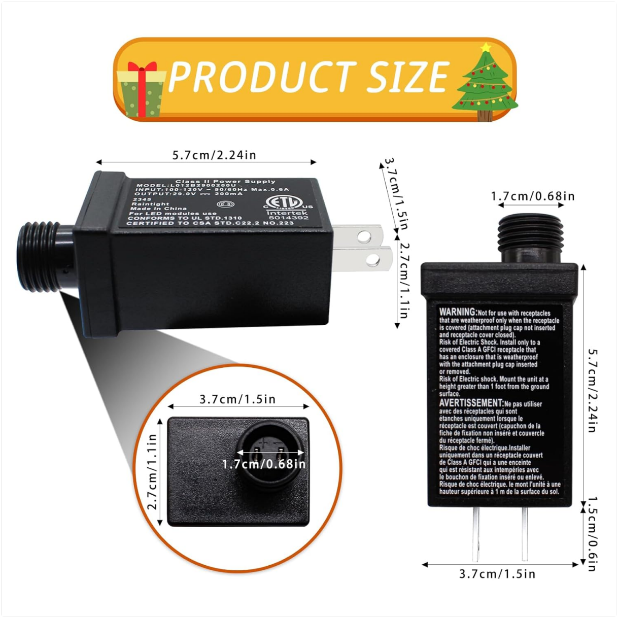
Image 2: Detailed dimensions of the Nehbujin 29V 6W LED Power Supply Adapter, including the plug and connector.