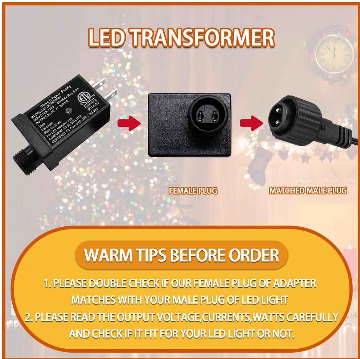
Image 3: Illustration showing the connection process between the adapter's female plug and a matched male plug from an LED light string.