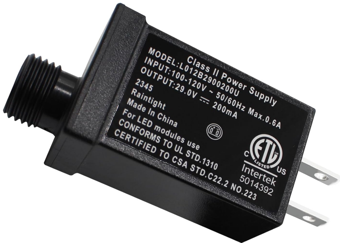
Image 1: The Nehbujin 29V 6W LED Power Supply Adapter, showing its compact design and electrical specifications label.