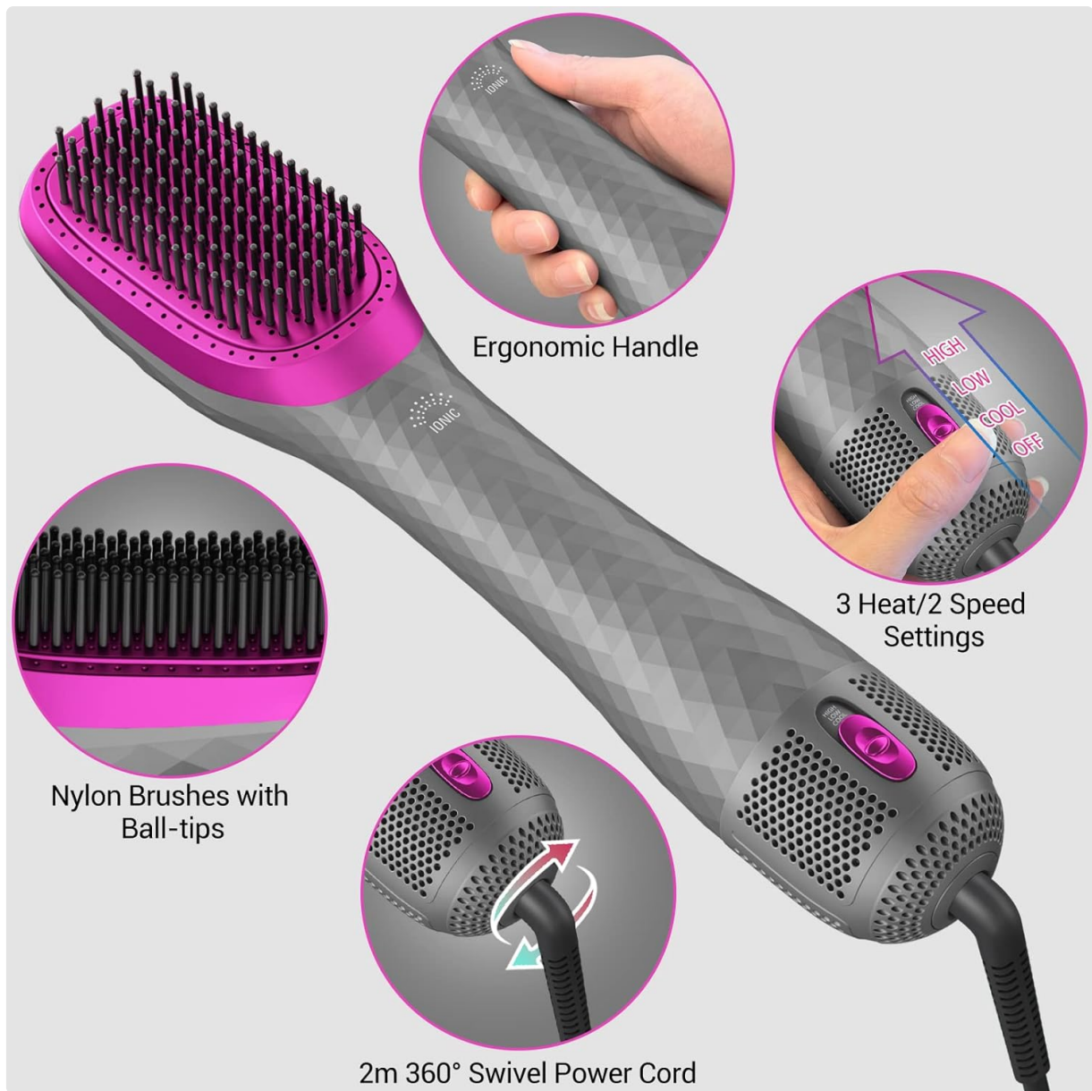
Image 3.3: Key design elements including ergonomic handle and swivel cord.