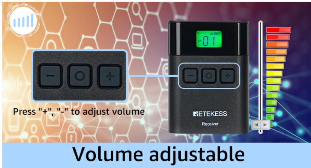
Image: Close-up of a TT122 receiver showing the volume buttons and a visual representation of volume levels.

The volume on the receivers can be adjusted from 1 to 10 levels.