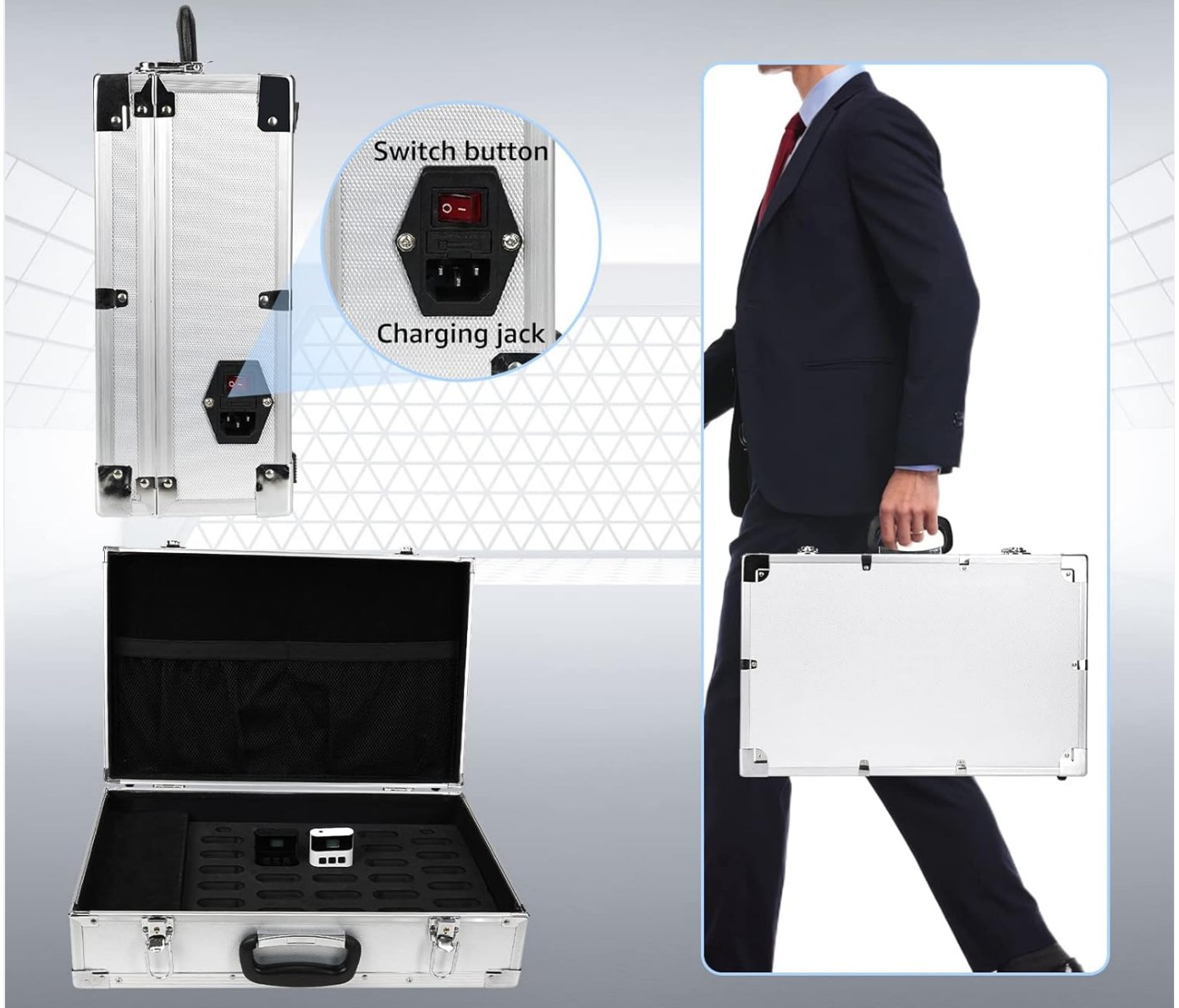
Image: A 32-slot charging case for the Reteless TT122 system, showing the switch button and charging jack, along with a person carrying the portable case.