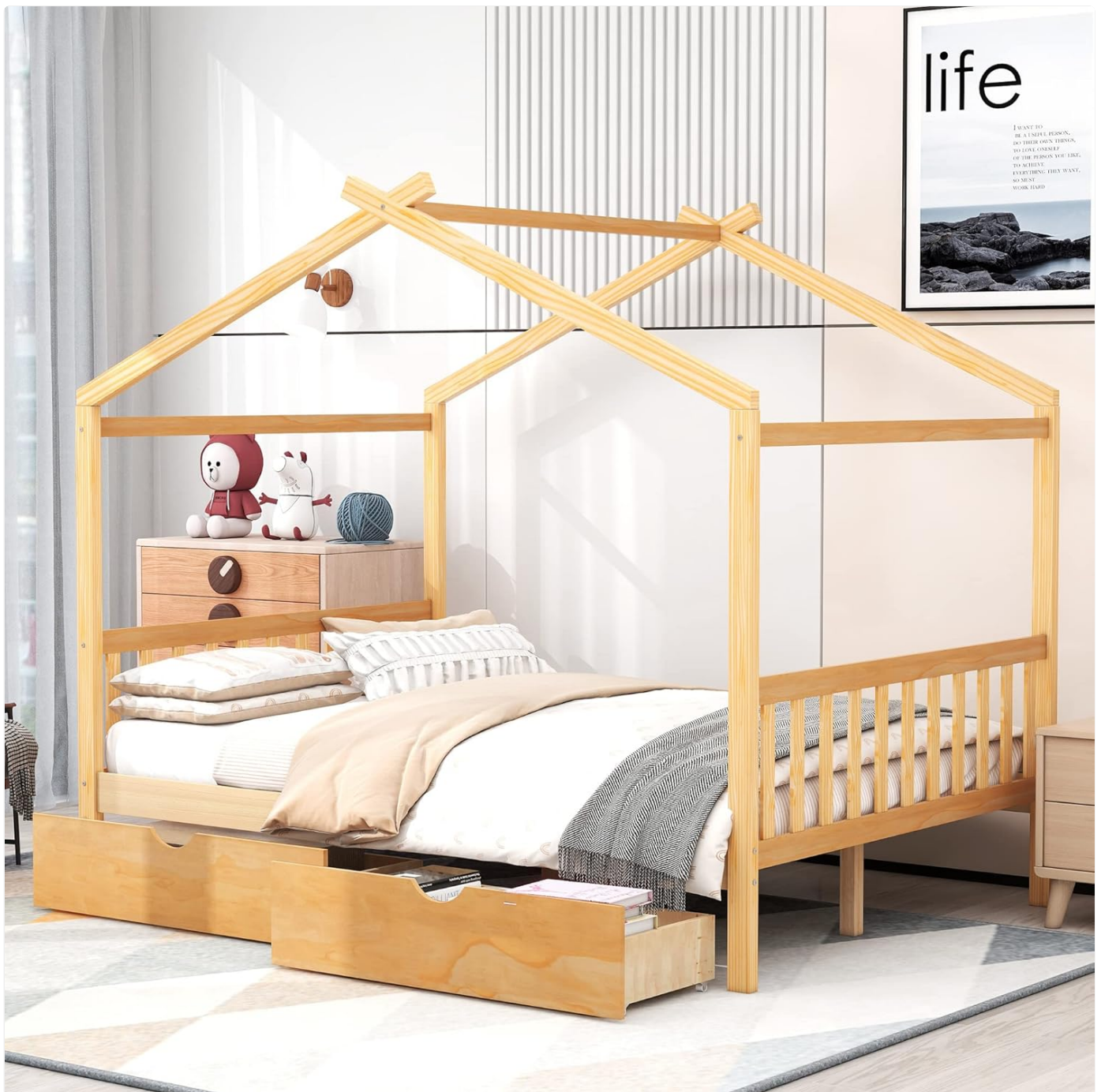
Figure 1.1: Overall view of the Harper & Bright Designs Full Size House Bed with storage drawers.