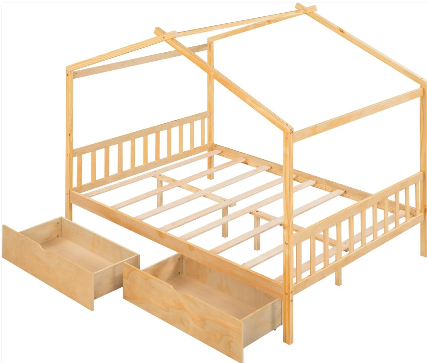
Figure 2.2: Detail of the integrated storage drawers.