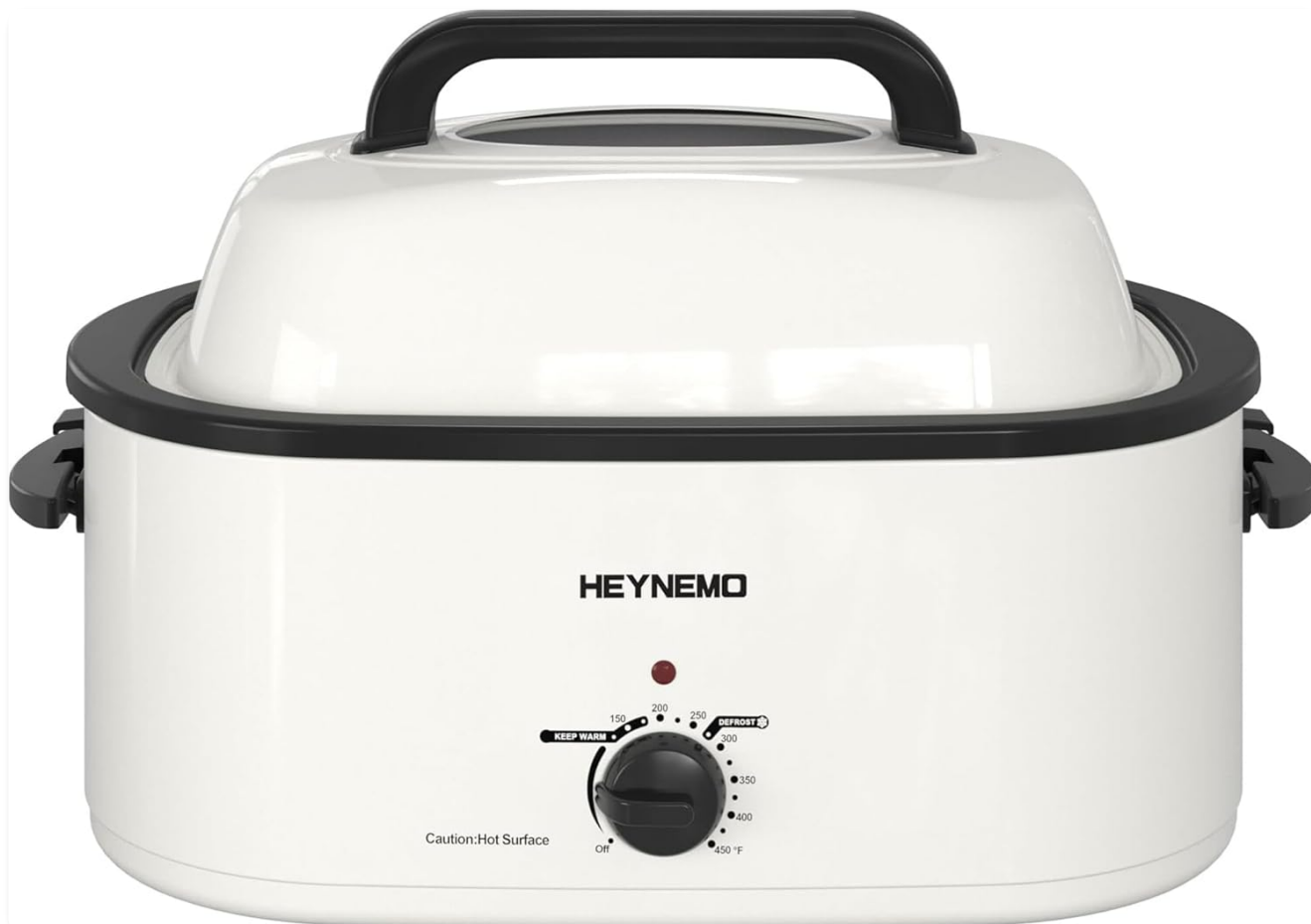
Image: The HEYNEMO 26 Quart Electric Roaster Oven, featuring a white exterior, black handles, and a front-mounted control knob

This manual provides essential instructions for the safe and efficient operation, maintenance, and care of your HEYNEMO 26 Quart Electric Roaster Oven. Please read all instructions thoroughly before first use and retain this manual for future reference.