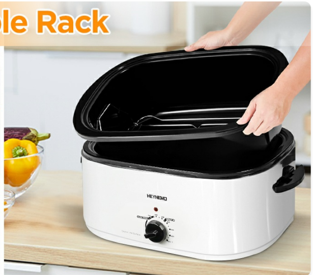
Image: A visual guide demonstrating the adjustable temperature settings for defrosting, roasting, and keeping food warm.