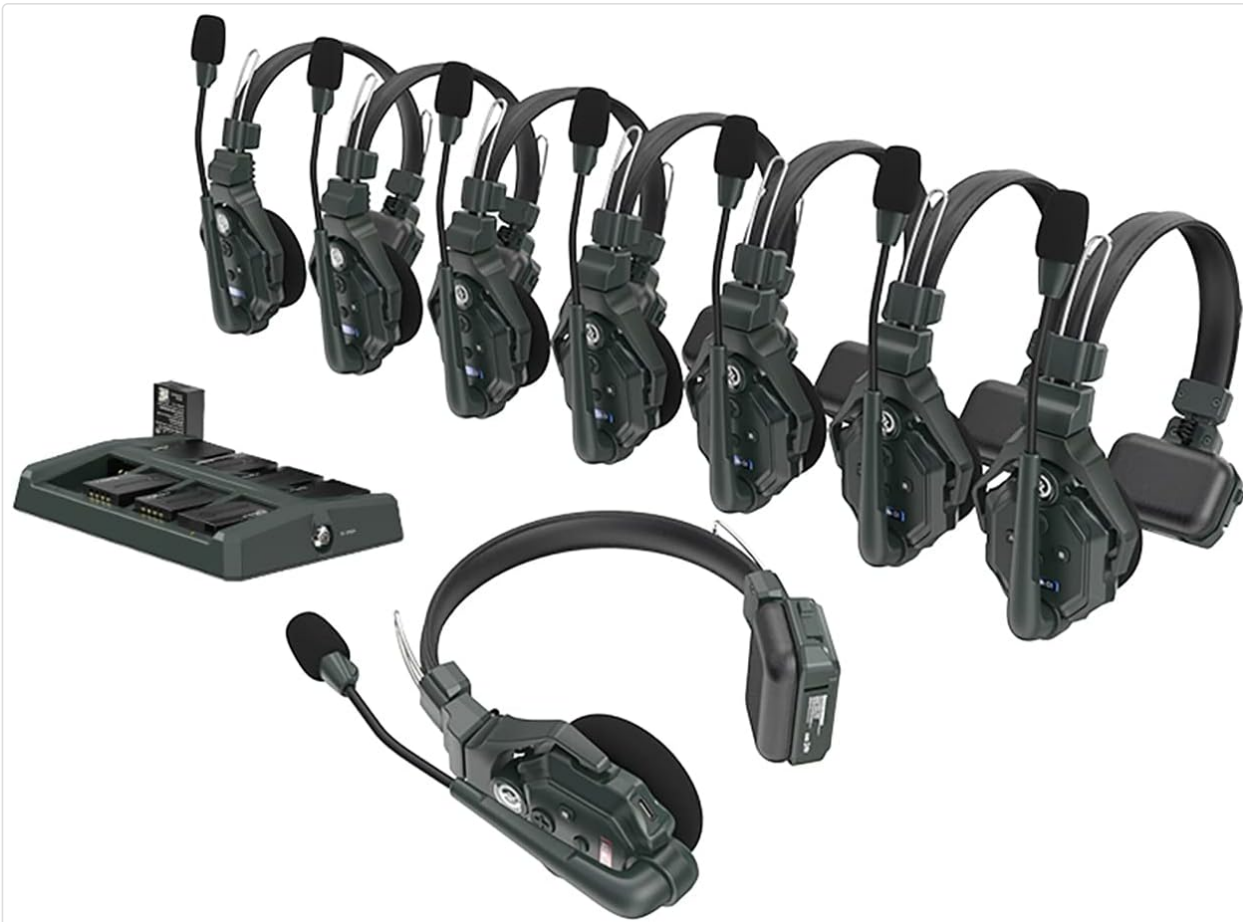
Image: The complete Hollyland Solidcom C1 8-user system, showing the master and remote headsets along with the multi-port charging case.