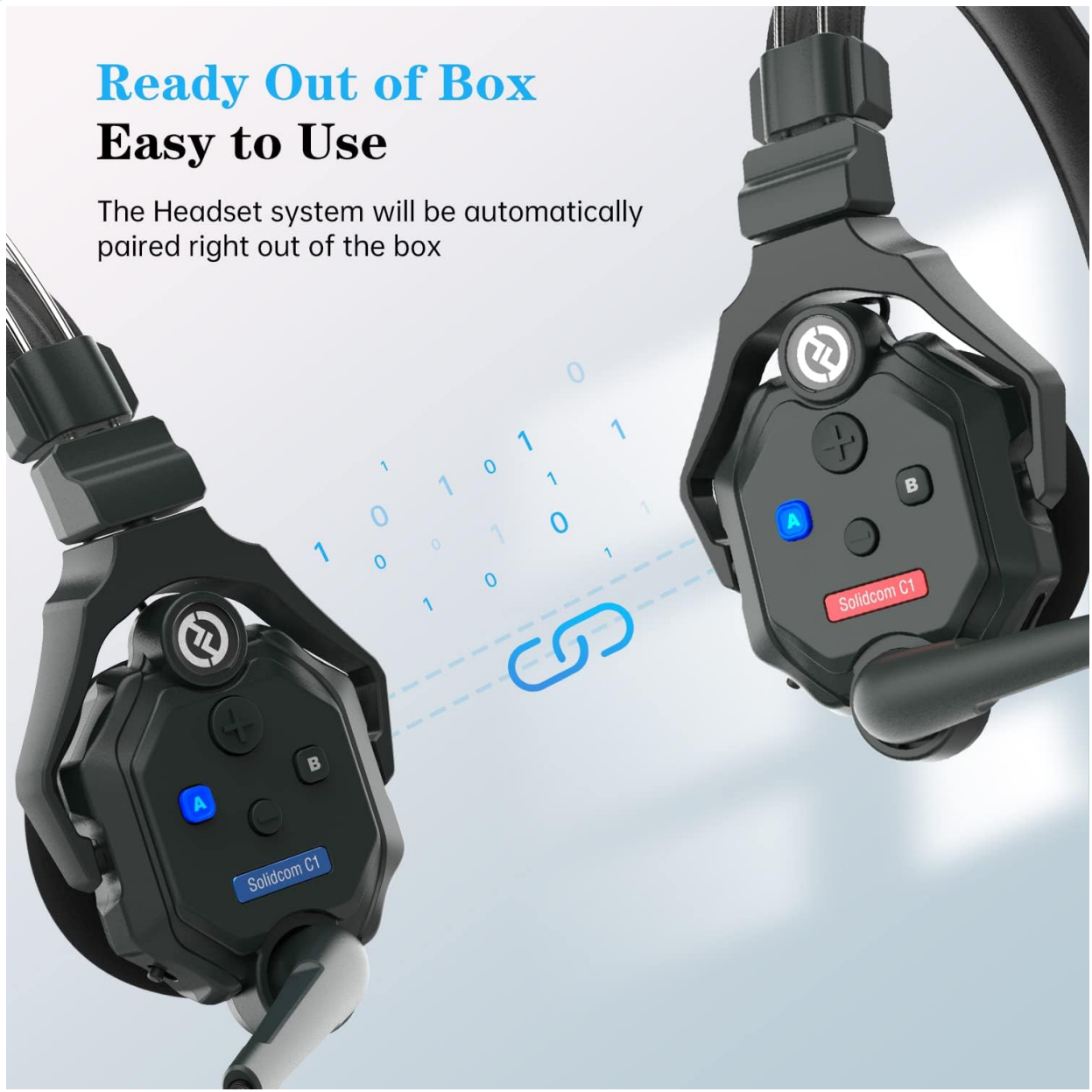
Image: A visual demonstrating the "Ready Out of Box" feature, where headsets automatically pair upon activation.

The Headset system will be automatically paired right out of the box