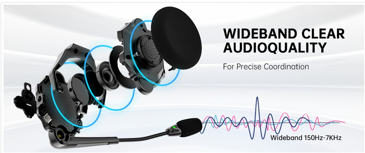
Image: An exploded view of the headset components, highlighting the wideband audio capabilities and directional microphone for precise coordination.

The system delivers wideband clear audio with a frequency response of 150Hz to 7KHz. Acoustic Echo Cancellation (AEC) ensures that conversations are clear and free from echoes. The directional microphone is designed to capture your voice accurately while minimizing background noise.