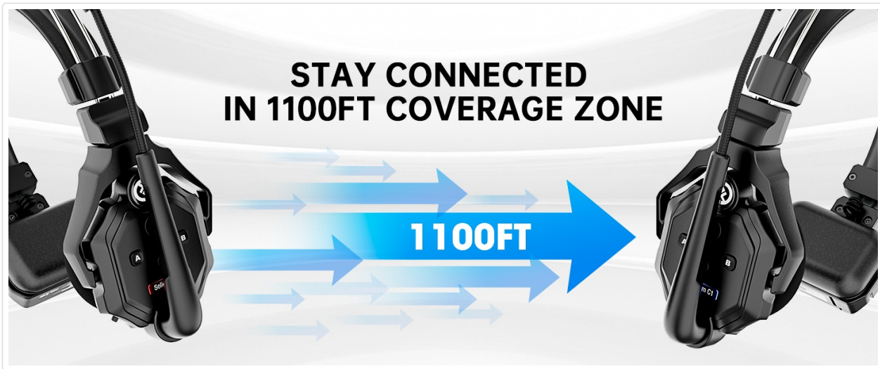
Image: A graphic illustrating the 1100ft coverage zone, emphasizing the wireless range between two headsets.

The Solidcom C1 system provides reliable two-way communication up to 1100 feet (approximately 350 meters) in Line of Sight (LOS) conditions. Obstructions and interference can reduce this range.