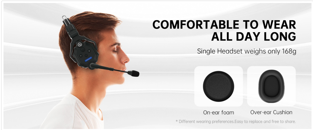
Image: The headset shown with options for on-ear foam and over-ear leather cushions, which are replaceable for comfort and hygiene.

To clean the headsets, use a soft, dry, lint-free cloth. For stubborn dirt, slightly dampen the cloth with water. Do not use harsh chemicals, solvents, or abrasive cleaners. Avoid getting moisture into any openings. Regularly clean the microphone cushions and ear cushions. Replace them if they show signs of wear or damage to maintain hygiene and comfort.