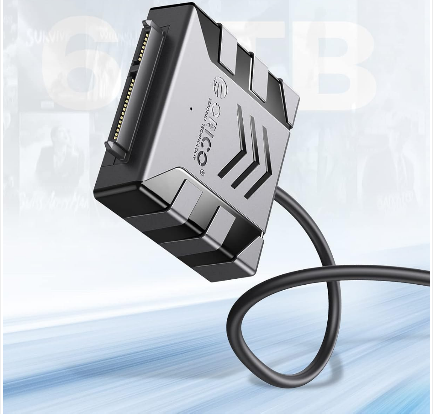
Image: The ORICO 2.5 inch Hard Drive Enclosure with its integrated USB-C cable.