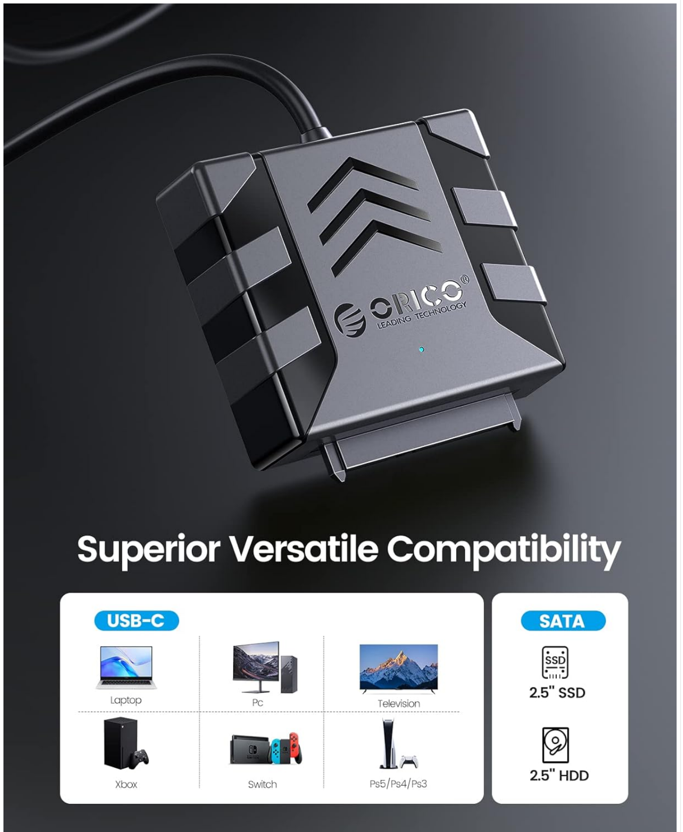
Image: Visual guide to compatible devices and 2.5-inch SATA SSD/HDD types.

Important Note: This product is NOT compatible with 3.5-inch hard drives, ATA (IDE), mSATA, or M.2 interfaces. Please confirm your hard drive type before use.