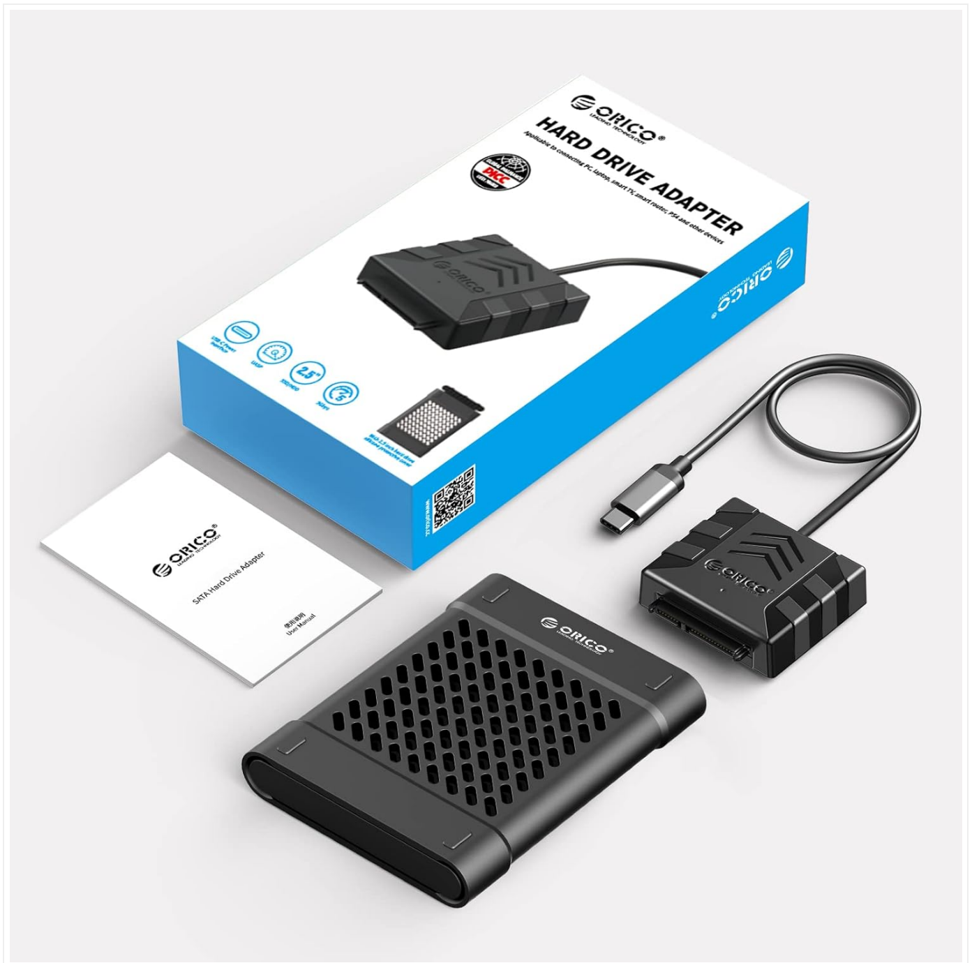
Image: The product packaging showing the SATA adapter, silicone case, and user manual.