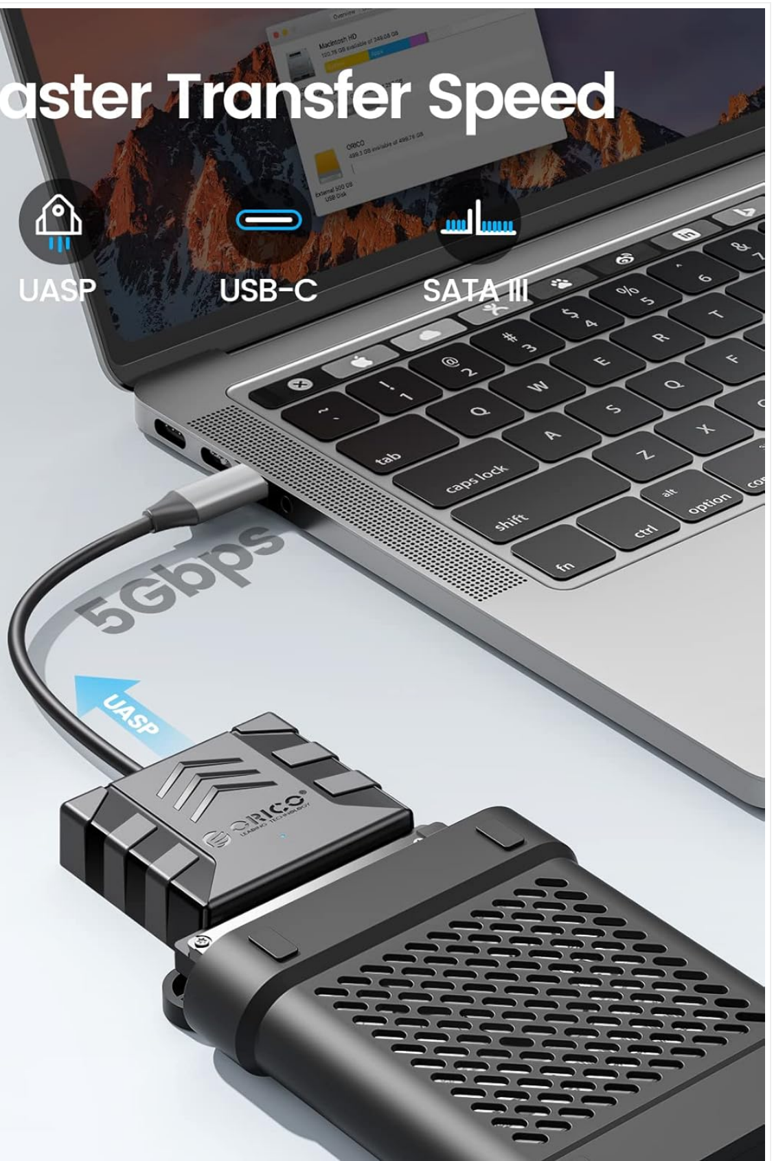
Image: Visual representation of the faster data transfer speeds supported by the enclosure.