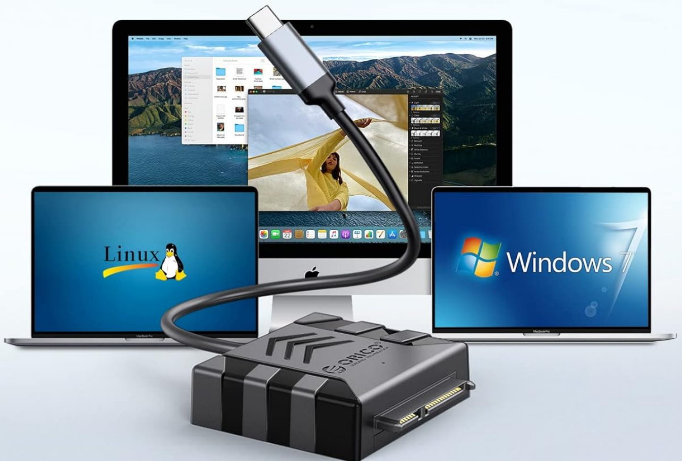
Image: The enclosure connected to a computer, demonstrating compatibility with multiple operating systems.