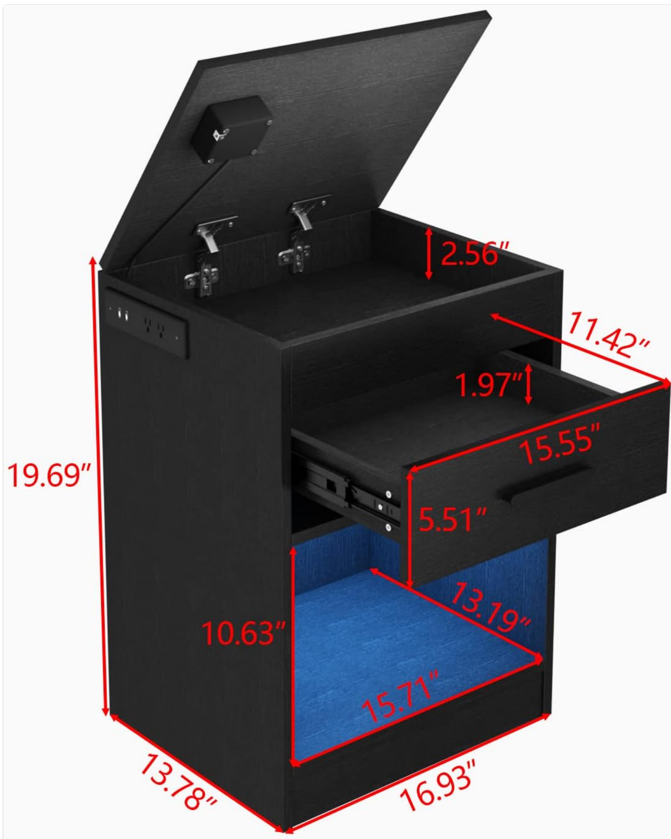
Image: The nightstand with the open shelf illuminated by LED lights, showing the remote control and color options.