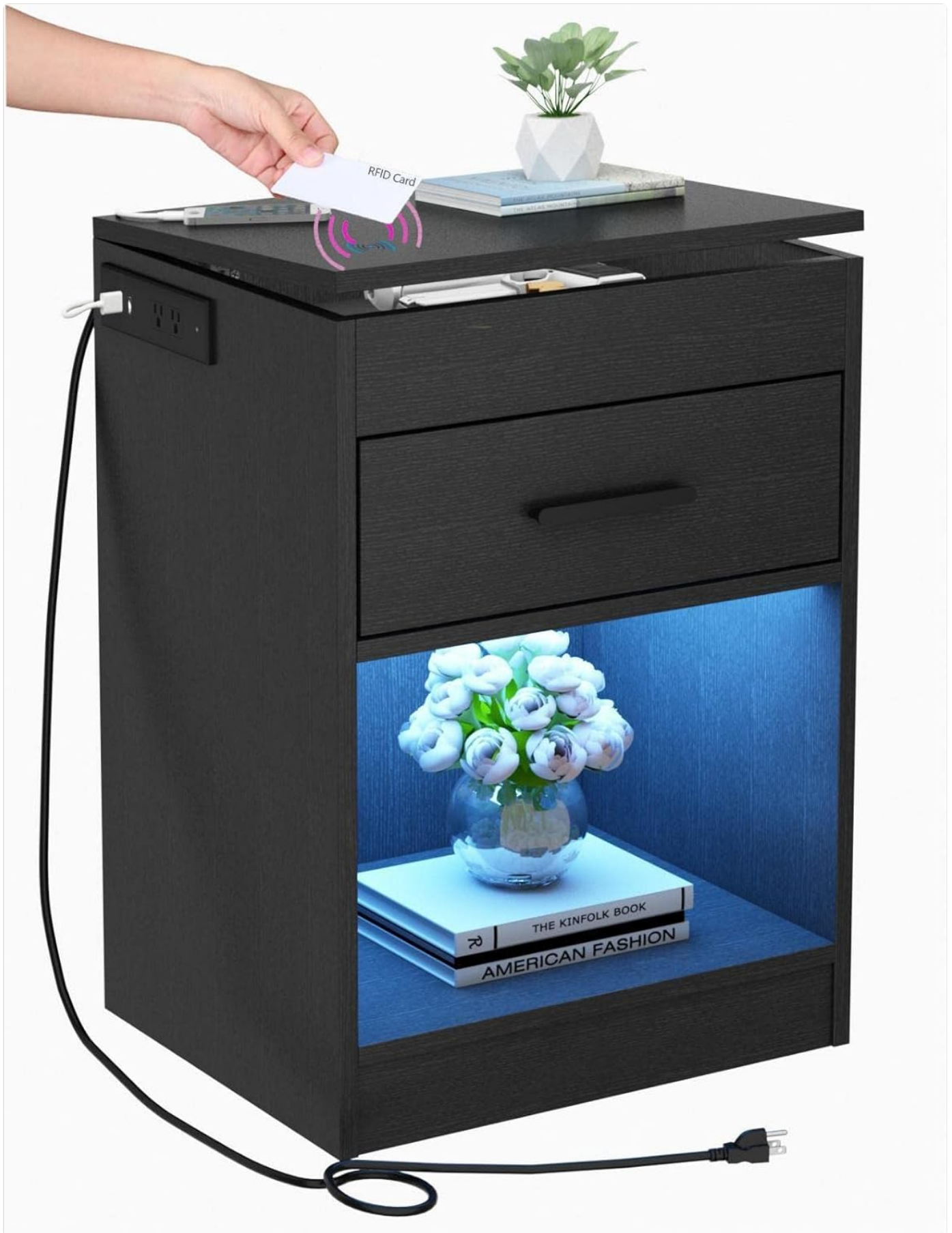
Image: A hand holding an RFID card near the induction area of the nightstand to unlock the hidden compartment.