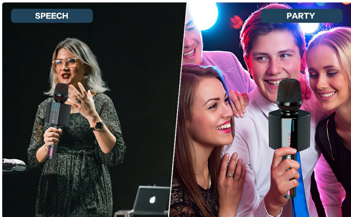
Image: The microphone in use, demonstrating its versatility for live streaming indoors and for outdoor karaoke sessions.