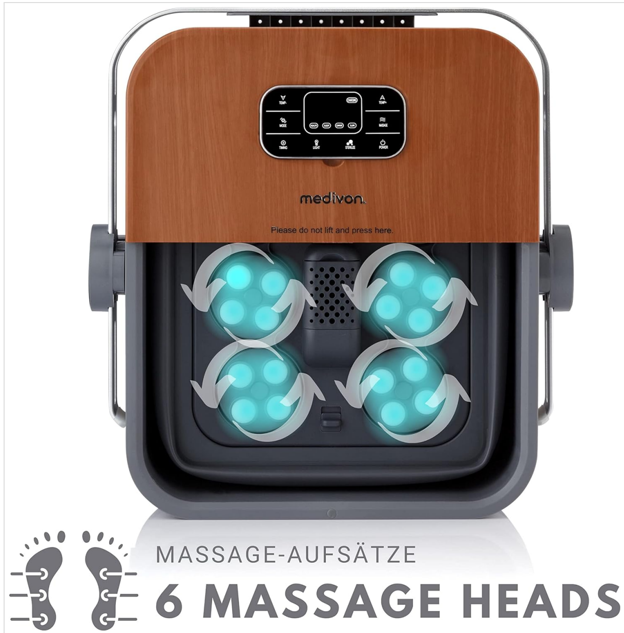
Image 5.1: An overhead view of the foot massager, showcasing the six massage heads and the intuitive control panel for various functions.