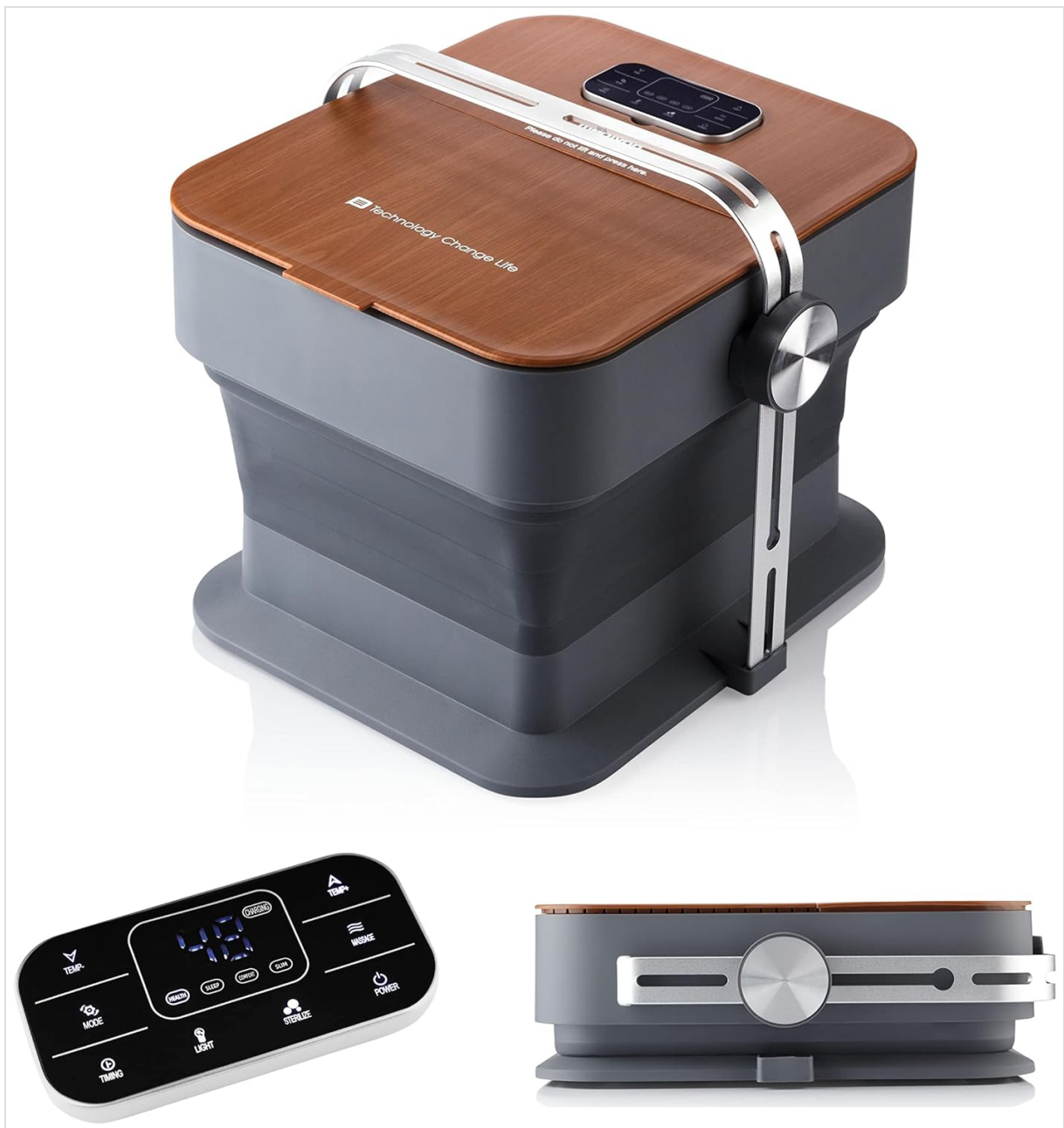
Image 4.1: The Medivon Aqua Pro Foot Massager in its folded, compact form, ready for storage or initial setup.