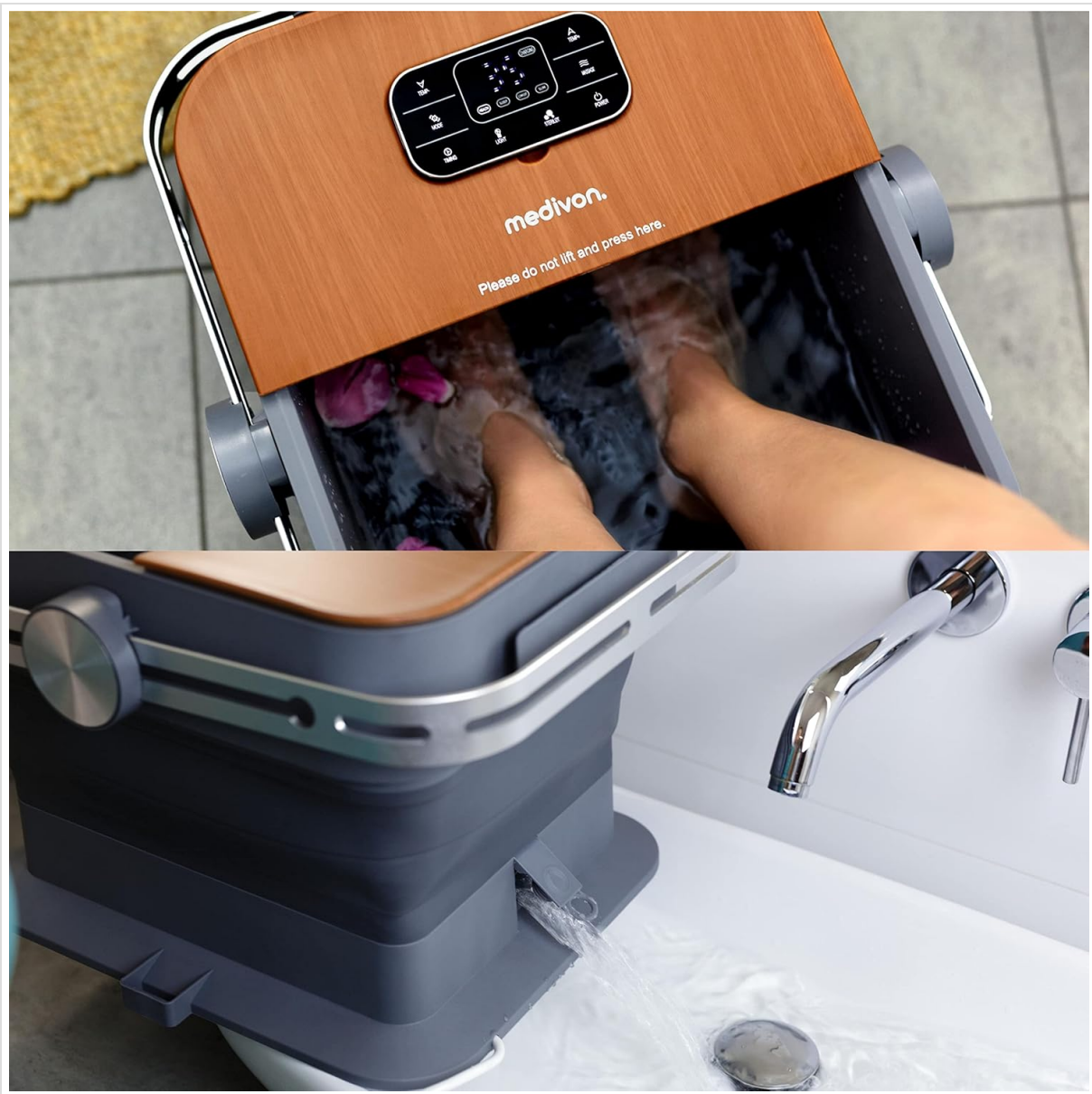
Image 7.1: The foot massager in use and demonstrating the water drainage process.