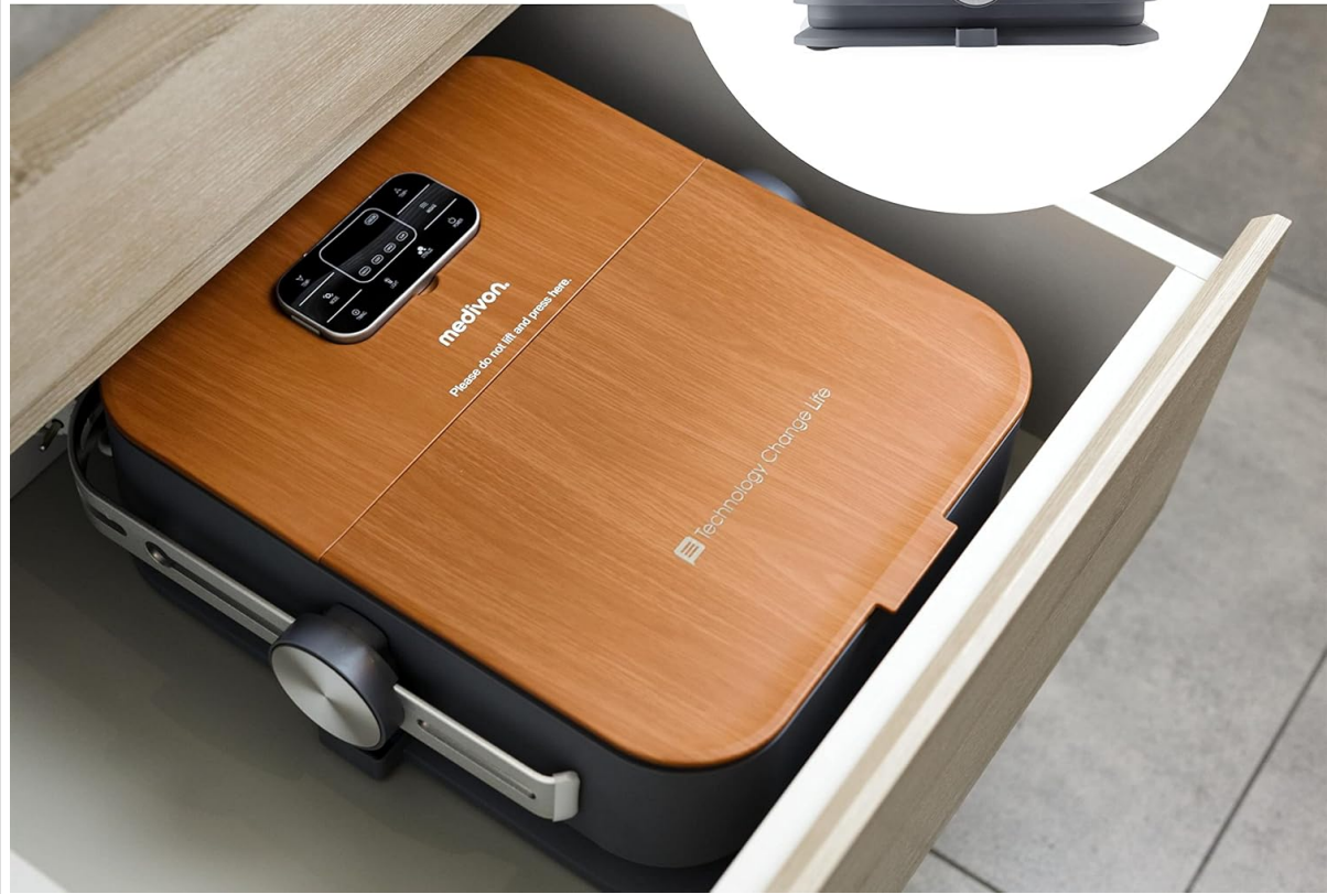
Image 8.1: The foot massager in its folded state, easily stored in a drawer, highlighting its compact design.