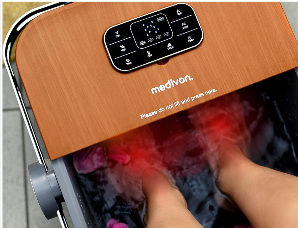
Image 5.2: Feet immersed in the foot massager, demonstrating the red-light therapy feature in action.