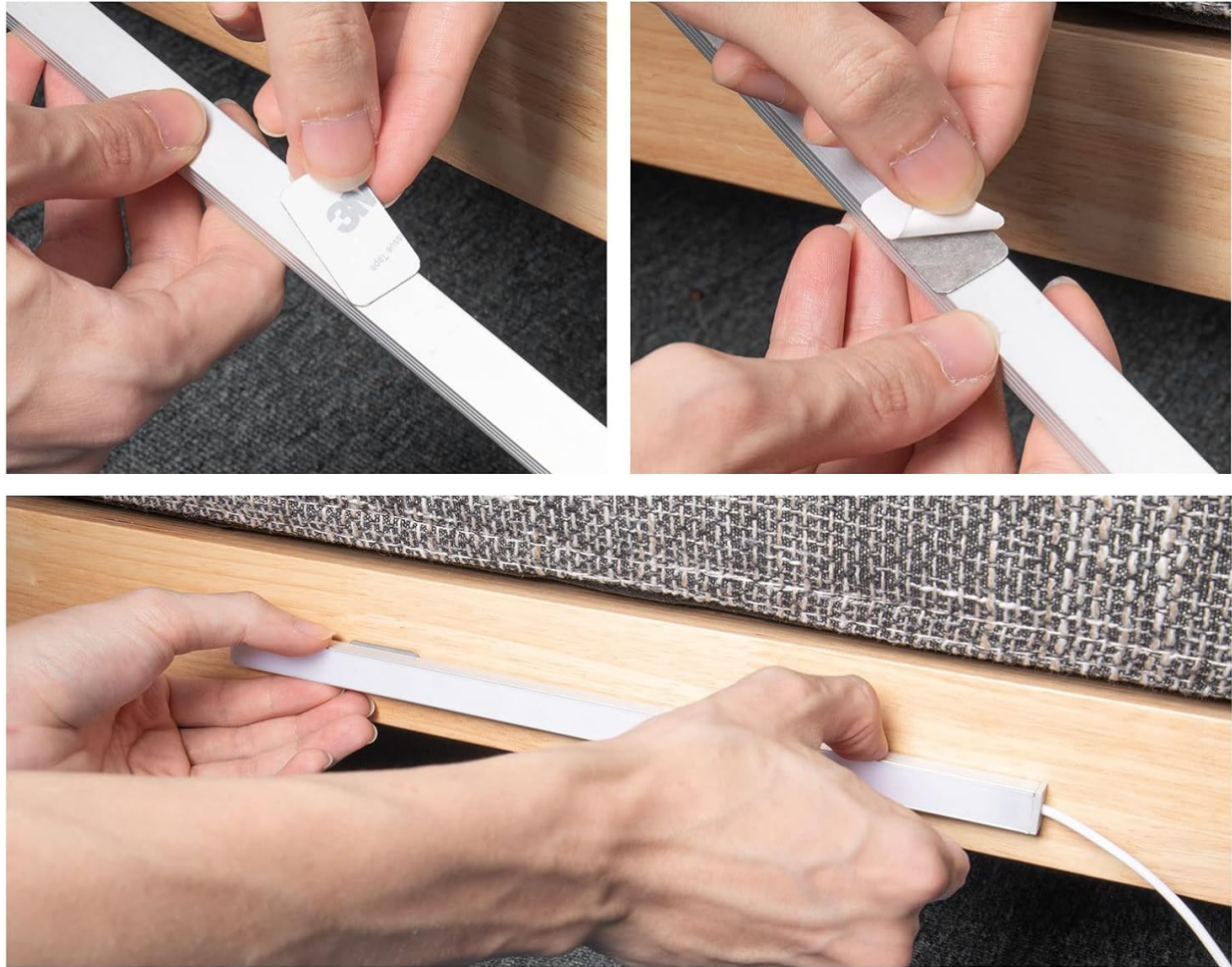
Image: Demonstration of the easy installation process, showing how to apply adhesive pads to metal plates and then magnetically attach the light bar to the installed plates.