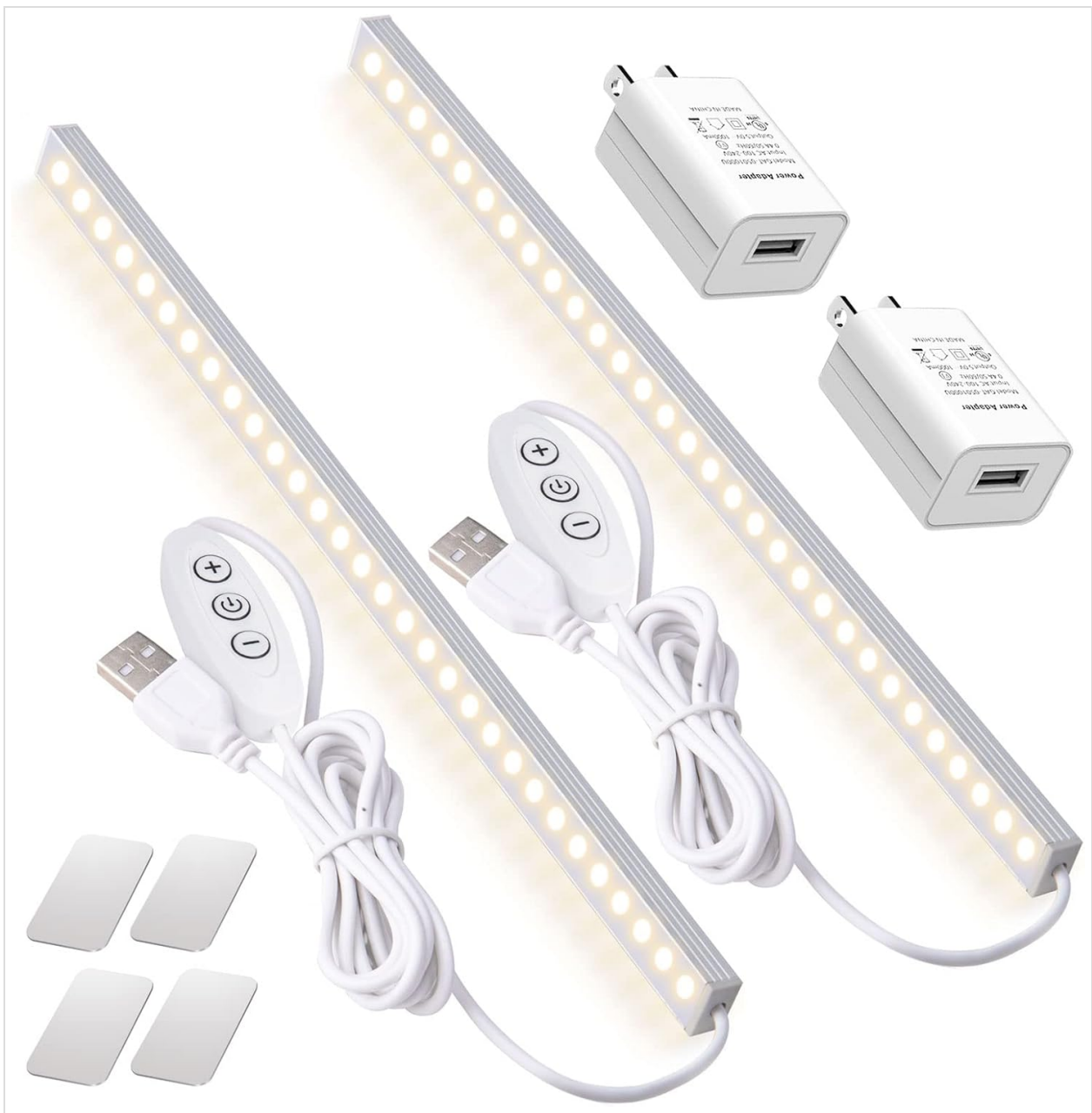
Image: Complete package contents, including two LED light bars, two USB cables with inline controllers, two USB wall adapters, four metal plates, and four adhesive pads.