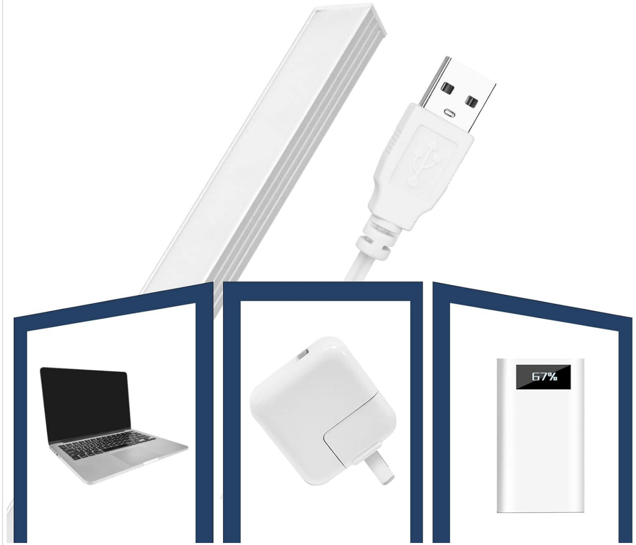
Image: Flexible USB power options for the light bar, including connection to a laptop, a standard USB wall adapter, or a portable power bank.