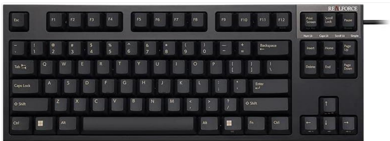
Image: Front view of the Realforce Topre R3S TKL Keyboard.

This manual provides comprehensive instructions for the Realforce Topre R3S TKL Keyboard (Topre 45g), Model R3SD31. It covers setup, operation, maintenance, troubleshooting, and detailed specifications to ensure optimal use of your keyboard. The Realforce R3S TKL keyboard features a space-saving tenkeyless form factor, laser-printed PBT keycaps, and full N-key rollover (NKRO) support, utilizing high-quality Topre switches for a unique typing experience.