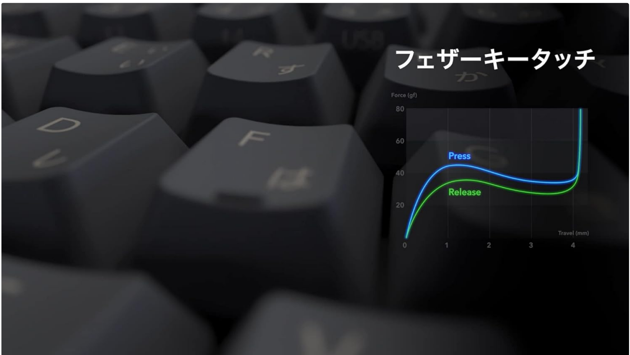
Image: A force curve graph demonstrating the 'feather-key touch' characteristic of Topre switches, showing the force required over key travel.

The Topre switches are designed to provide a 'feather-key touch' sensation, characterized by a smooth press and a distinct tactile bump without a harsh bottom-out. This design aims to reduce finger fatigue during extended typing sessions.