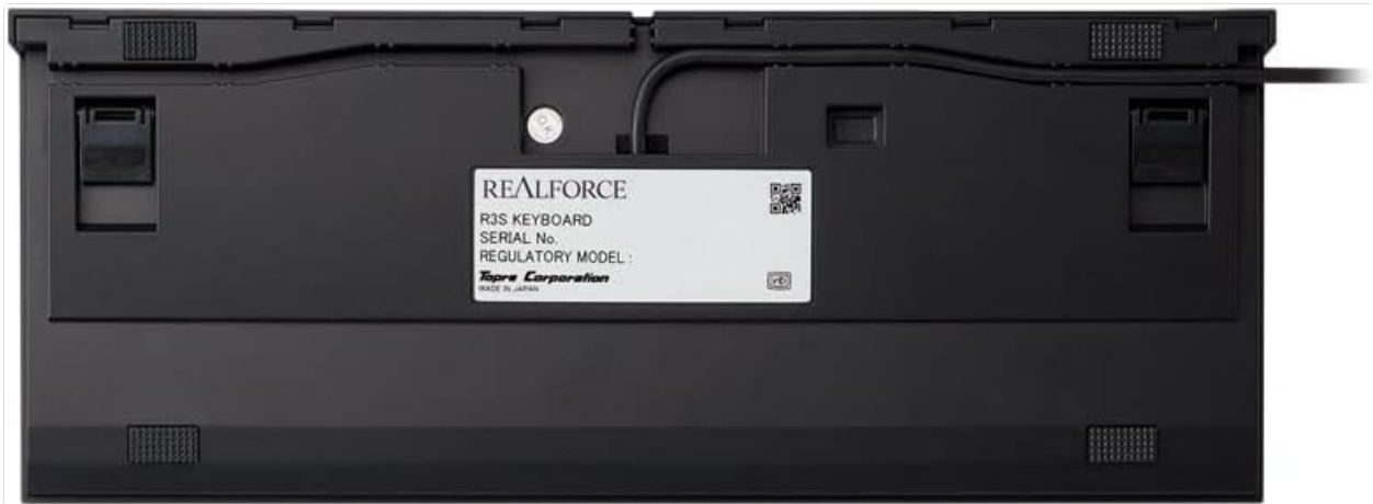
Image: Rear view of the Realforce R3S TKL Keyboard, illustrating the USB cable connection and the product label with model information.