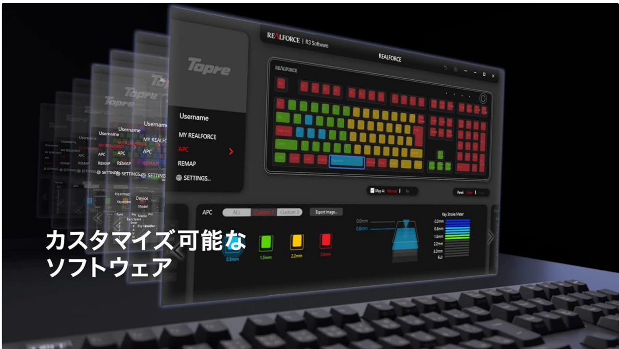
Image: Screenshot of the Realforce R3S customization software interface, showing options for actuation point adjustment and key remapping.

The Realforce R3S TKL Keyboard is supported by dedicated software that allows for advanced customization. This software enables users to adjust the actuation point per key, remap keys, and configure other settings to personalize their typing experience.