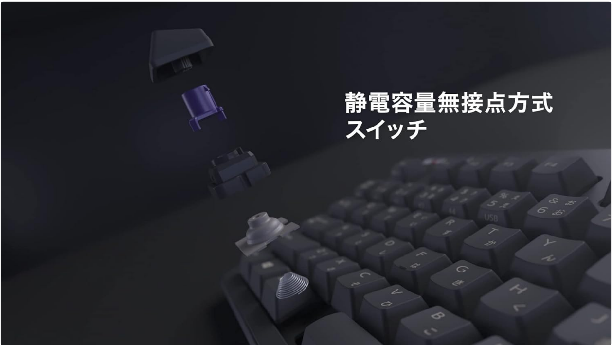
Image: An exploded view of a Topre switch, illustrating its internal components and non-contact design.