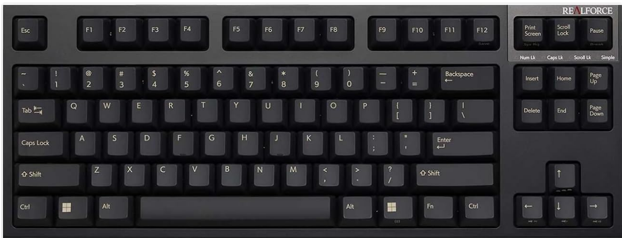
Image: Top-down view of the Realforce R3S TKL Keyboard, showing the QWERTY layout and 87 keys.

The keyboard features a standard QWERTY layout with 87 keys. Its tenkeyless (TKL) form factor provides a compact design while retaining essential keys for efficient typing. The Topre 45g switches offer a tactile typing experience.