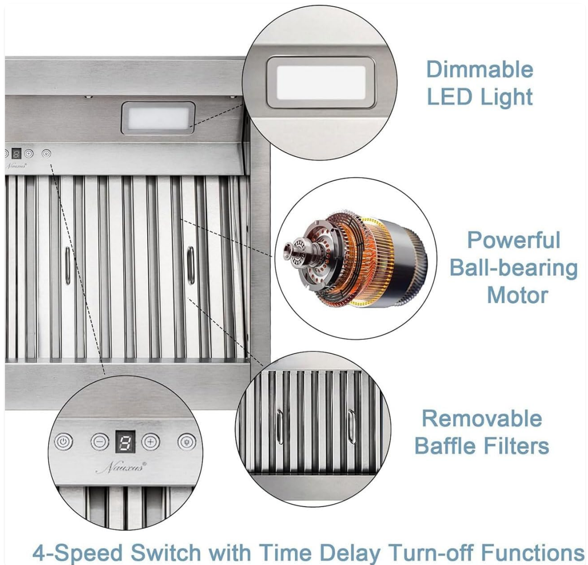
Image: Detailed view of the control panel and key features.