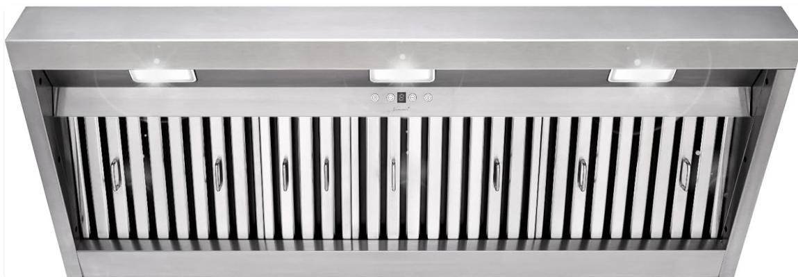
Image: Front view of the Akicon Range Hood Insert 48 Inch.

Thank you for choosing the Akicon Range Hood Insert 48 Inch, Model 19IL. This manual provides essential information for the safe and efficient installation, operation, and maintenance of your new kitchen appliance. Please read all instructions carefully before use and retain this manual for future reference.