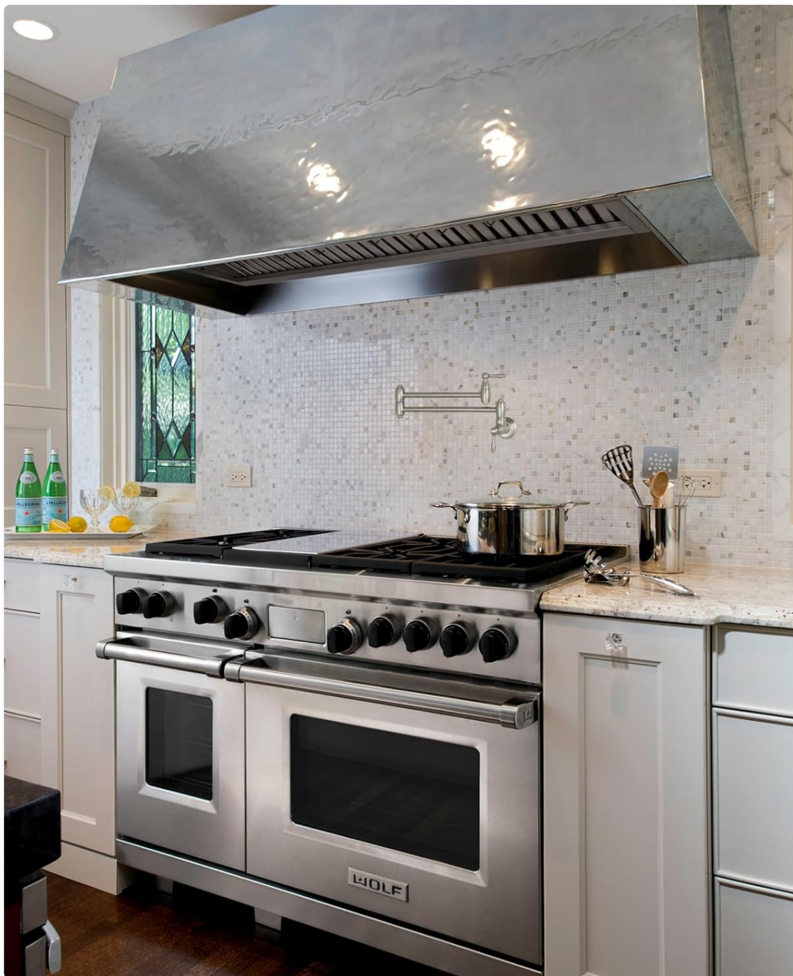
Image: Dishwasher-safe baffle filters for easy cleaning.