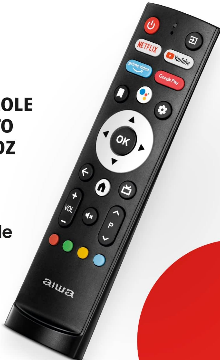
Figure 5.1: Aiwa Smart TV Remote Control. This image displays the remote control, emphasizing its voice command feature for easy navigation and content search.

Use sua voz para controlar sua Android TV