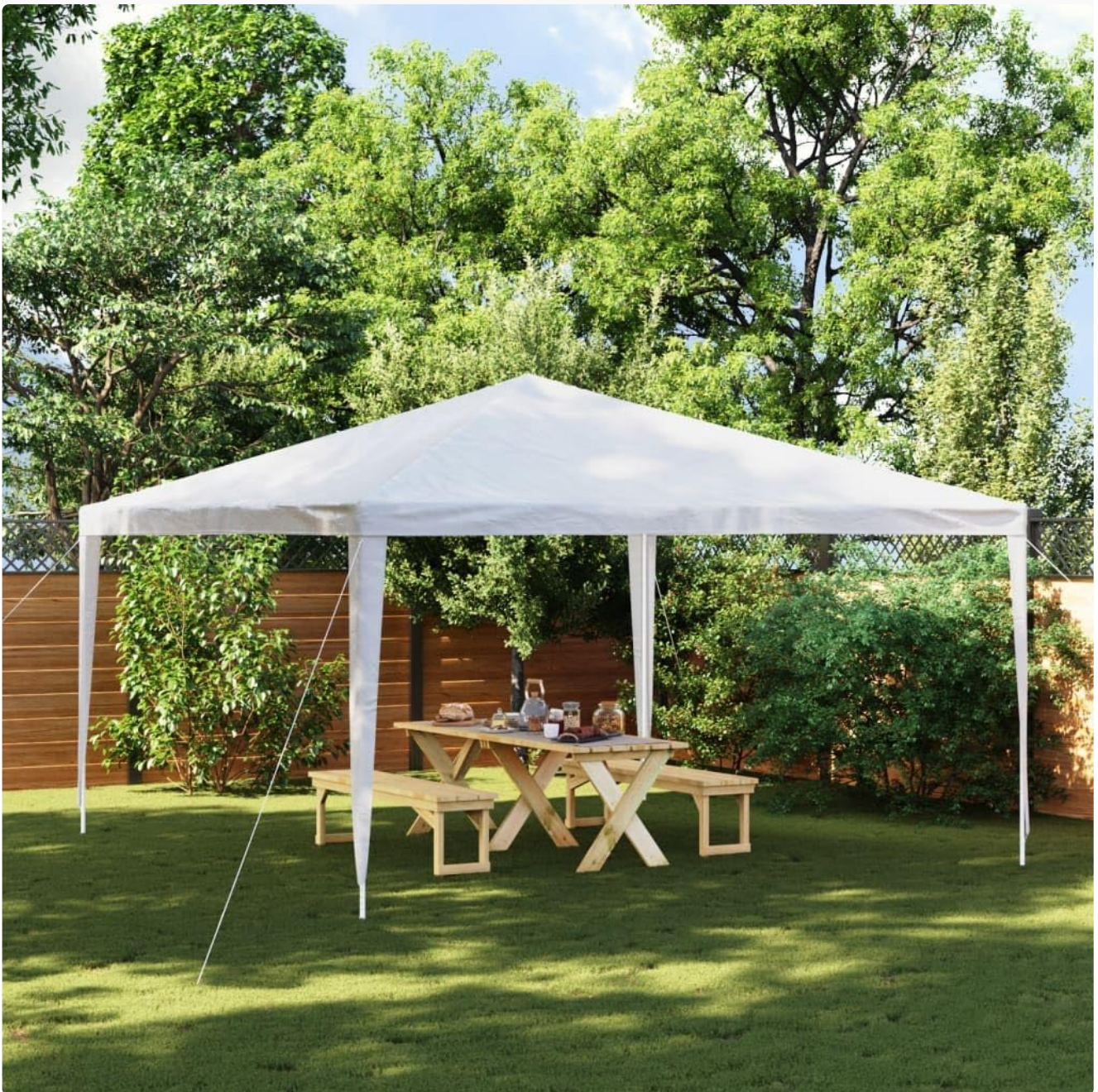
The vidaXL White Party Tent set up in a garden, providing shade and shelter for an outdoor gathering with a picnic table and benches underneath.