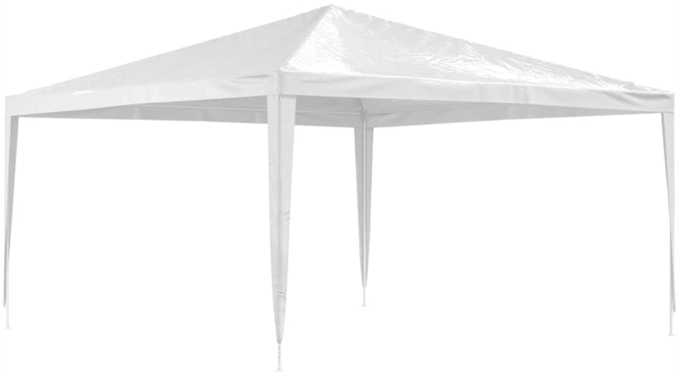
Image of the assembled vidaXL White Party Tent, showcasing its spacious design and white polyethylene canopy.