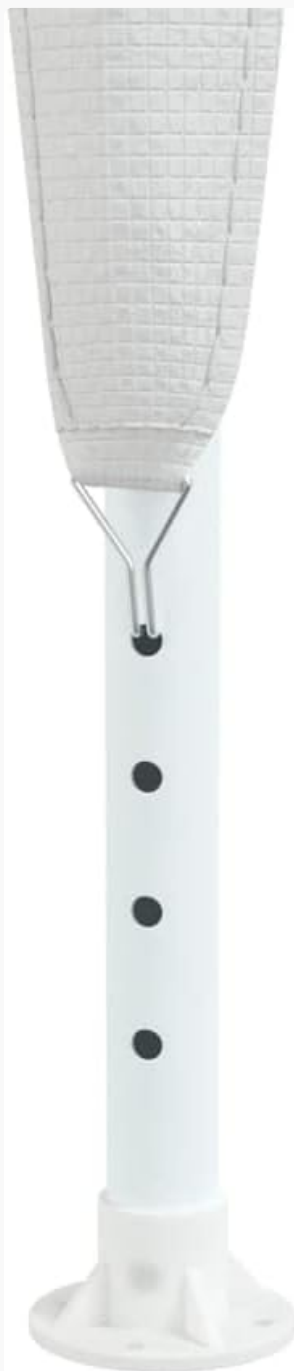
Detail image of a tent frame connection point, showing how the iron poles are joined to form the structure.