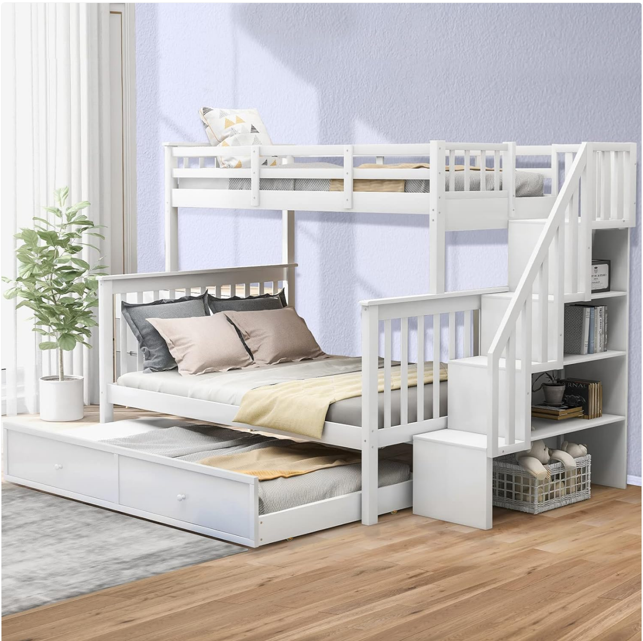
Figure 1: Tatub Twin Over Full Bunk Bed with Trundle and Staircase, fully assembled.