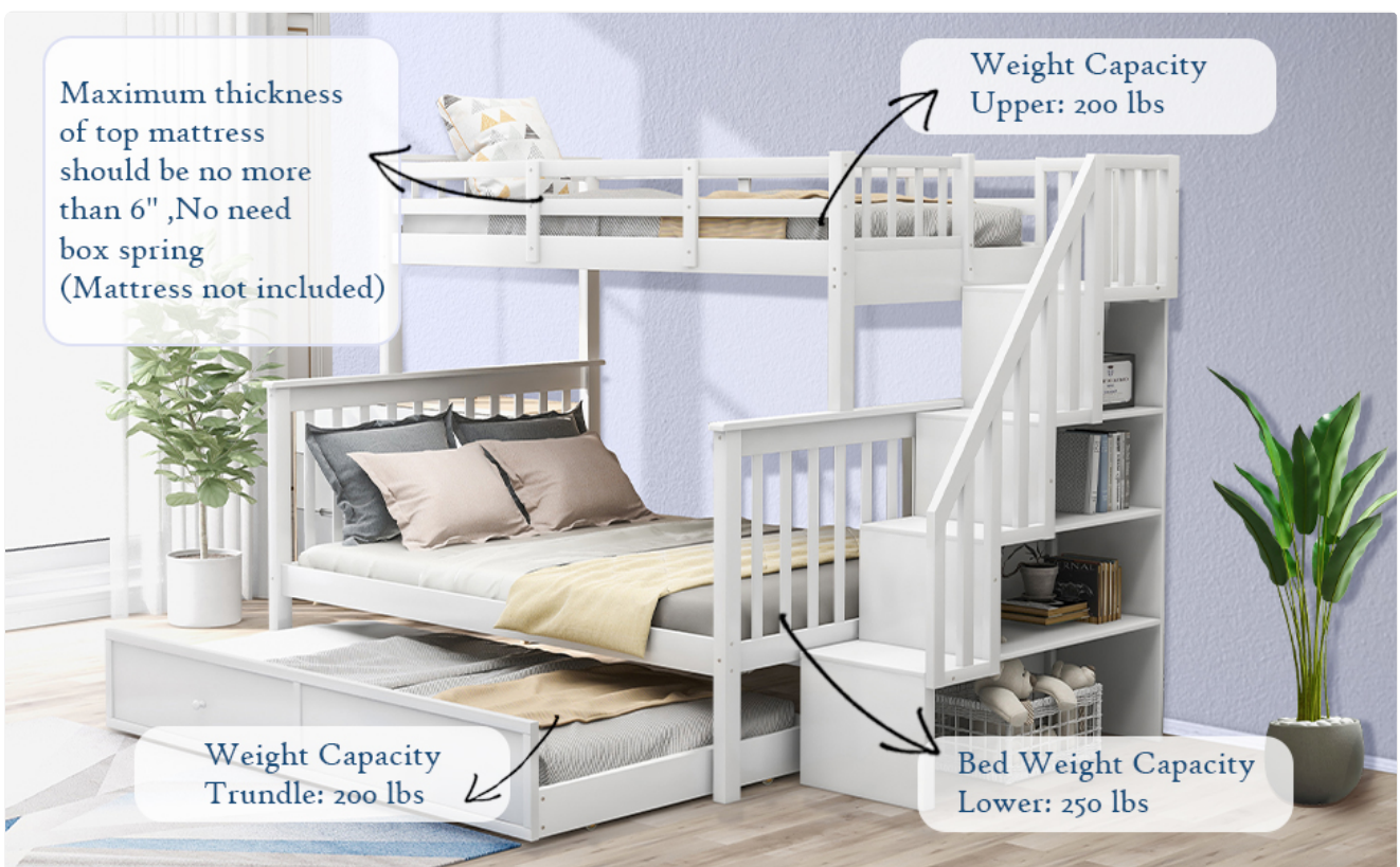
Figure 5: Features of the storage staircase, including shelves and handrail.