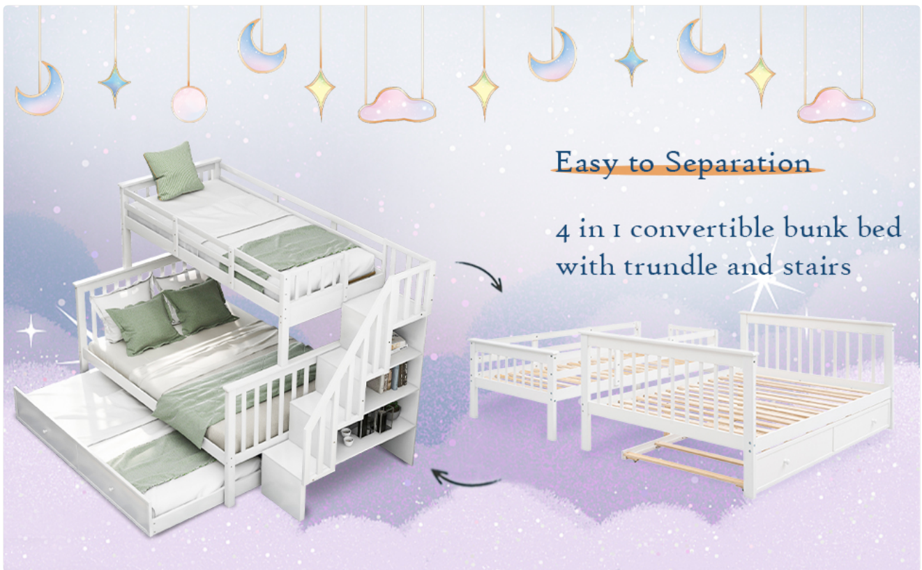
Figure 4: Details of the guard rails, storage staircase, and trundle.