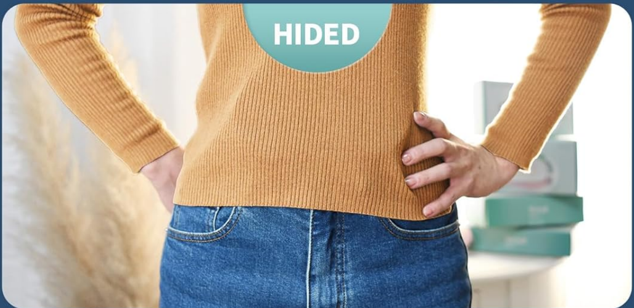
Figure 4.3: The thin profile allows the heating pad to be worn discreetly under clothing.