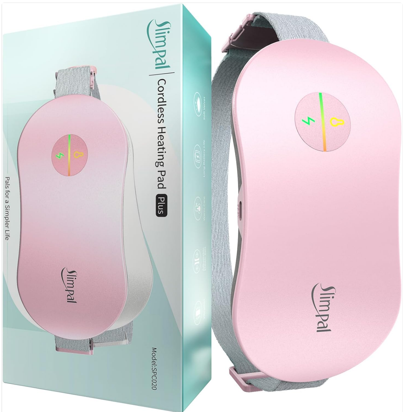
Figure 3.1: SimpPal SPC020 Cordless Heating Pad and its retail packaging.