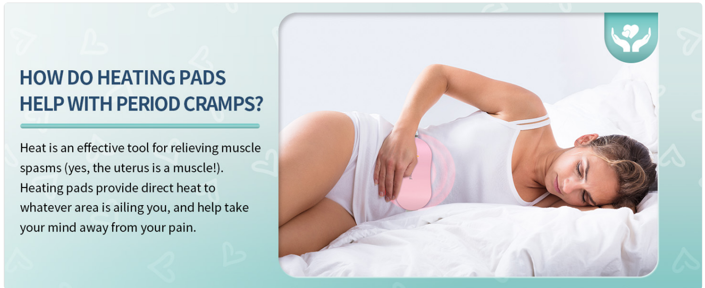
Figure 3.2: Explanation of how heat therapy aids in muscle relaxation and pain relief.

Heat therapy is recognized for its ability to promote circulation and relax muscles. The Slimpal SPC020 heating pad provides direct heat to the affected area, which can assist in alleviating discomfort and supporting relaxation.