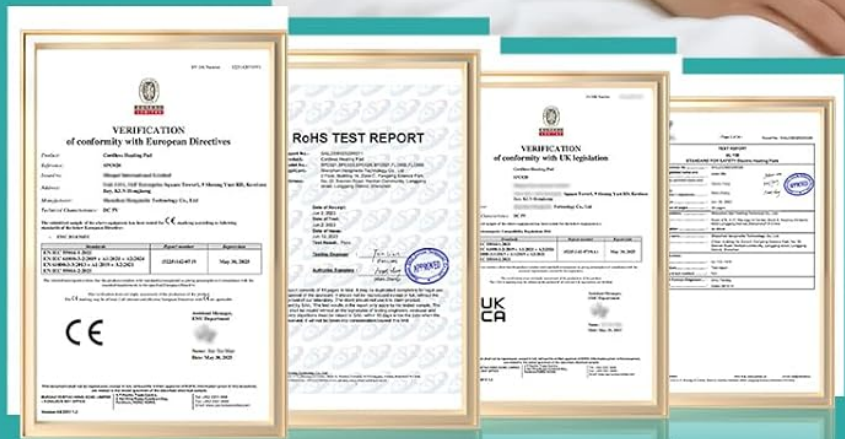
Figure 3.5: The device is certified by multiple international standards for safety and reliability.