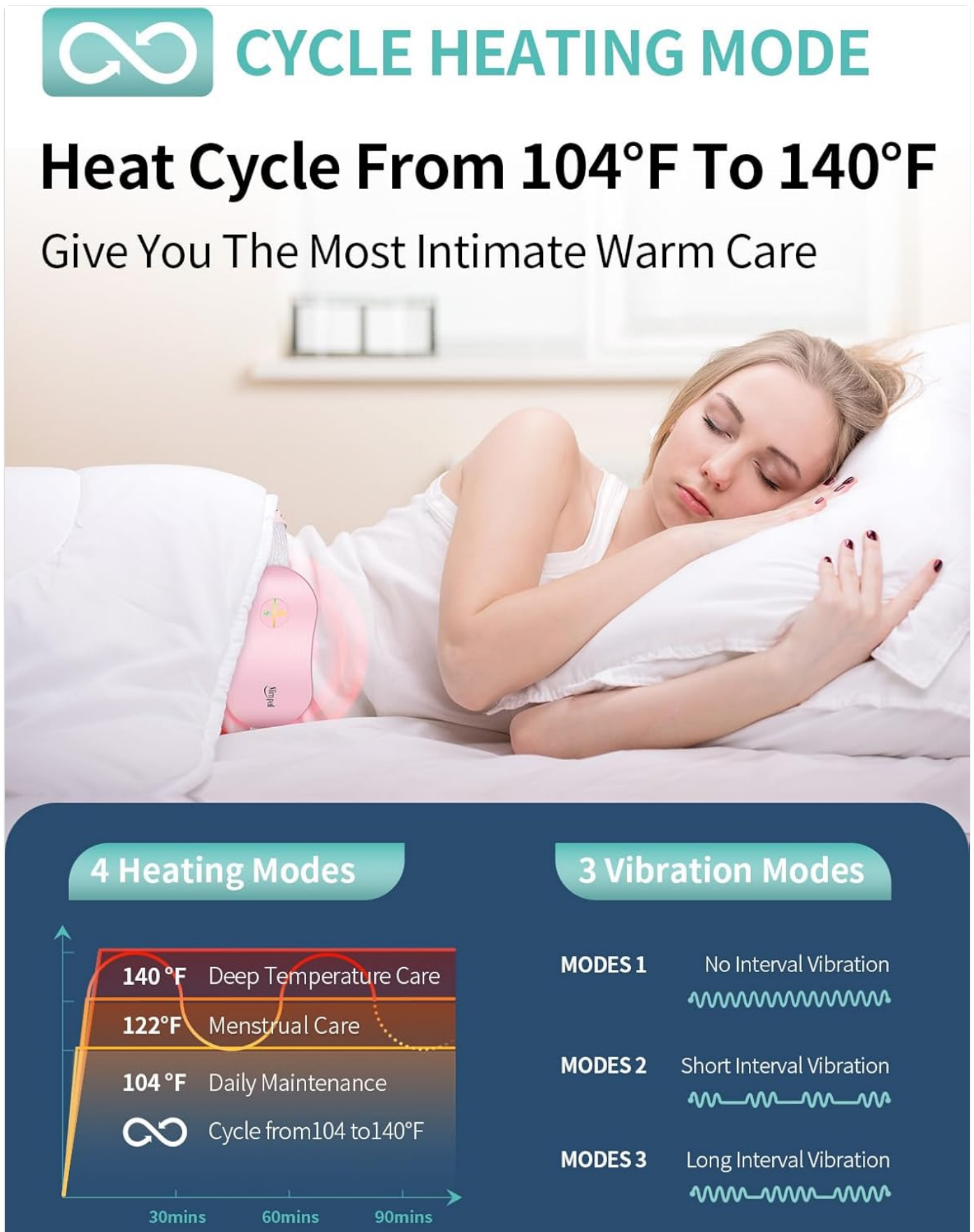
Figure 5.1: Overview of heat and vibration settings.

The Slimpal SPC020 features intuitive controls for heat and vibration settings.