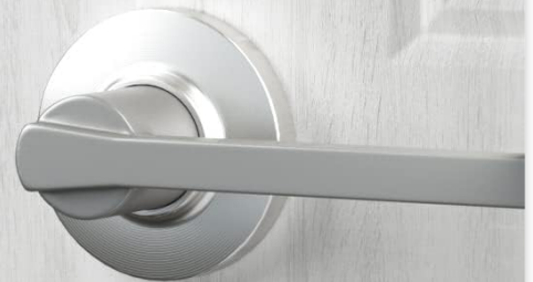
Image: Visual representation of the lock's capacity to store up to 200 different access codes for various users, including master, new user, and one-time codes.