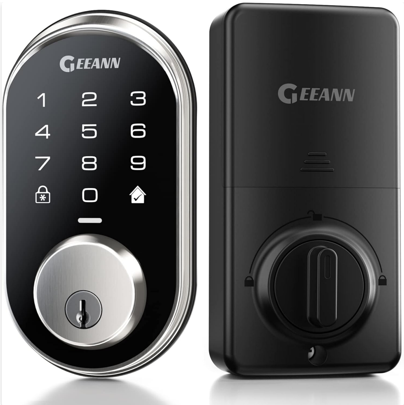
Image: Front and back view of the GEEANN Keyless Entry Door Lock, showcasing its sleek design and components.