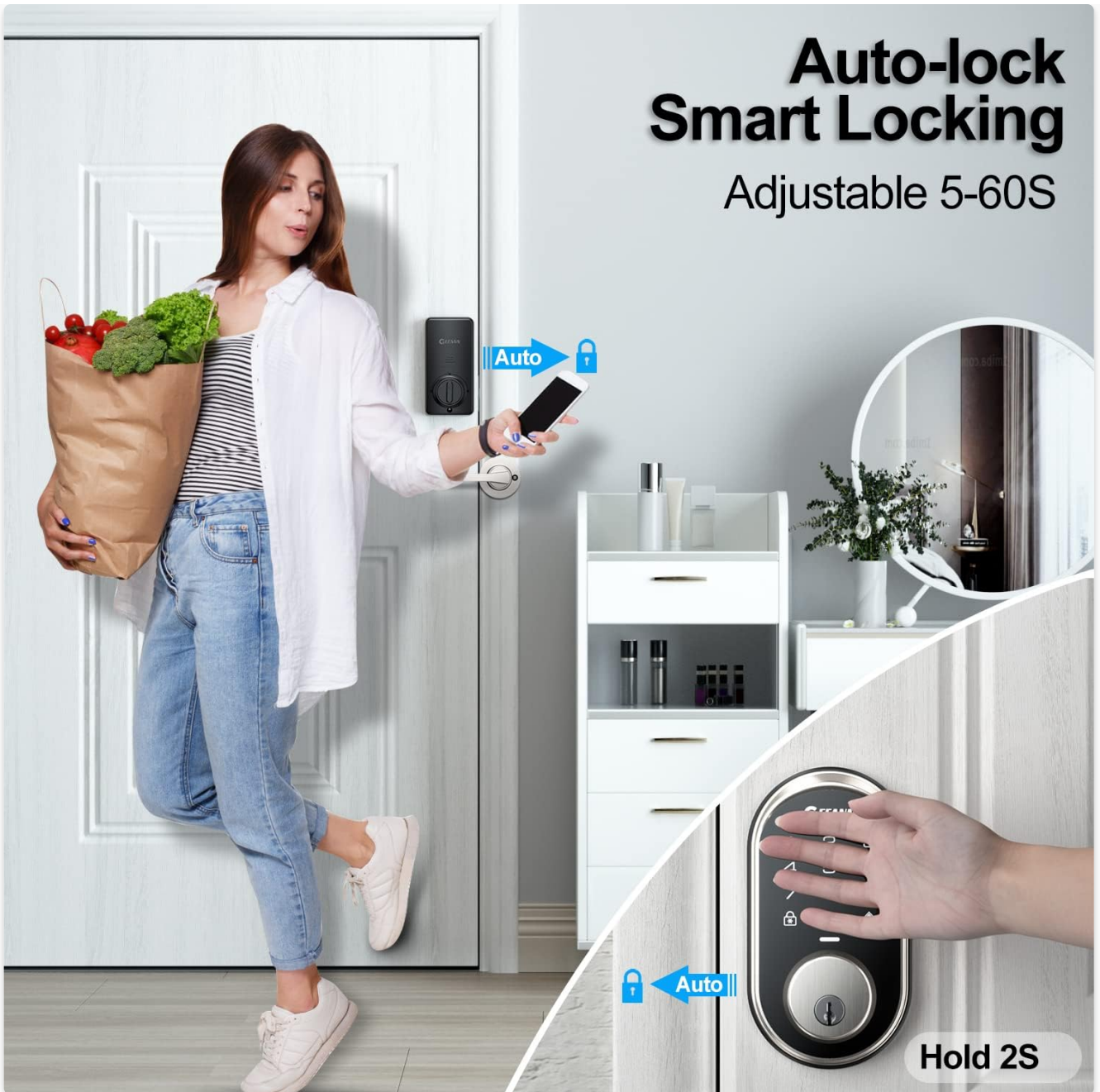
Image: Depiction of the auto-lock smart locking feature, showing how the lock can automatically secure the door after a set time.