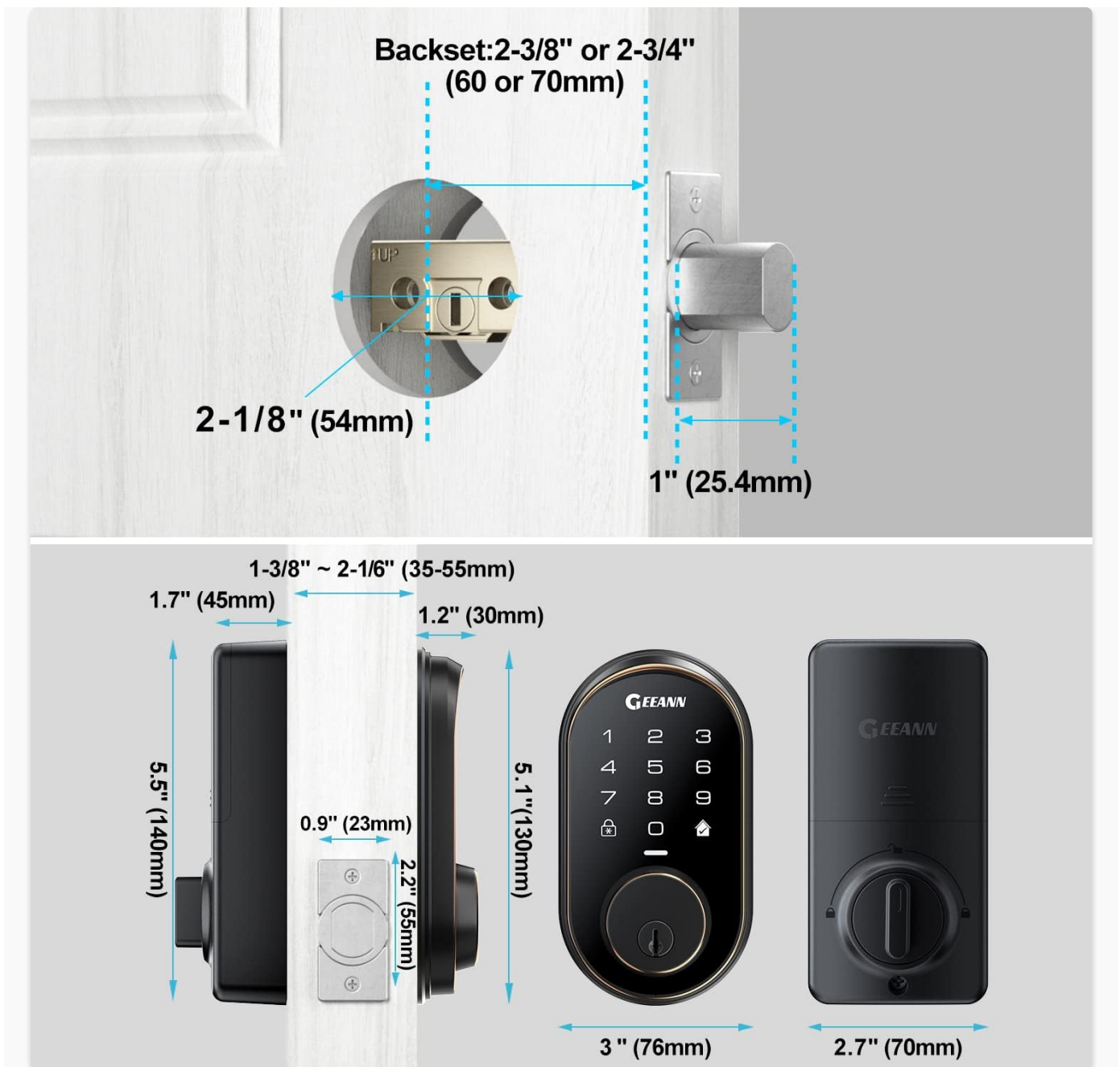
Image: Detailed diagram showing the dimensions of the lock components and required door measurements for installation.