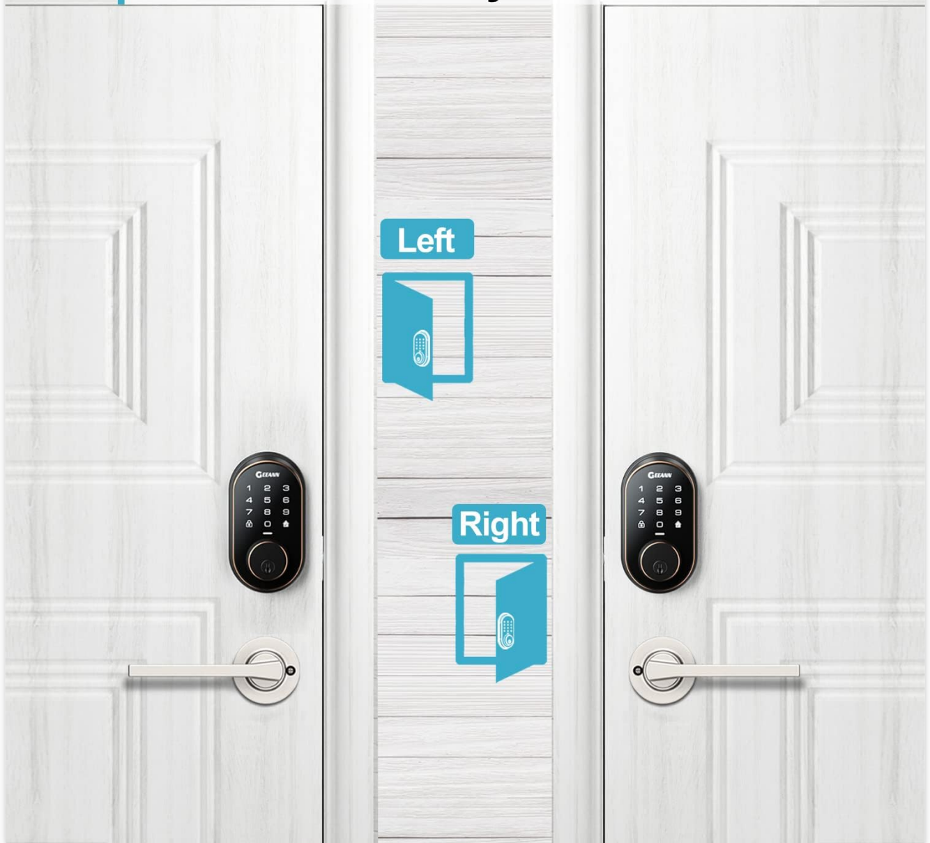
Image: Illustration demonstrating the lock's ability to automatically learn and identify the door's opening direction (left or right).