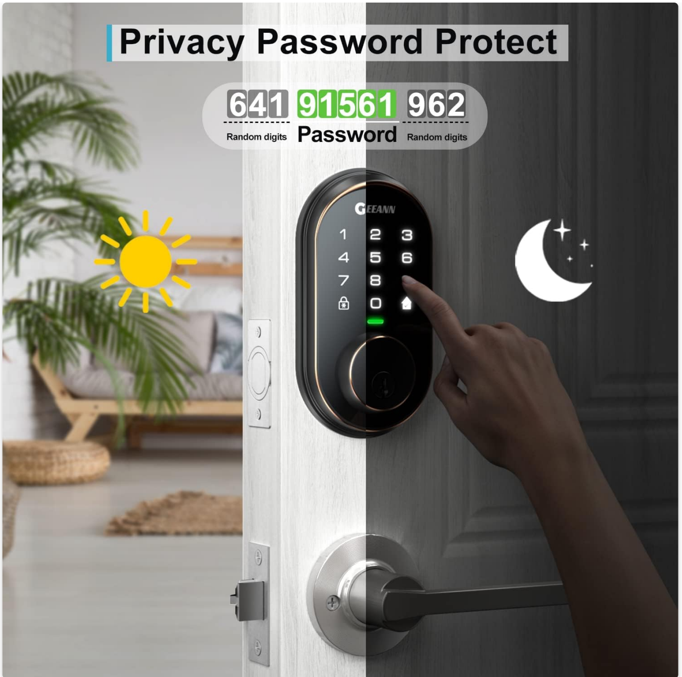
Image: Visual explanation of the privacy password protect feature, demonstrating how random digits can be added to obscure the actual code.

641 91561 962 Random digits Password Random digits