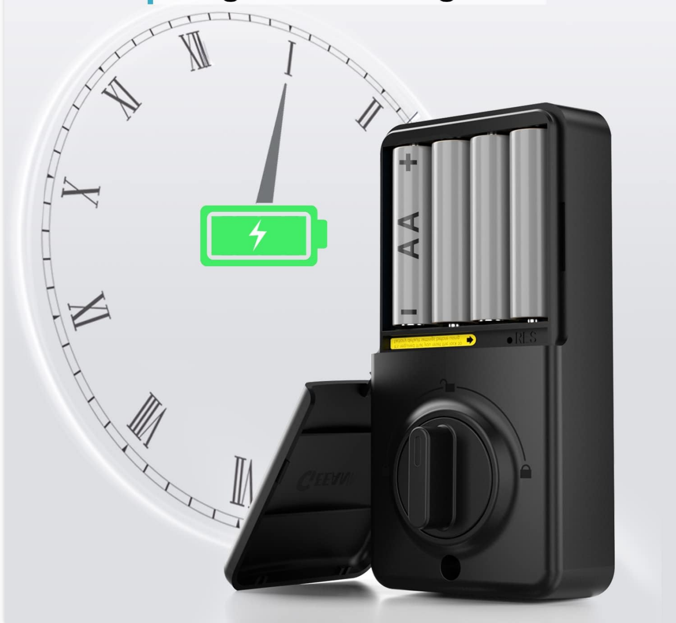
Image: Depiction of the battery compartment and an illustration of a clock, symbolizing the long-term working time provided by the batteries.