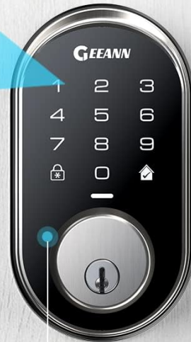
Image: Illustration highlighting the ultra-responsive touchscreen, backlit display, and button sound features of the lock.