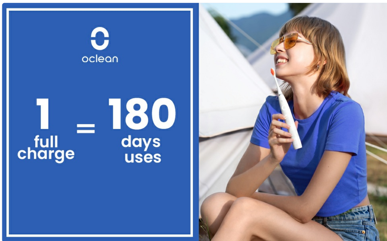
Image: A visual representation emphasizing the 180-day battery life of the Oclean Flow toothbrush from a single full charge.