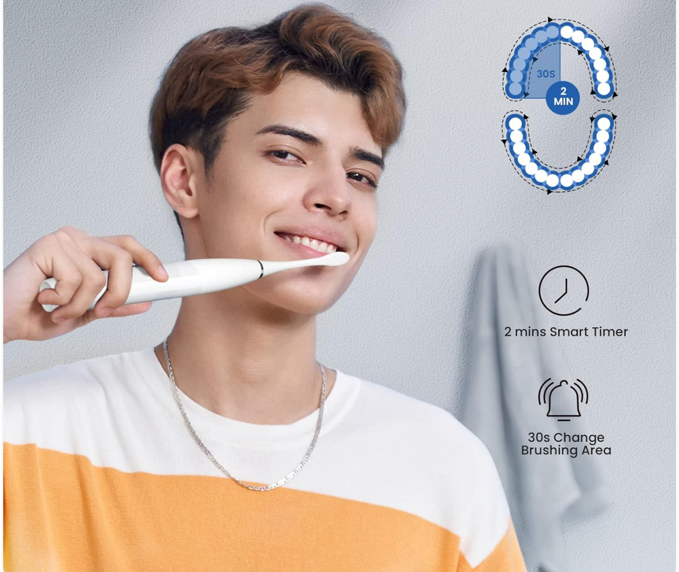
Image: A user demonstrating the Oclean Flow toothbrush, with visual aids explaining the 2-minute smart timer and 30-second zone change reminder for effective brushing.