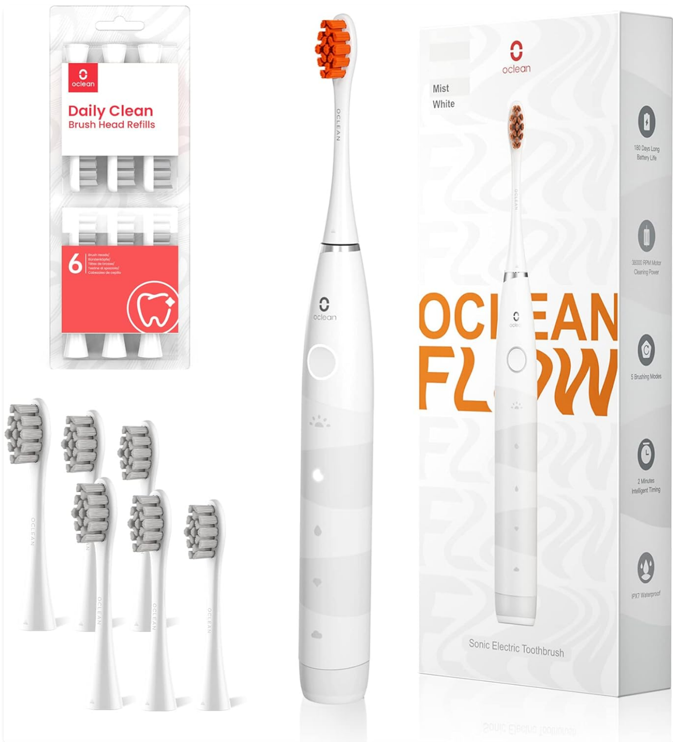
Image: The Oclean Flow Electric Toothbrush, showing the main handle, a pack of 6 replacement brush heads, and an additional brush head attached to the toothbrush, along with the product packaging.