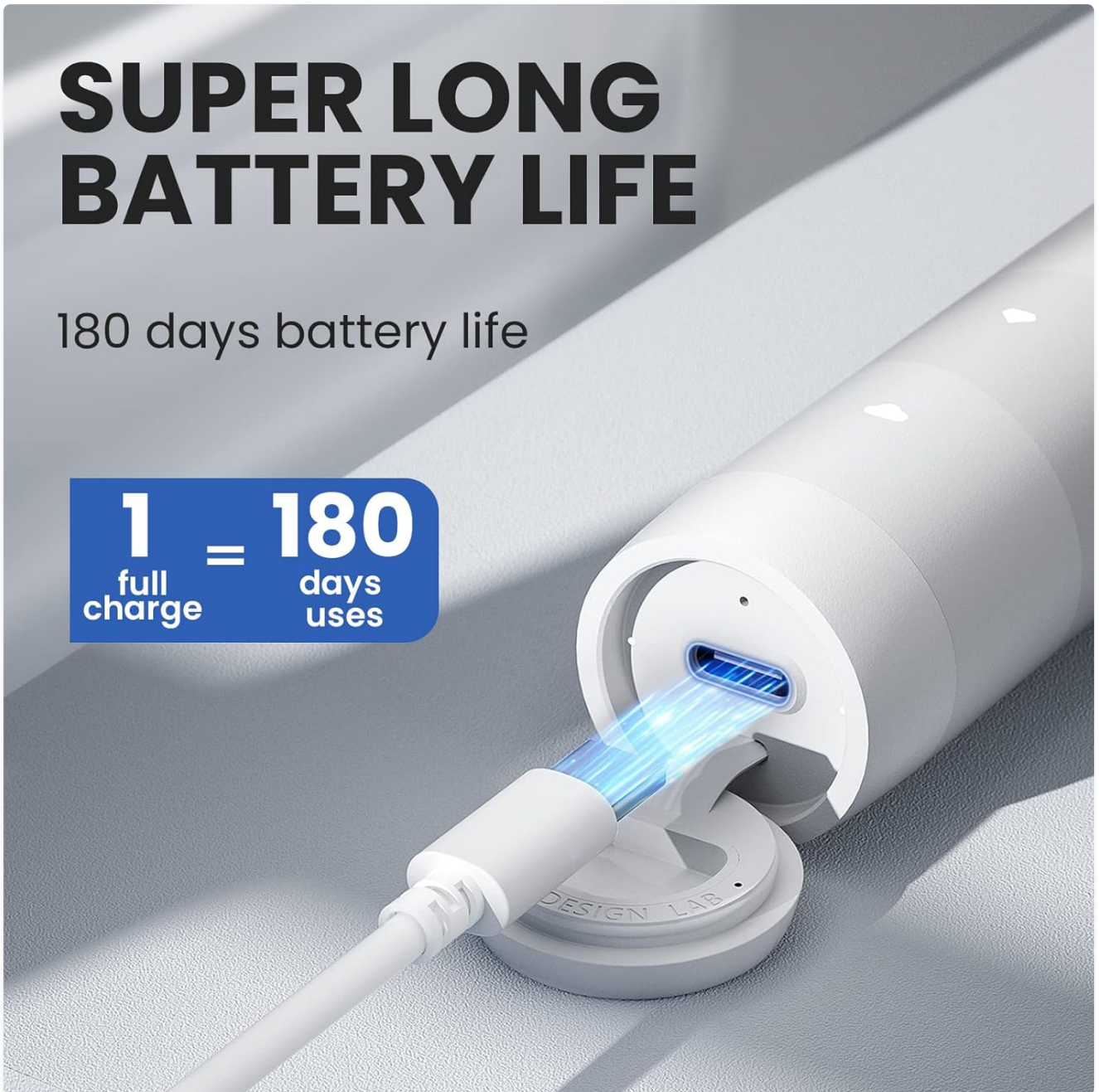
Image: A close-up view of the Oclean Flow toothbrush's USB-C charging port with the cable inserted, illustrating its long battery life.