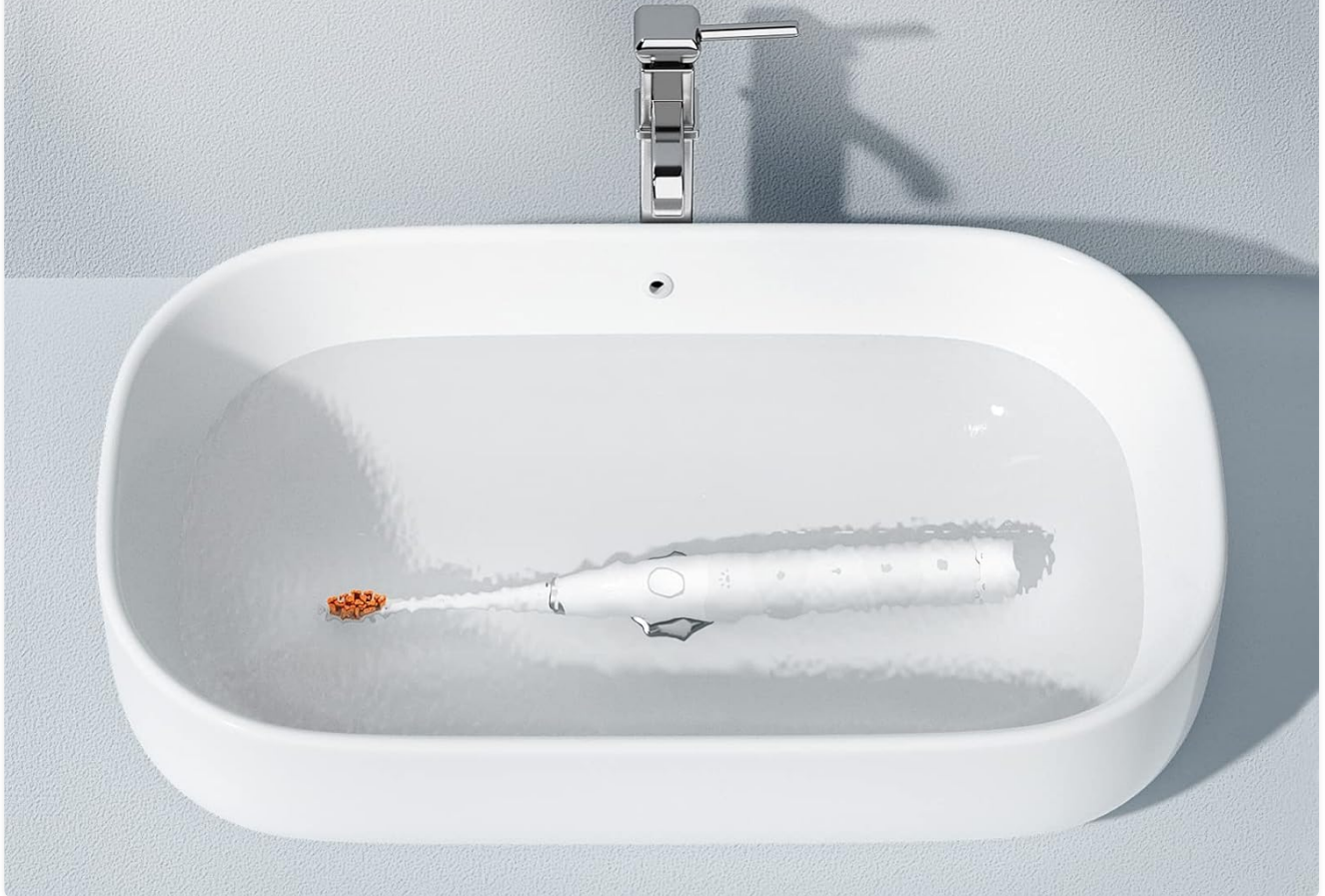
Image: The Oclean Flow toothbrush fully submerged in water, illustrating its IPX7 waterproof capability for easy cleaning.