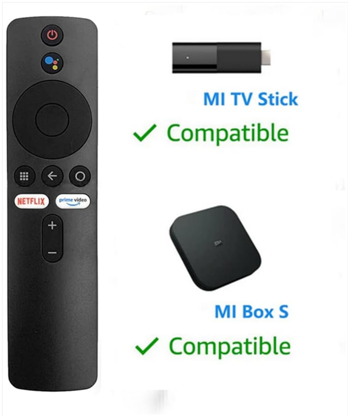
Image: The XMRM-006 remote control shown alongside a Xiaomi MI TV Stick and a Xiaomi MI Box S, indicating compatibility.