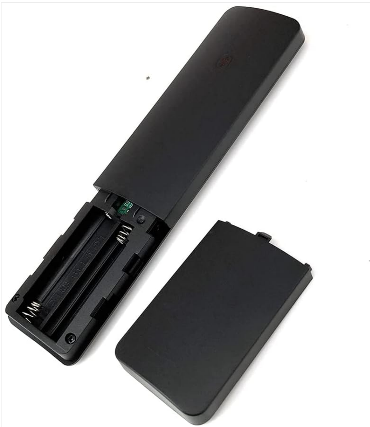
Image: View of the remote control with the battery cover removed, illustrating the correct orientation for inserting AA batteries.