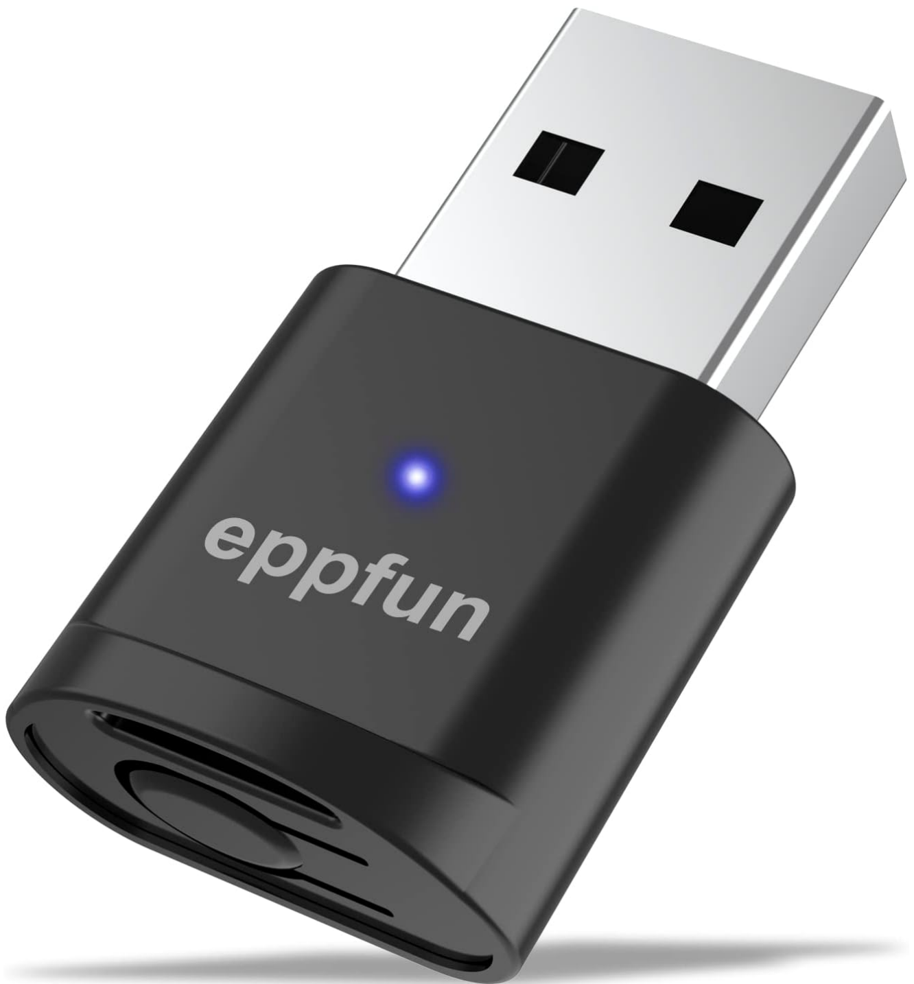
Figure 1: eppfun AK3040Plus USB Bluetooth 5.2 Transmitter