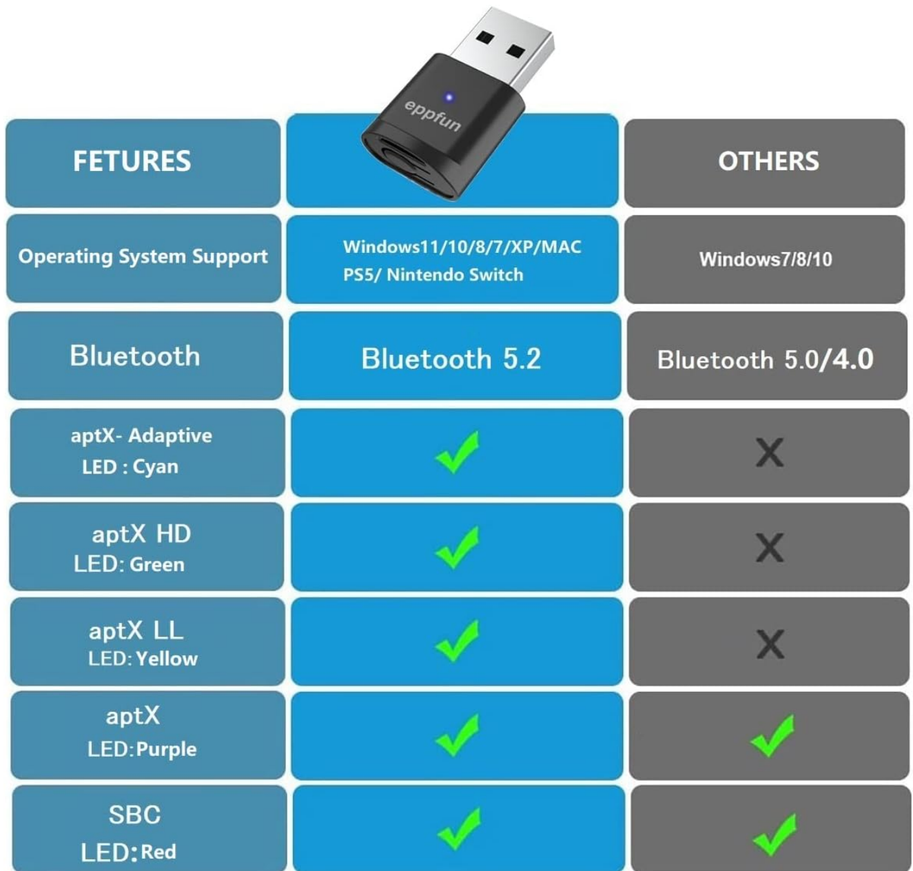
Figure 6: Feature Comparison Table