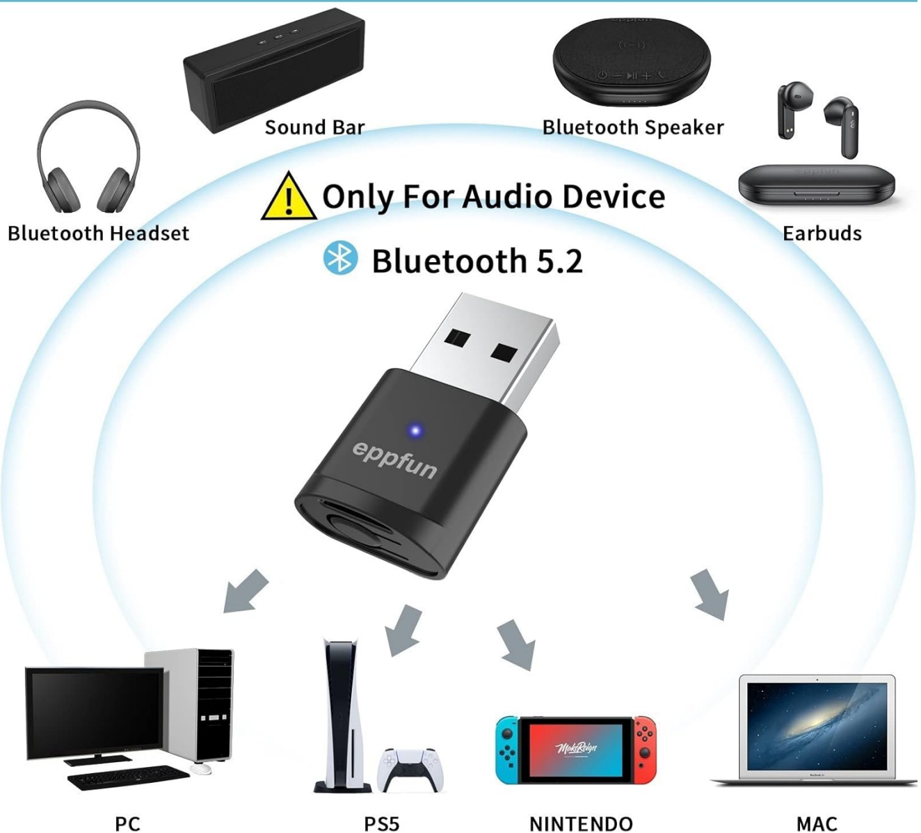
Figure 5: Compatible Devices for AK3040Plus