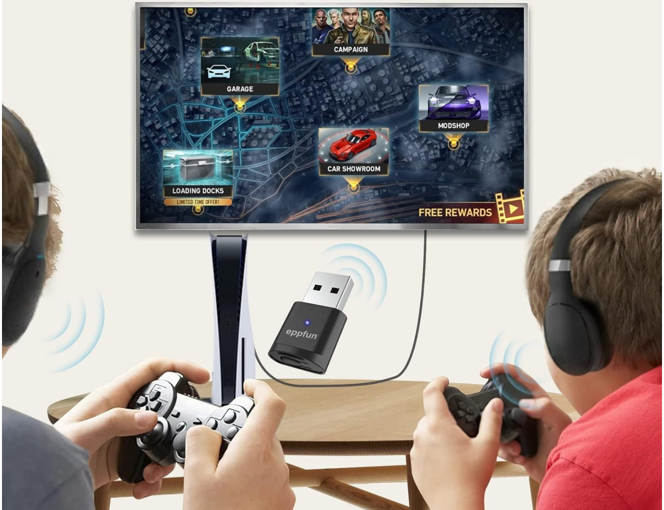
Figure 3: Using the AK3040Plus with a PS5 for shared audio