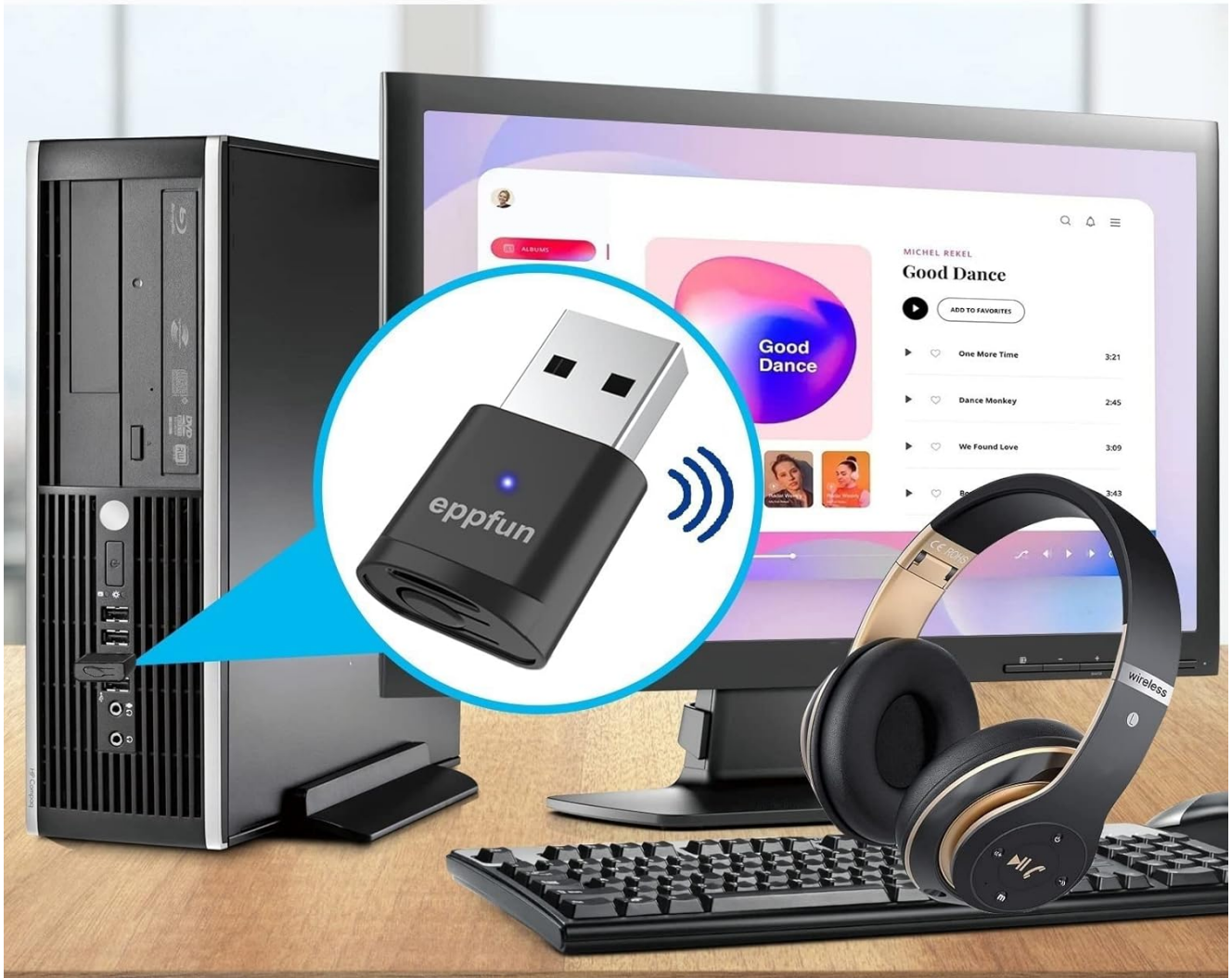
Figure 2: Connecting the AK3040Plus to a PC