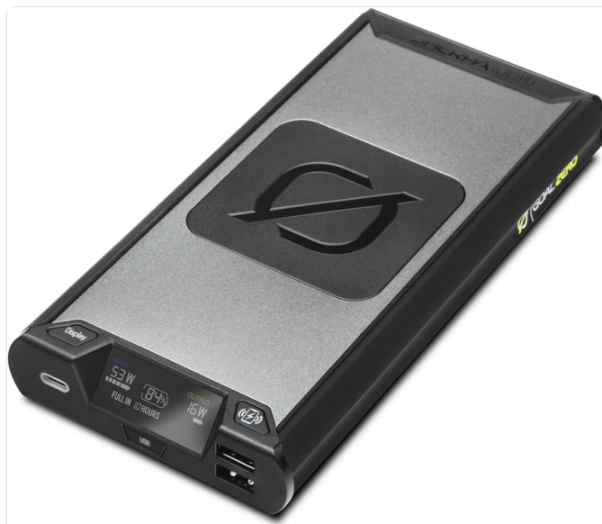
Figure 1: Goal Zero Sherpa 100PD Portable Power Bank

The Goal Zero Sherpa 100PD is a high-capacity portable power bank designed to keep your essential devices charged on the go. Its robust construction and versatile charging options make it ideal for travel, remote work, and outdoor adventures. This manual provides detailed instructions for setup, operation, maintenance, and troubleshooting to ensure optimal performance of your Sherpa 100PD.