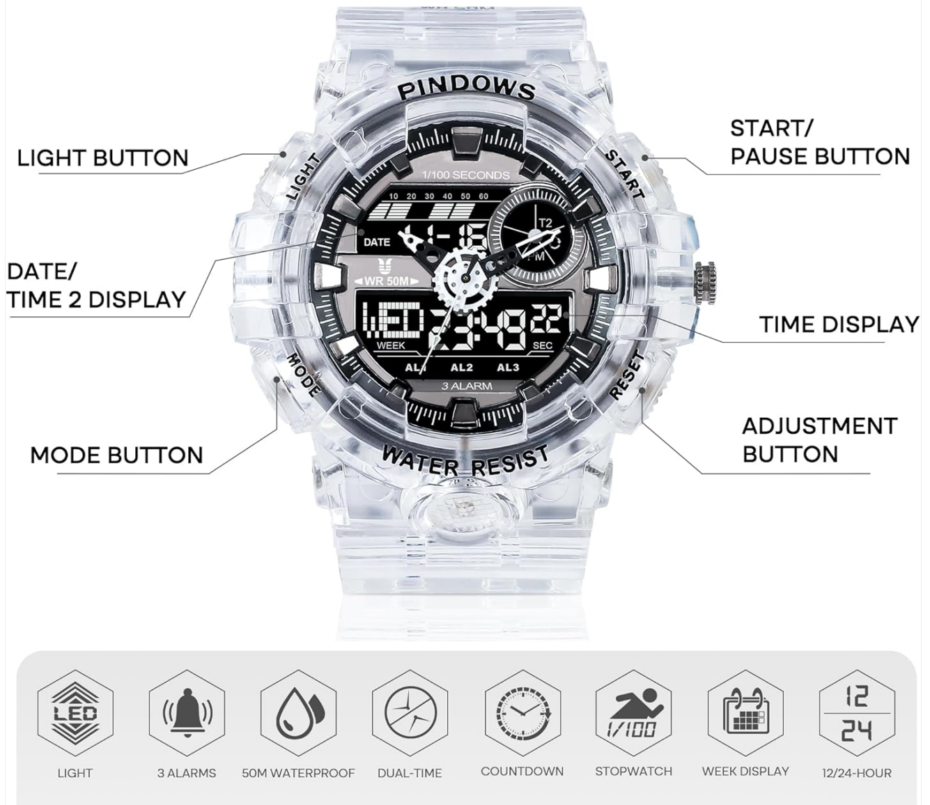
Figure 2.1: Watch Button and Display Layout

This image illustrates the front view of the PINDOWS Digital Sports Watch, highlighting the location and function of its various buttons and display segments. The 'LIGHT' button is on the top left, 'MODE' on the bottom left, 'START/PAUSE' on the top right, and 'ADJUSTMENT' on the bottom right. The main display shows time, date, and other indicators.