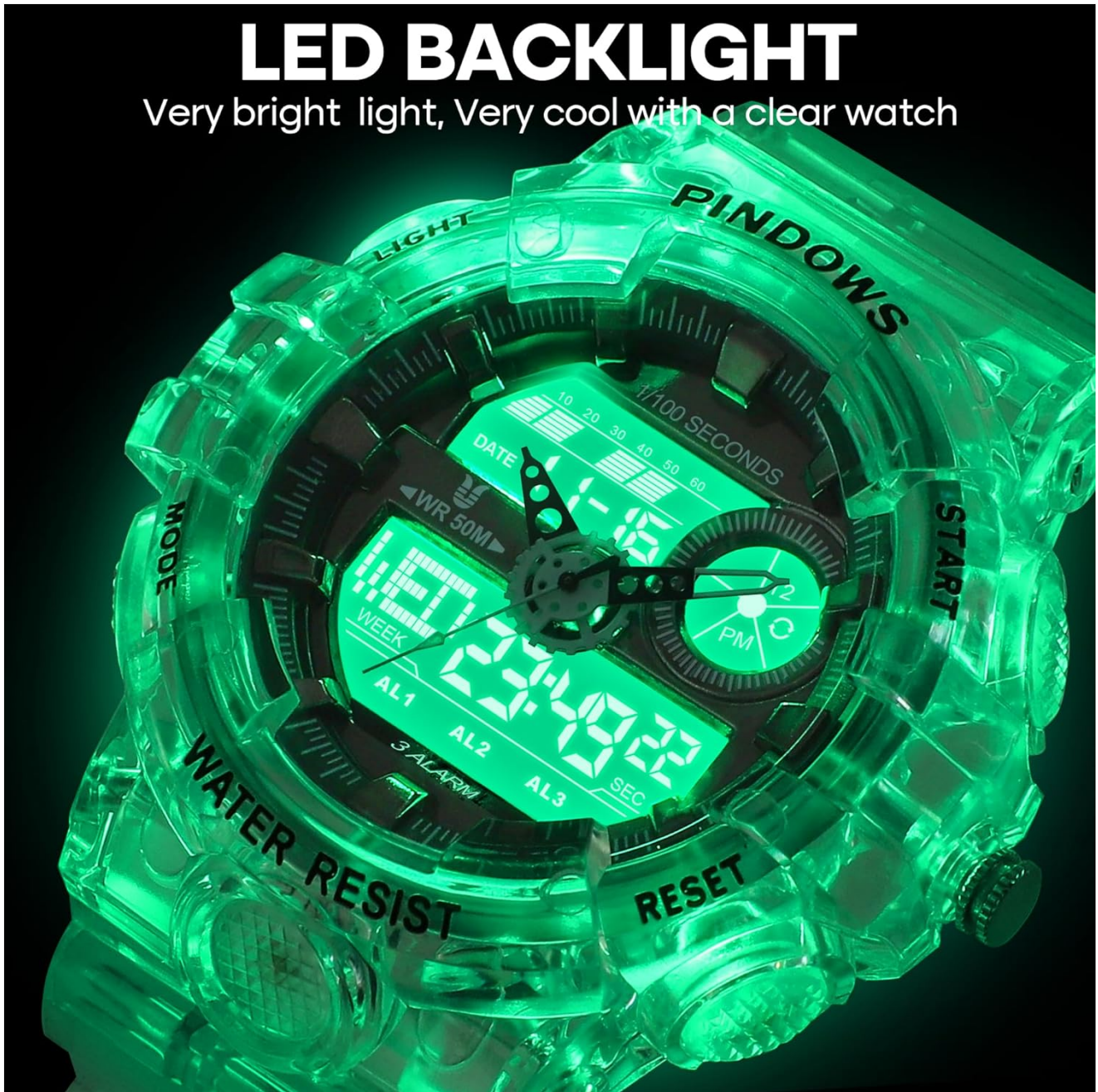
Figure 4.1: LED Backlight in Use

Press the LIGHT button (top left) to illuminate the display. The backlight will remain on for a few seconds.