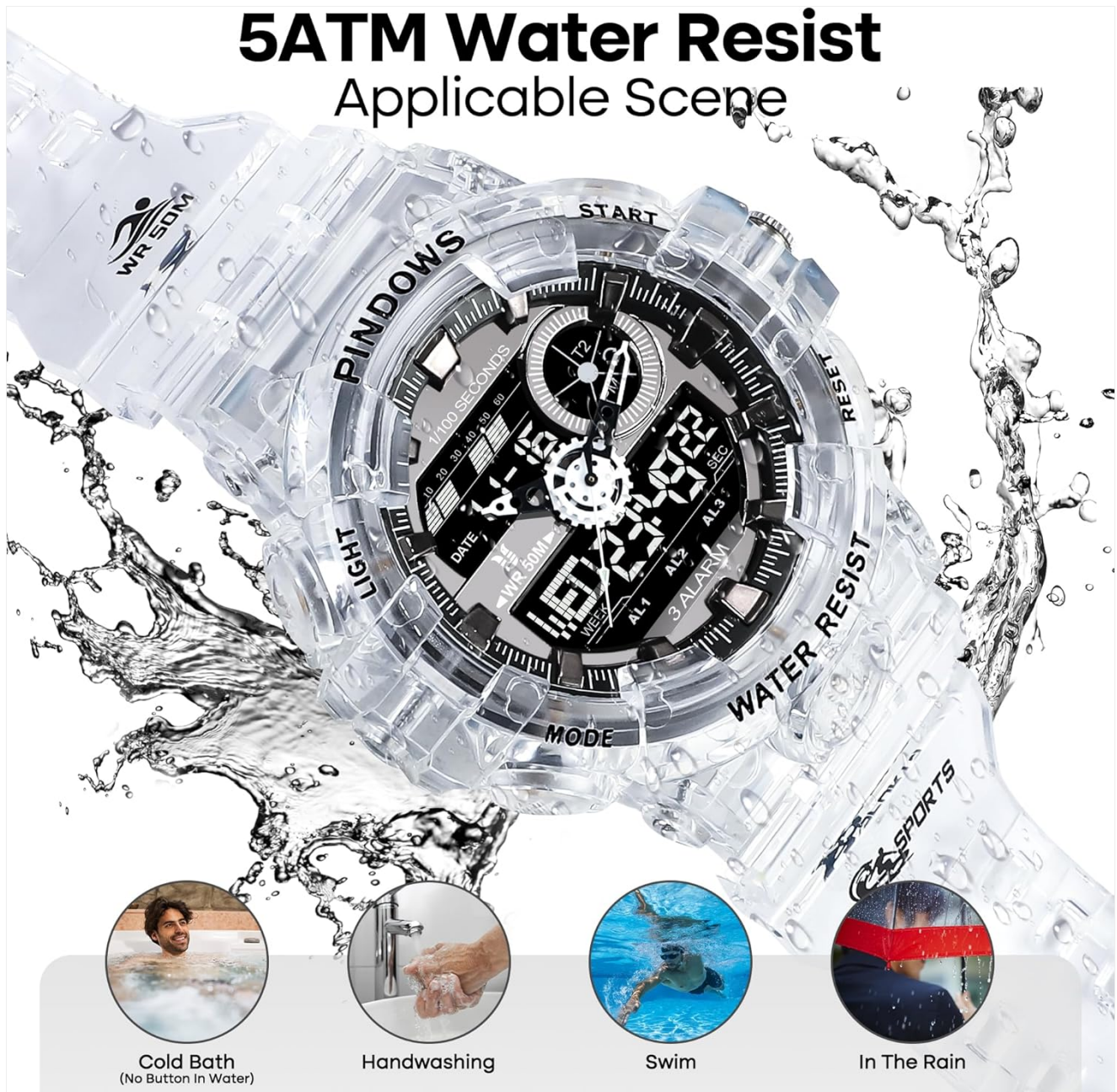
Figure 5.1: 5ATM Water Resistance Applicable Scenes

This visual guide illustrates various scenarios where the PINDOWS Digital Sports Watch's 5ATM water resistance is applicable, including cold baths, handwashing, swimming, and use in the rain. It emphasizes that the watch is designed to withstand splashes and brief immersion in water, but not hot water or button pressing underwater.