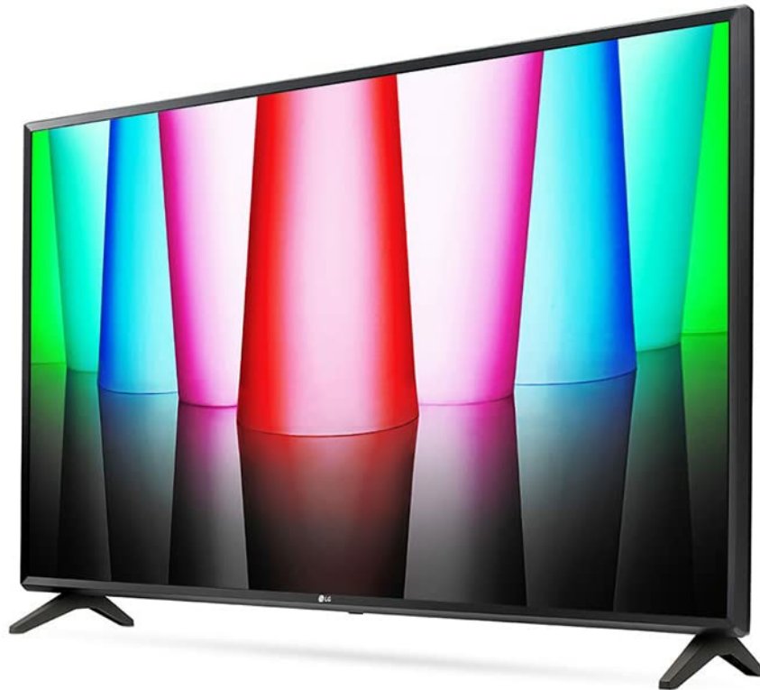
Figure 4.2.1: Angled view of the LG 32LQ570BPSA TV with table-top stands.

If you are not wall-mounting the TV, attach the table-top stands. Place the TV face down on a soft, clean surface to prevent screen damage. Align each stand component with the corresponding slots on the bottom of the TV and secure them with the provided screws.