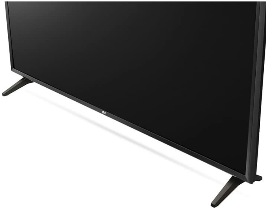
Figure 4.2.2: Close-up of the TV stand base for proper installation.