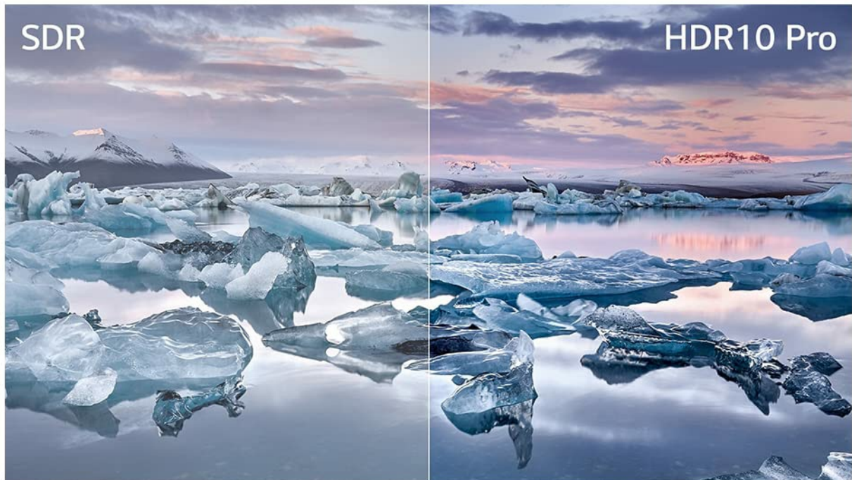
Figure 5.4.1: Visual comparison of SDR and HDR10 Pro picture quality.

Access the TV's settings menu to adjust picture modes (e.g., Standard, Vivid, Cinema), brightness, contrast, and sound modes (e.g., Standard, Cinema, Sports). The TV supports HDR10 Pro for enhanced contrast and color with compatible content.