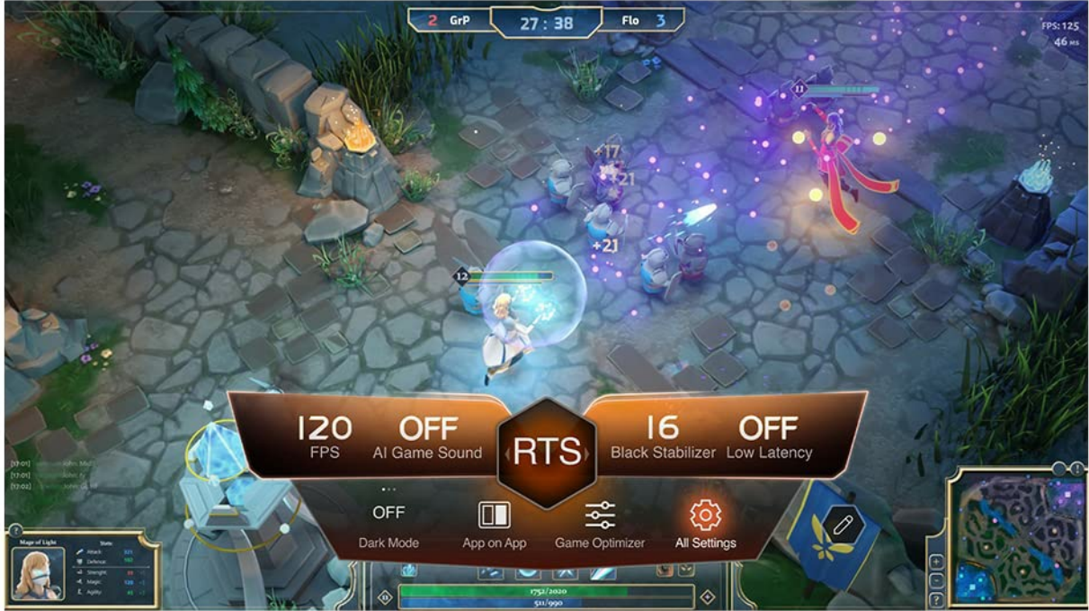
Figure 5.5.1: Game Optimizer settings interface.