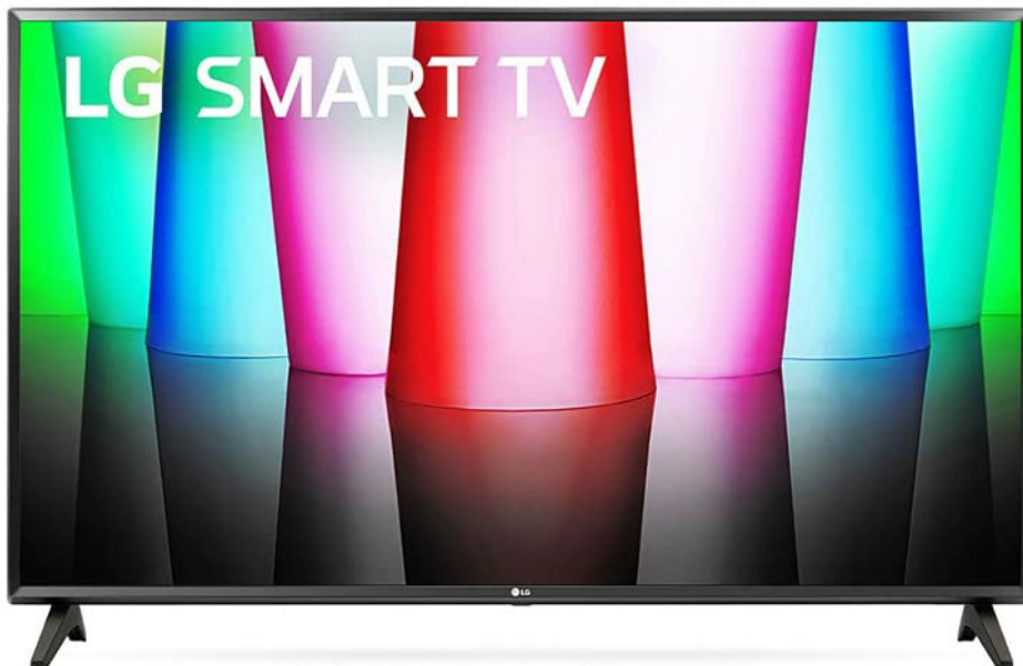
Figure 5.3.1: The LG 32LQ570BPSA Smart LED TV in operation.

Your LG TV runs on the WebOS operating system, providing access to a variety of smart features and applications. Connect your TV to the internet via Wi-Fi to access streaming services like Netflix, YouTube, and Amazon Instant Video, as well as a web browser.