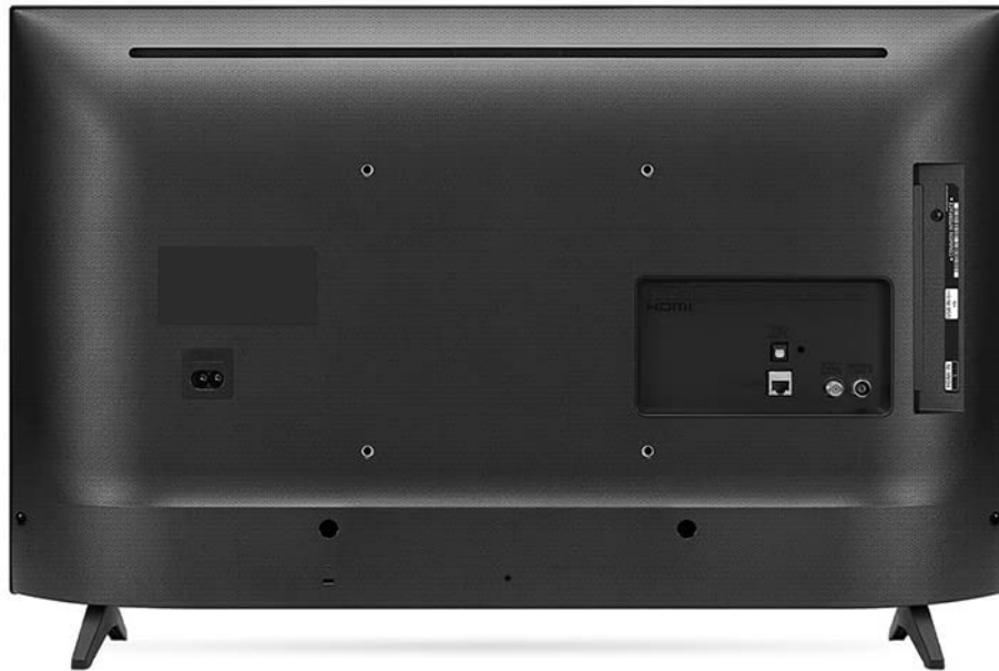
Figure 4.4.1: Rear panel of the TV with various input/output ports.