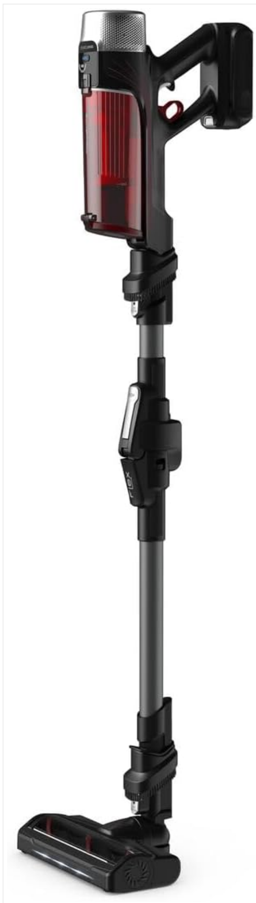
Image: The Rowenta X-Force Flex 9.60 RH2078 cordless stick vacuum cleaner fully assembled and ready for use.