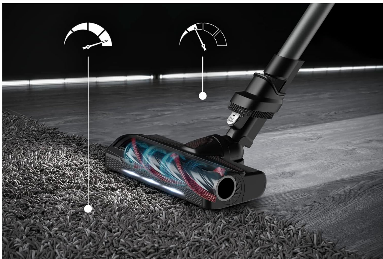
Image: The Rowenta X-Force Flex 9.60 RH2078 cordless stick vacuum cleaner with its various attachments and components laid out.