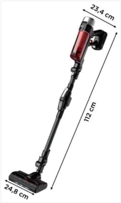
Image: Diagram showing the dimensions of the Rowenta X-Force Flex 9.60 RH2078, including height, width, and depth measurements.