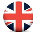
Figure 6: Information regarding Reflex Active's UK-based customer support.

OUR UK SUPPORT TEAM ARE ONLY A PHONE CALL AWAY. WE'LL BE HAPPY TO HELP YOU GET THE VERY BEST FROM YOUR REFLEX ACTIVE SMART WATCH & APP.