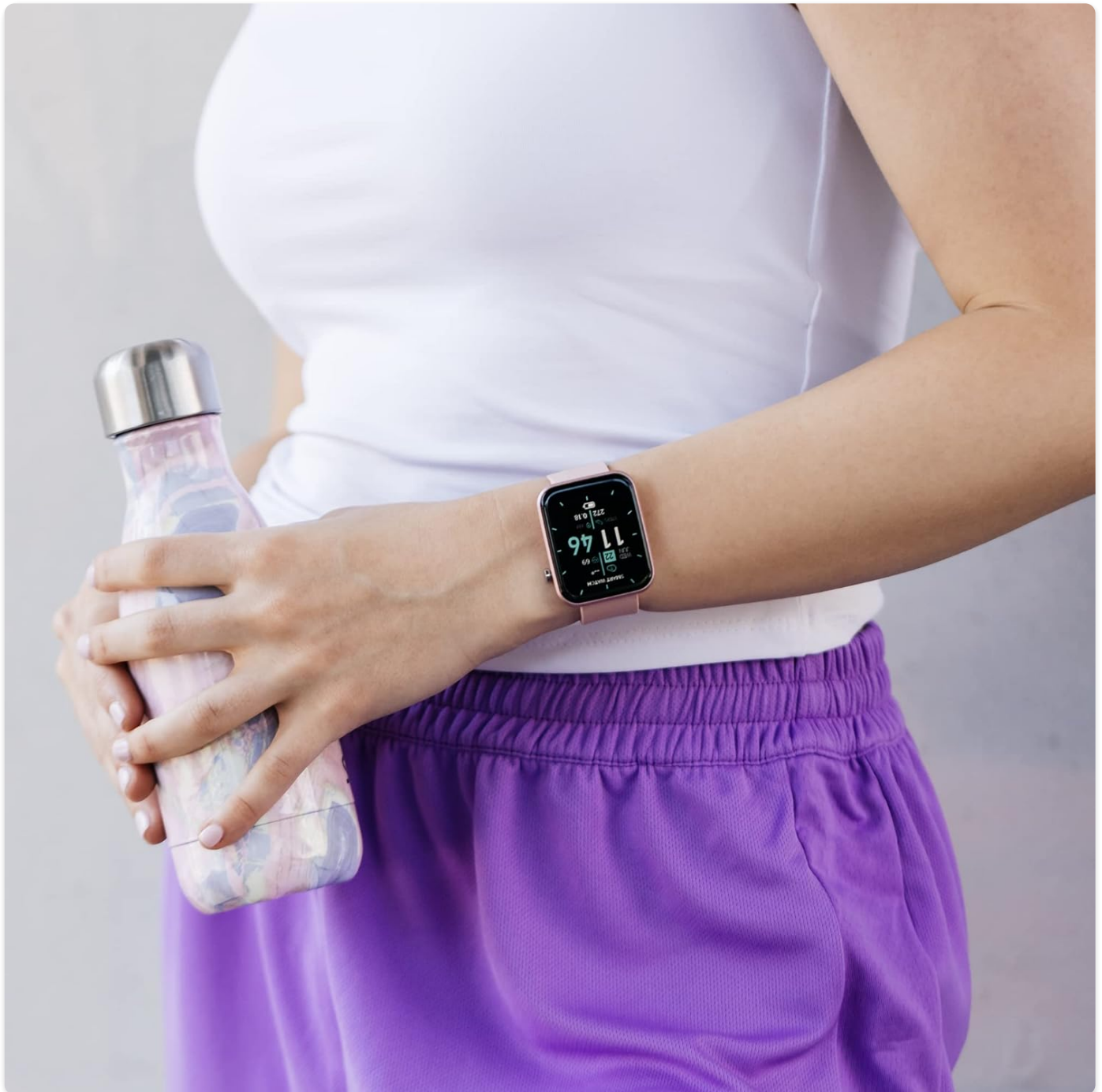
Figure 4: The smartwatch being worn during a light activity, highlighting its use for fitness and health monitoring.