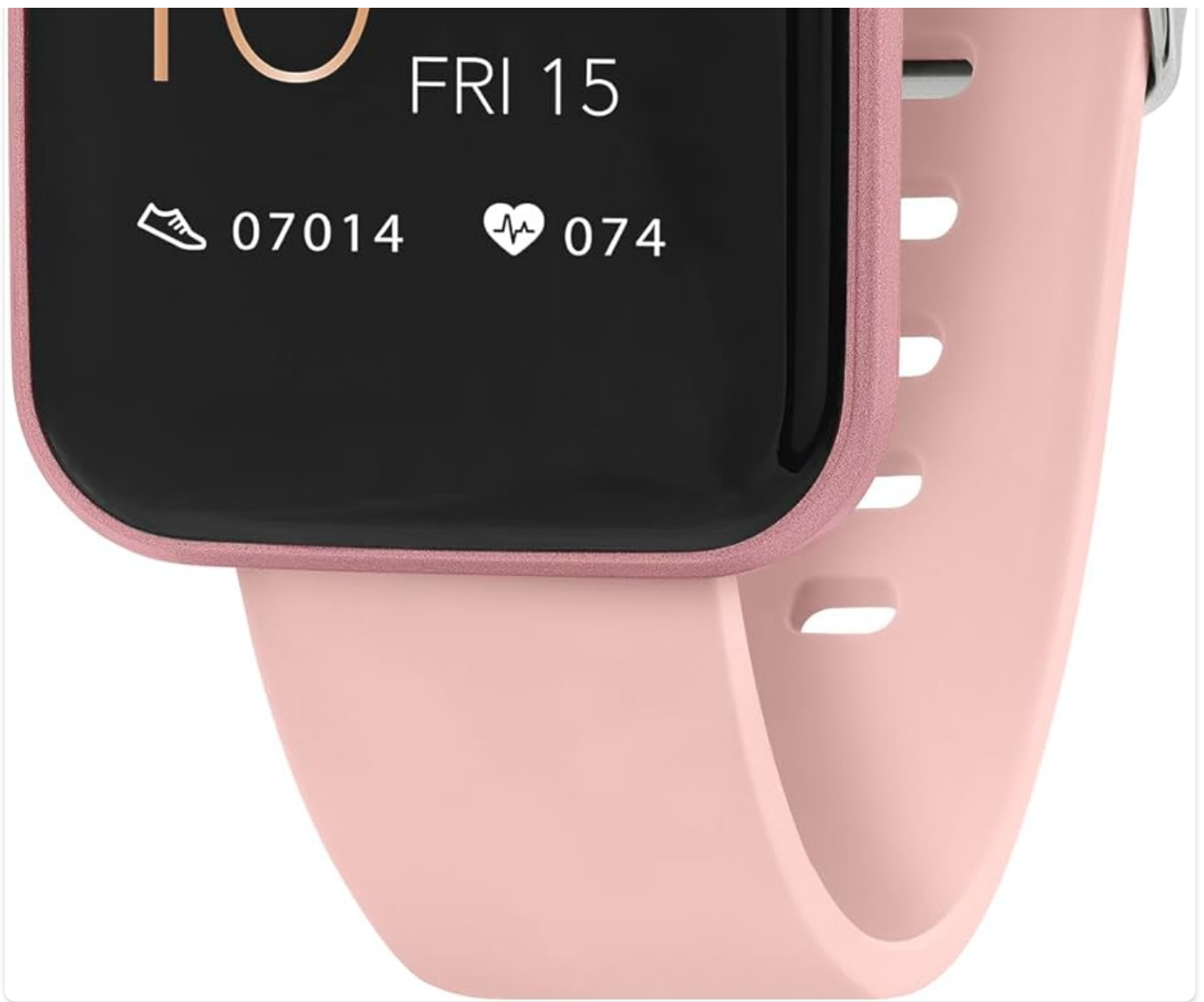
Figure 1: The Reflex Active Series 13 Smartwatch, showcasing its pink rectangular case and silicone strap, with the digital display showing time and activity data.