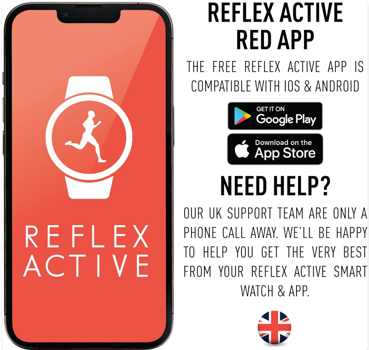
Figure 2: The Reflex Active App download screen, indicating compatibility with iOS and Android devices and providing links to respective app stores.