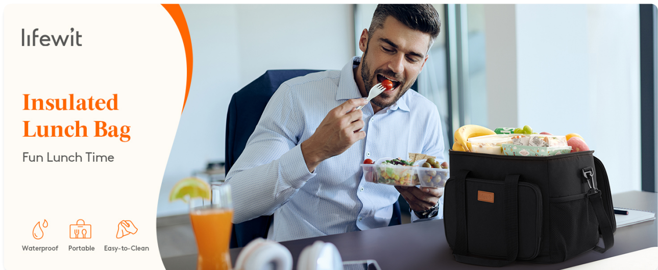
Image 1.1: Lifewit Insulated Lunch Bag banner, highlighting its purpose for enjoyable meal times.

Thank you for choosing the Lifewit Insulated Lunch Bag and Cooler Bag Bundle. This product is designed to keep your food and beverages at desired temperatures for extended periods, making it ideal for office, school, picnics, and travel. This manual provides essential information for the proper use and care of your new bags.