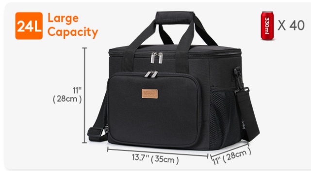
Image 8.2: Visual representation of the 24L capacity, equivalent to 40 x 330ml cans, with dimensions.