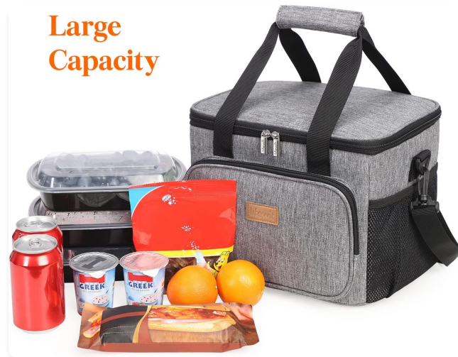
Image 5.4: The grey cooler bag demonstrating its large capacity with multiple food containers and drinks.