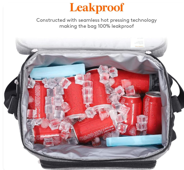
Image 5.1: The cooler bag filled with ice and beverages, illustrating its leakproof construction.