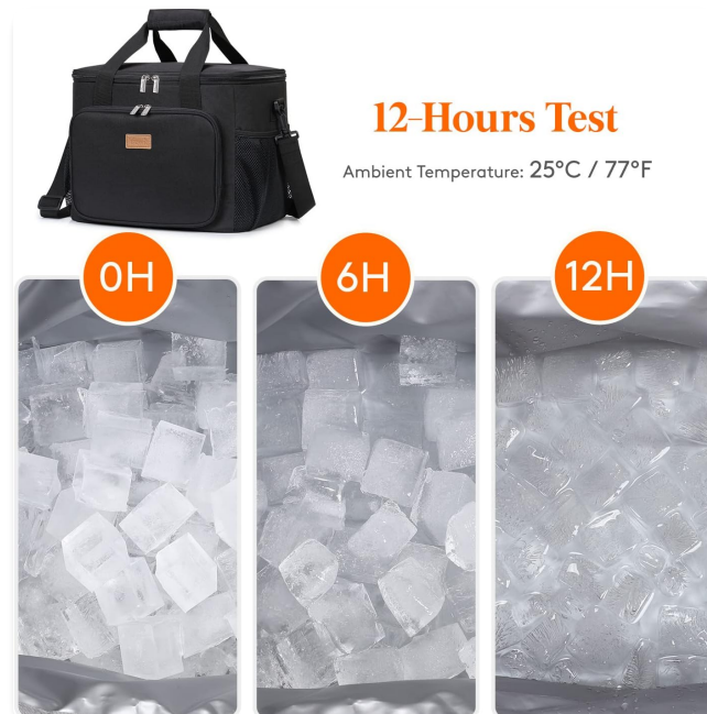
Image 5.2: Visual representation of the bag's insulation performance over 12 hours, showing ice retention.