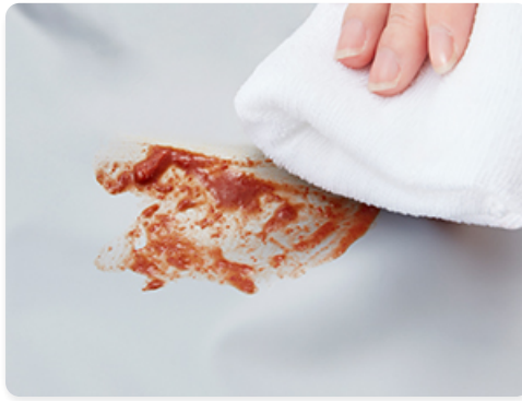
Image 6.2: A hand wiping a spill from the interior lining, showing ease of cleaning.