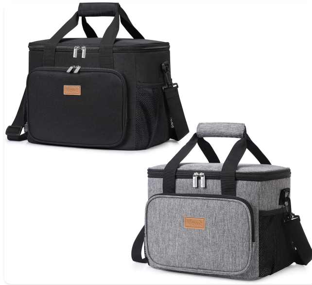
Image 3.1: The Lifewit 24L Black Lunch Bag and 15L Grey Cooler Bag, showcasing both items in the bundle.

The Lifewit bundle includes a 24L black lunch bag and a 15L grey cooler bag, both designed with insulation properties. Each bag features a main compartment, front pocket, and side mesh pockets for additional storage.