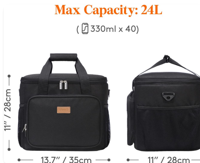
Image 8.1: Dimensions of the 24L black lunch bag (13.7\"L x 11\"W x 11\"H).

Detailed specifications for the Lifewit 24L Black Lunch Bag and 15L Grey Cooler Bag bundle: