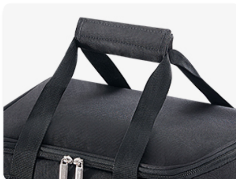
Image 3.3: Detail of the comfortable and sturdy handle of the Lifewit bag.