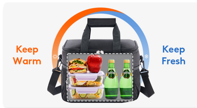
Image 5.3: Diagram illustrating the dual function of the bag to keep contents either warm or fresh.