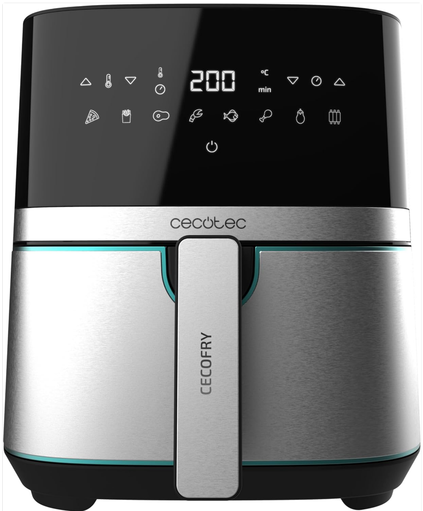
Image: Front view of the Cecotec Cecofry Full Inox 5500 Pro Air Fryer, highlighting the digital touch panel and the handle of the cooking basket.