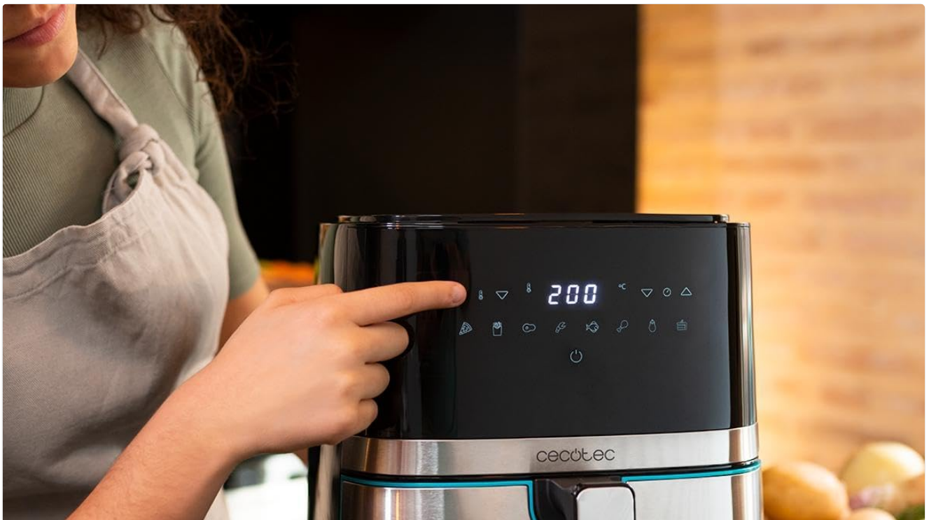
Image: A hand adjusting settings on the digital touch control panel, showing the temperature and time display.