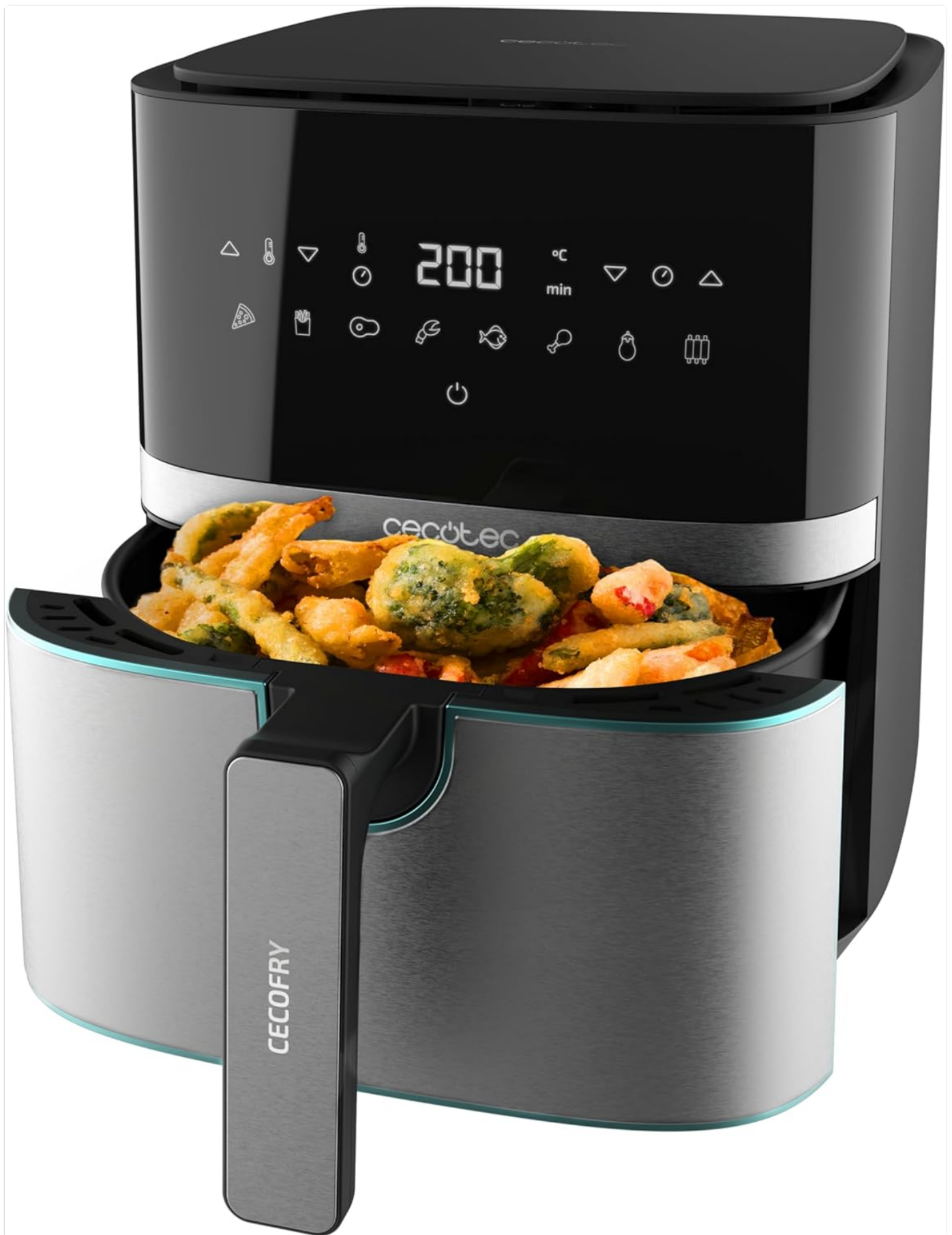
Image: The Cecotec Cecofry Full Inox 5500 Pro Air Fryer, showcasing its sleek design and the pull-out basket filled with cooked vegetables.