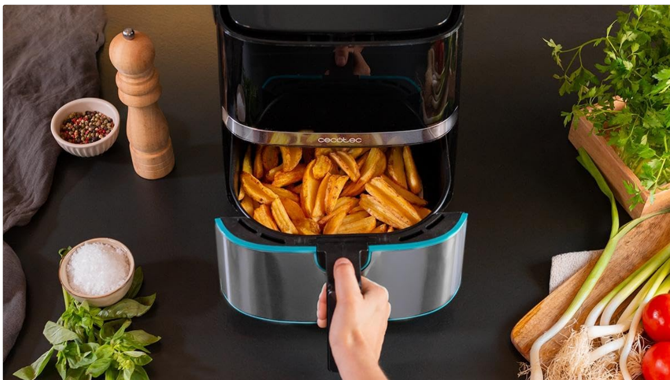
Image: The air fryer basket being pulled out, showing perfectly cooked, crispy fries ready to be served.