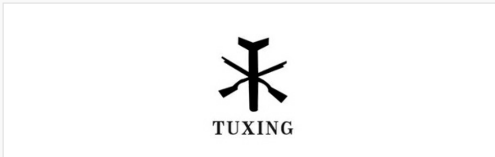
Image: Information regarding TUXING's 24/7 VIP Customer Support, including online service and contact methods for inquiries.

For returns or specific product inquiries, you may also refer to the Amazon return policy or contact the seller, TUXING Official Store (Seller ID: A39CP3T8JONR46).