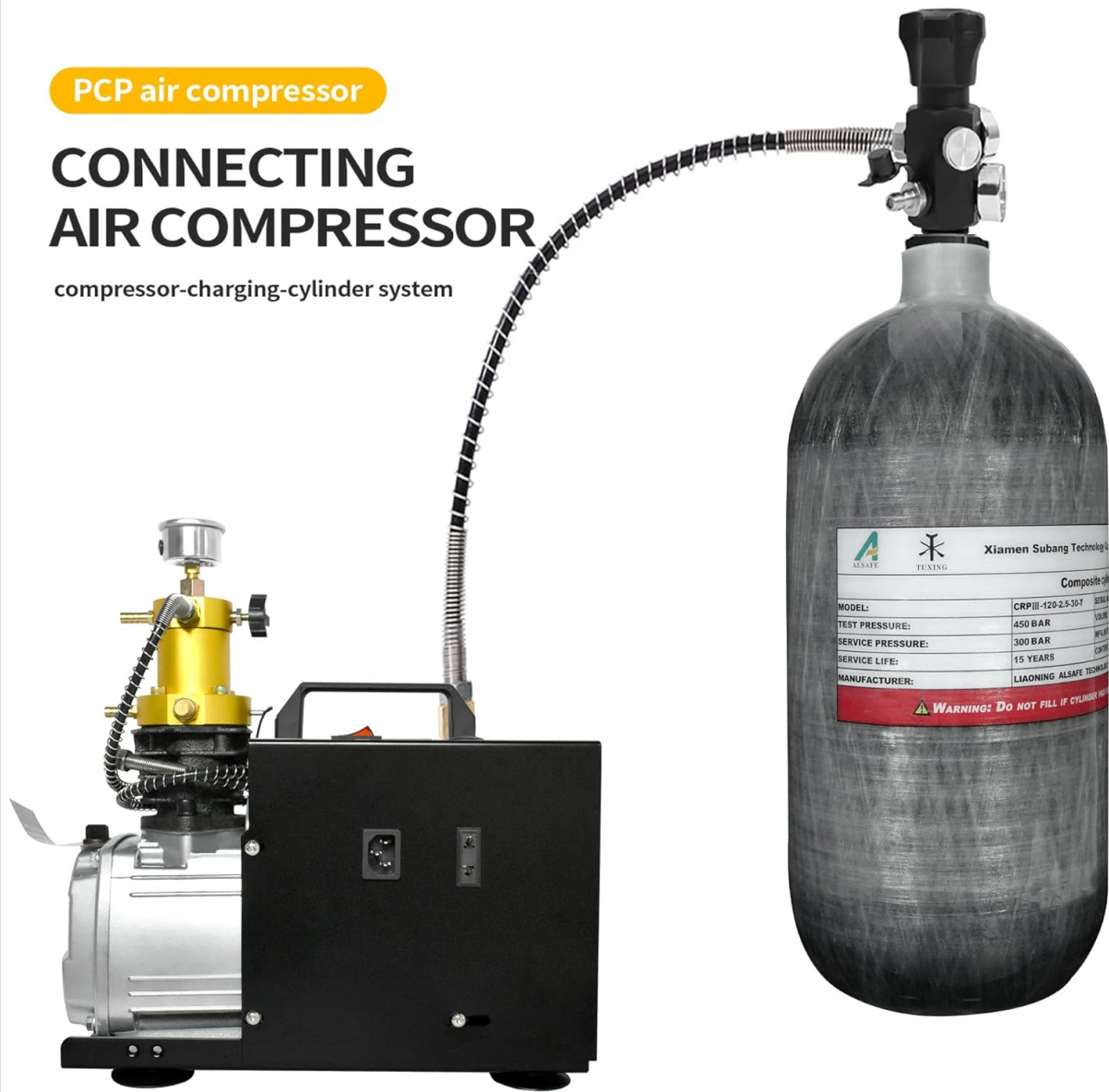
Image: A TUXING 2.5L Carbon Fiber Cylinder connected to a PCP air compressor via a high-pressure hose, illustrating a typical compressor-charging-cylinder system setup.