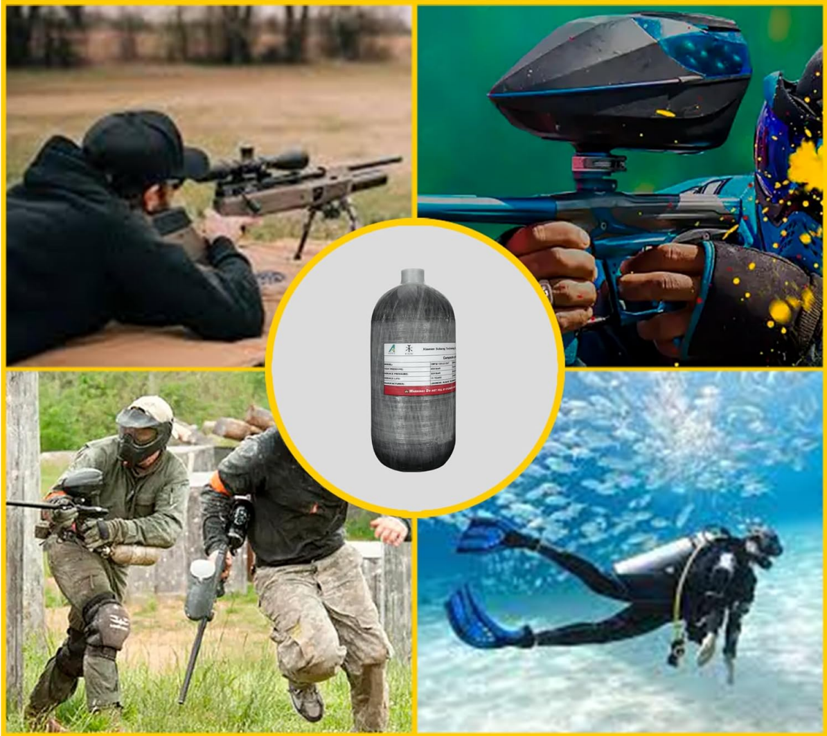
Image: A collage illustrating the wide application of the TUXING carbon fiber tank in various activities such as target shooting, paintball, and scuba diving.