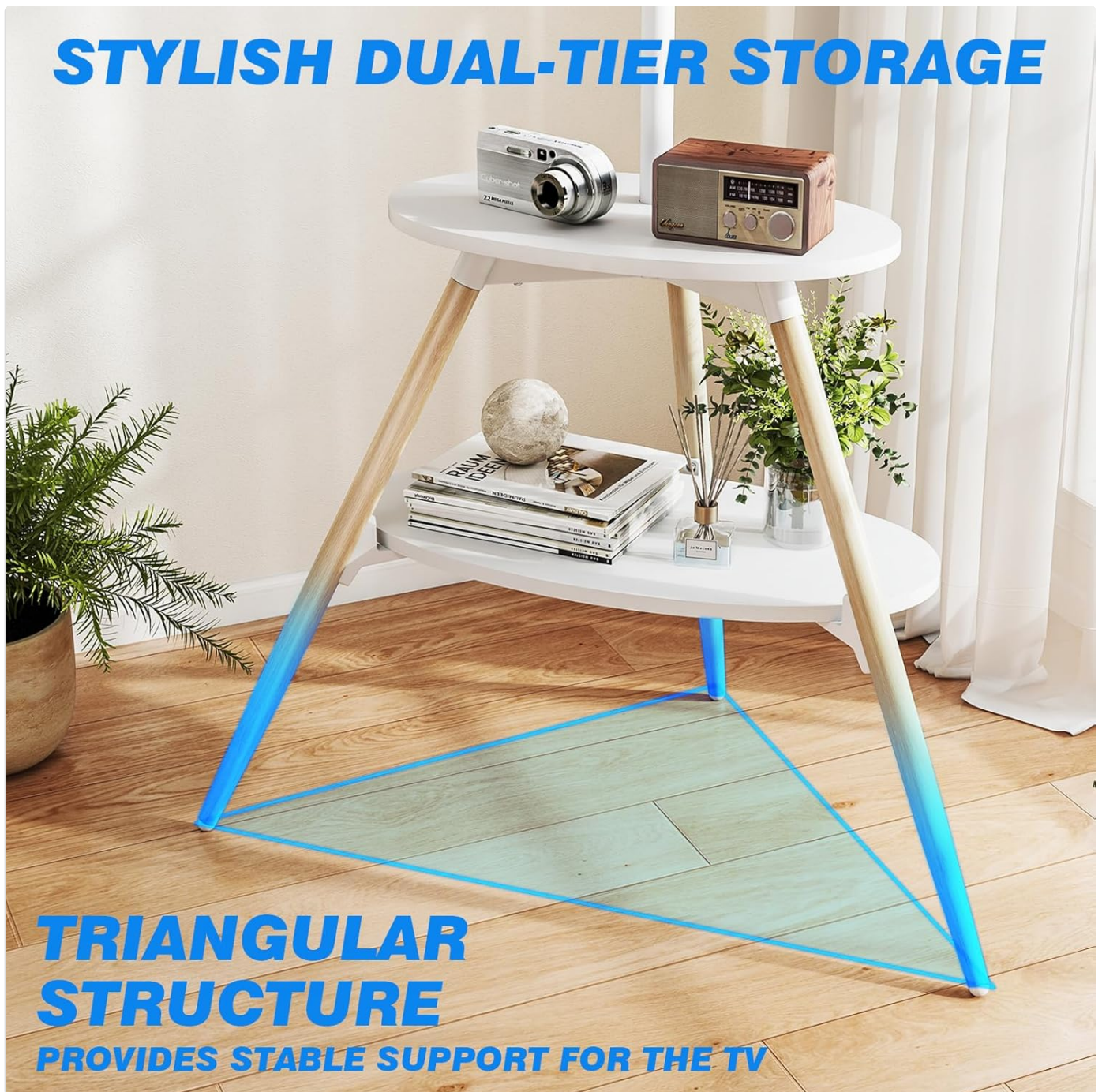
Image: A detailed view of the stand's dual-tier storage and the triangular base structure, emphasizing stability.