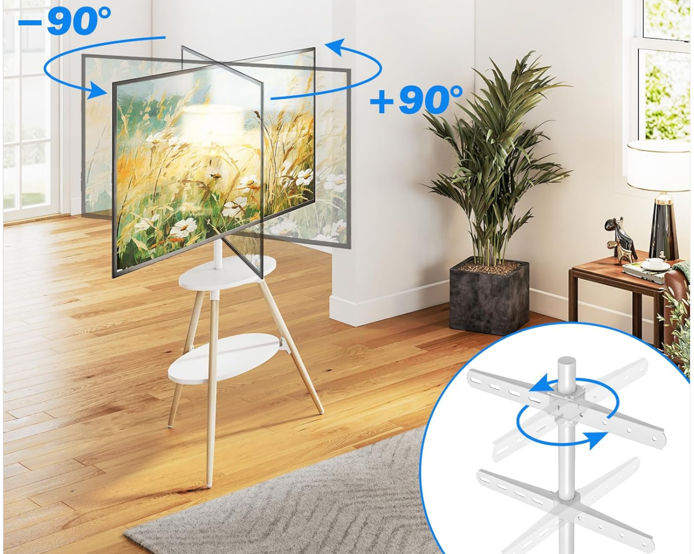
Image: Visual representation of the stand's 180-degree swivel range, showing how the TV can be angled for optimal viewing.