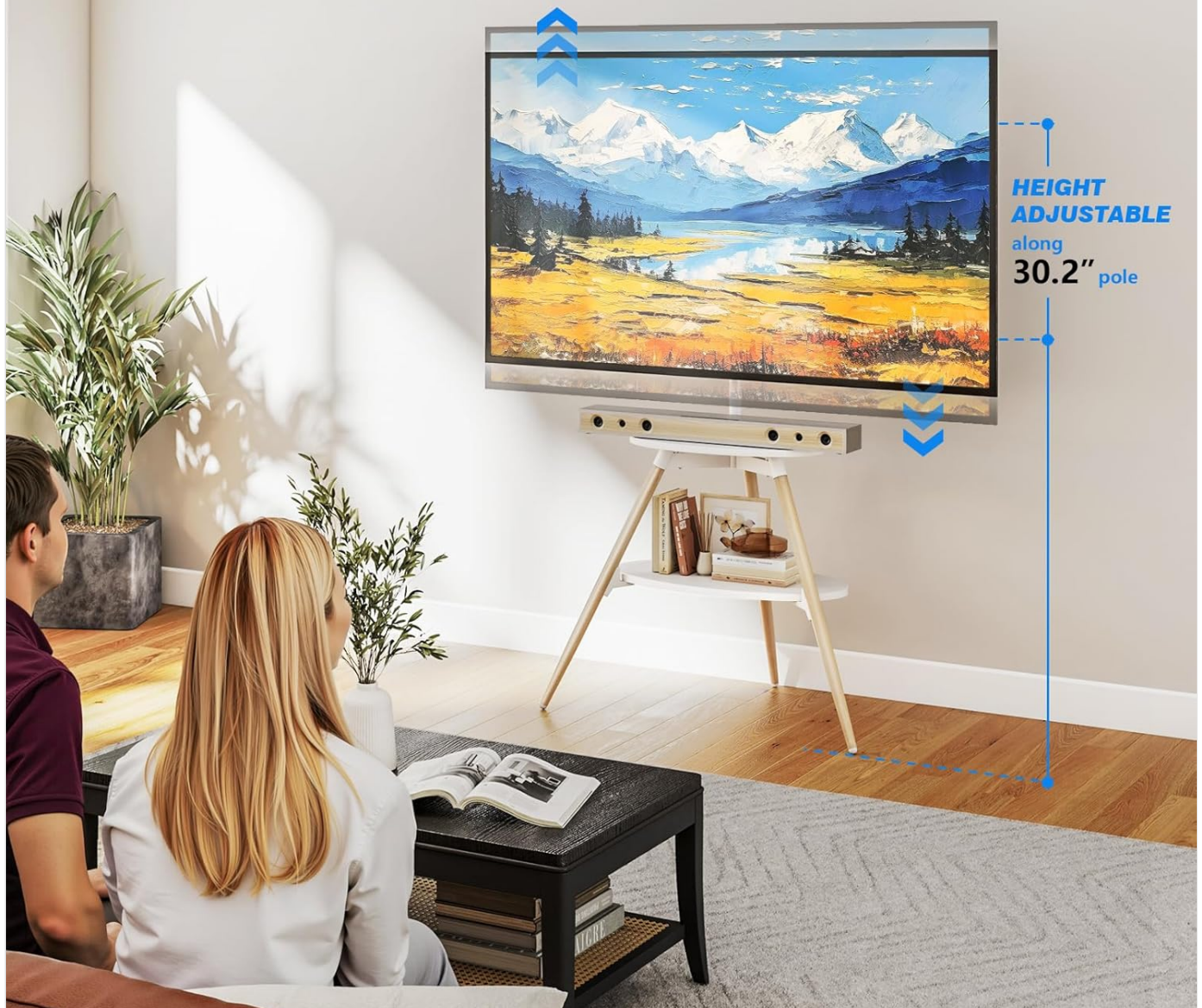
Image: An illustration showing the adjustable height range of the TV on the stand, emphasizing comfort and flexibility.