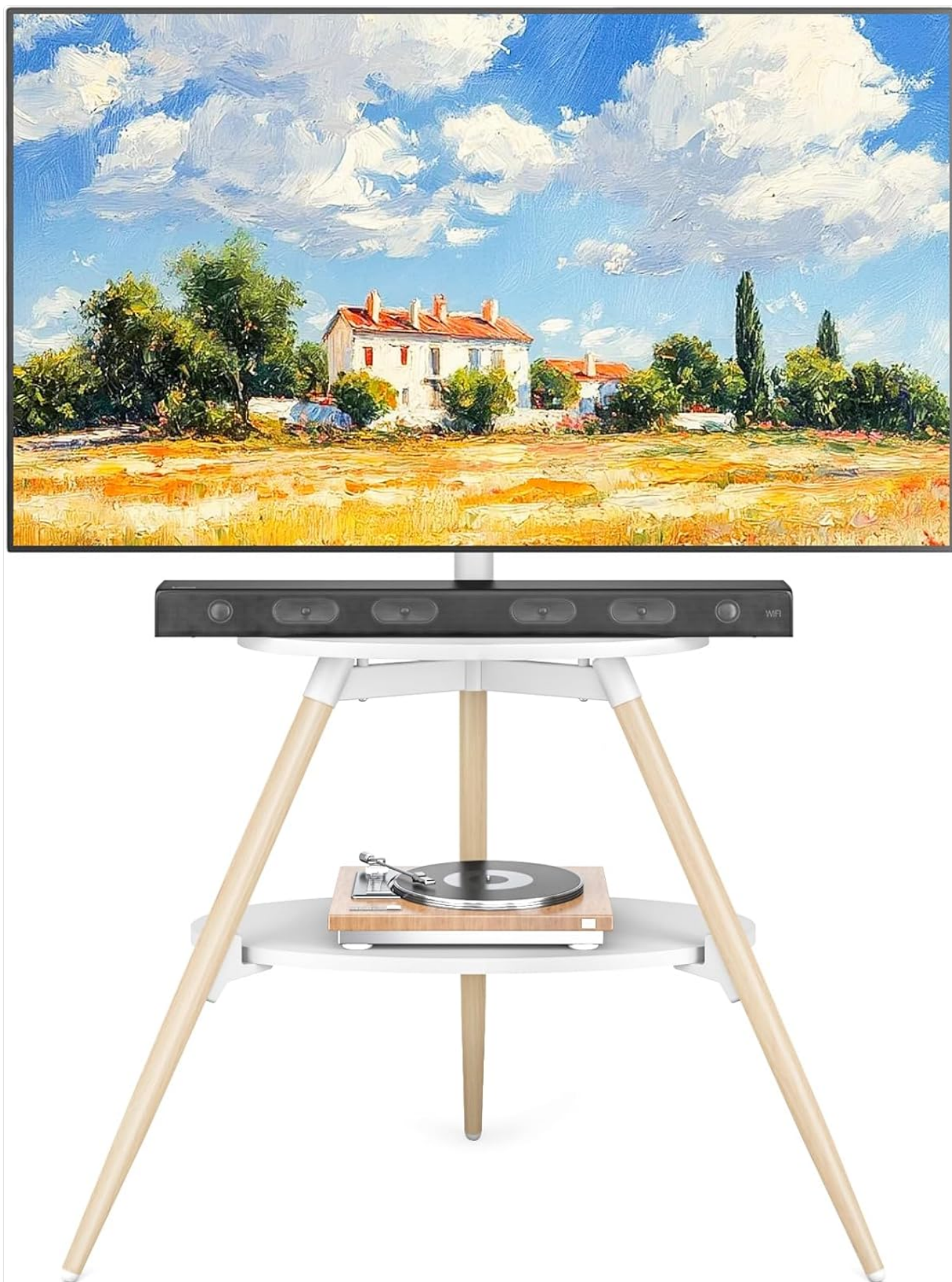
Image: The Rfiver Easel TV Stand, showcasing its design with a television, soundbar, and record player on its integrated shelves.