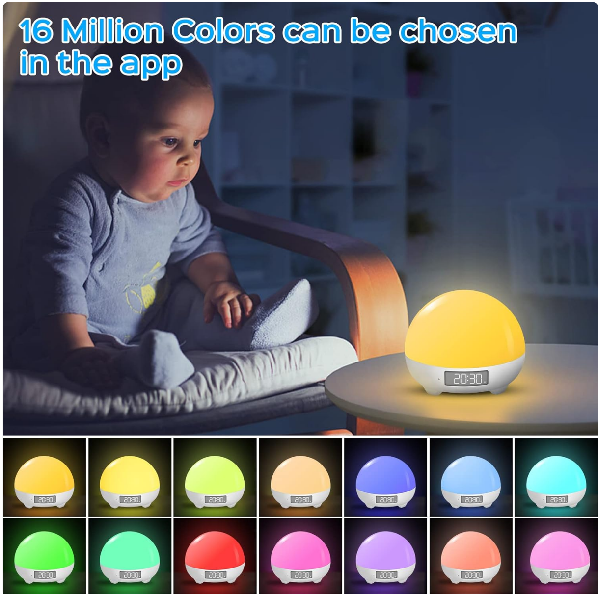
The Panacare Smart Night Light offers 16 million color options, controllable via the dedicated app. This image shows the night light in different hues, demonstrating its color-changing capabilities.