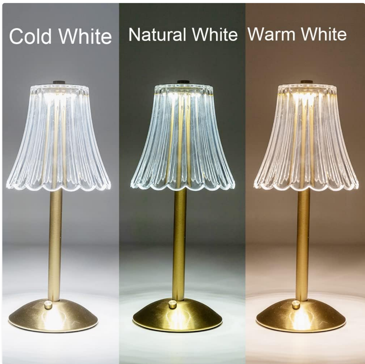
Image: The lamp demonstrating its three distinct light color temperatures: Cold White, Natural White, and Warm White.