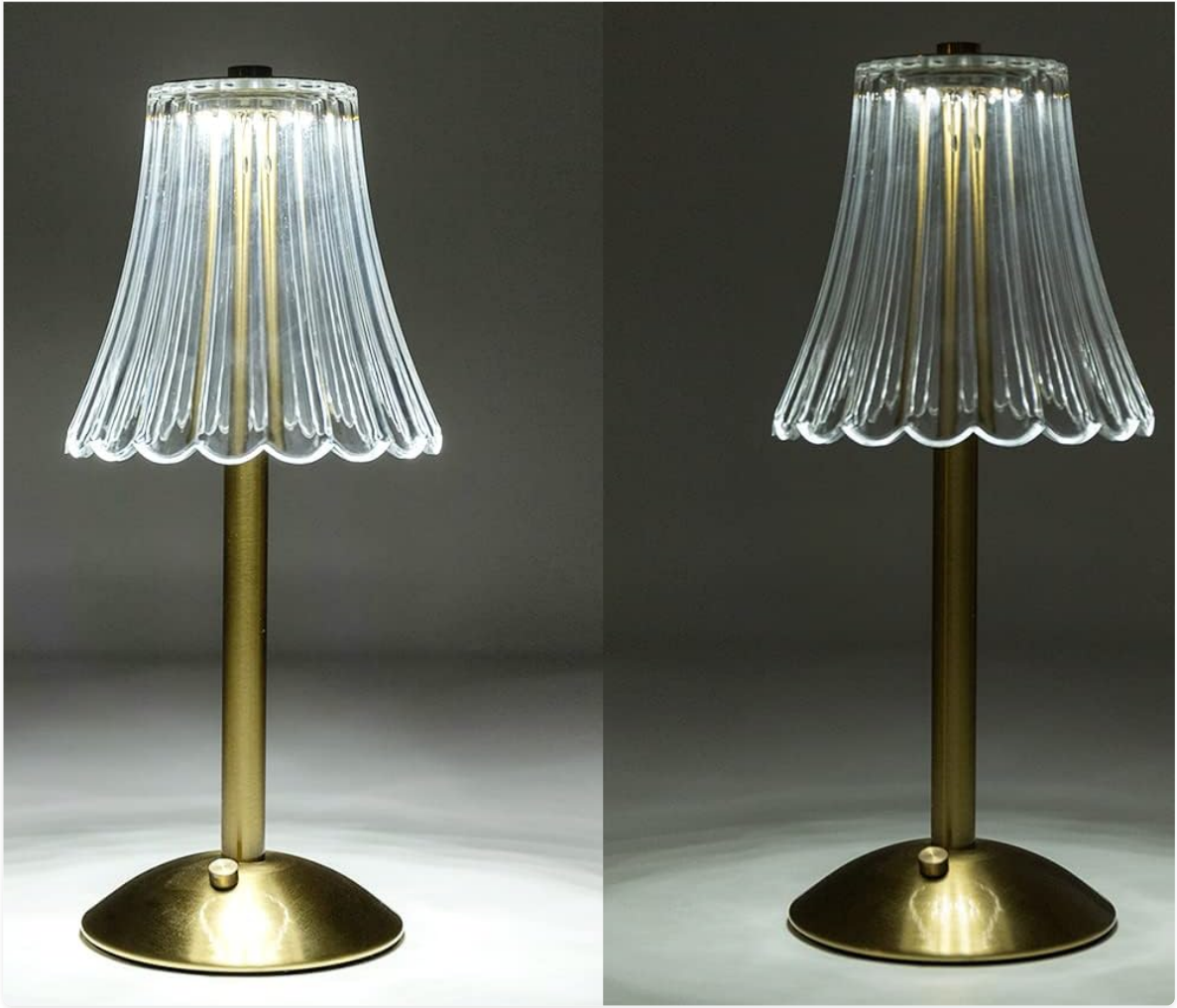
Image: Two lamps side-by-side, illustrating the dimmable function from bright to dim.