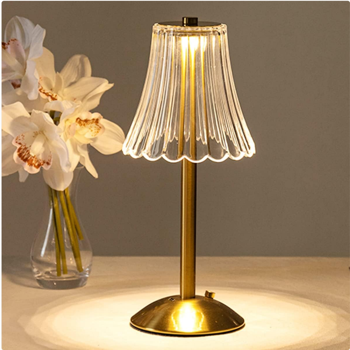
Image: The HEQET Cordless LED Table Lamp, featuring a gold base and a clear, fluted acrylic shade, emitting a warm light.