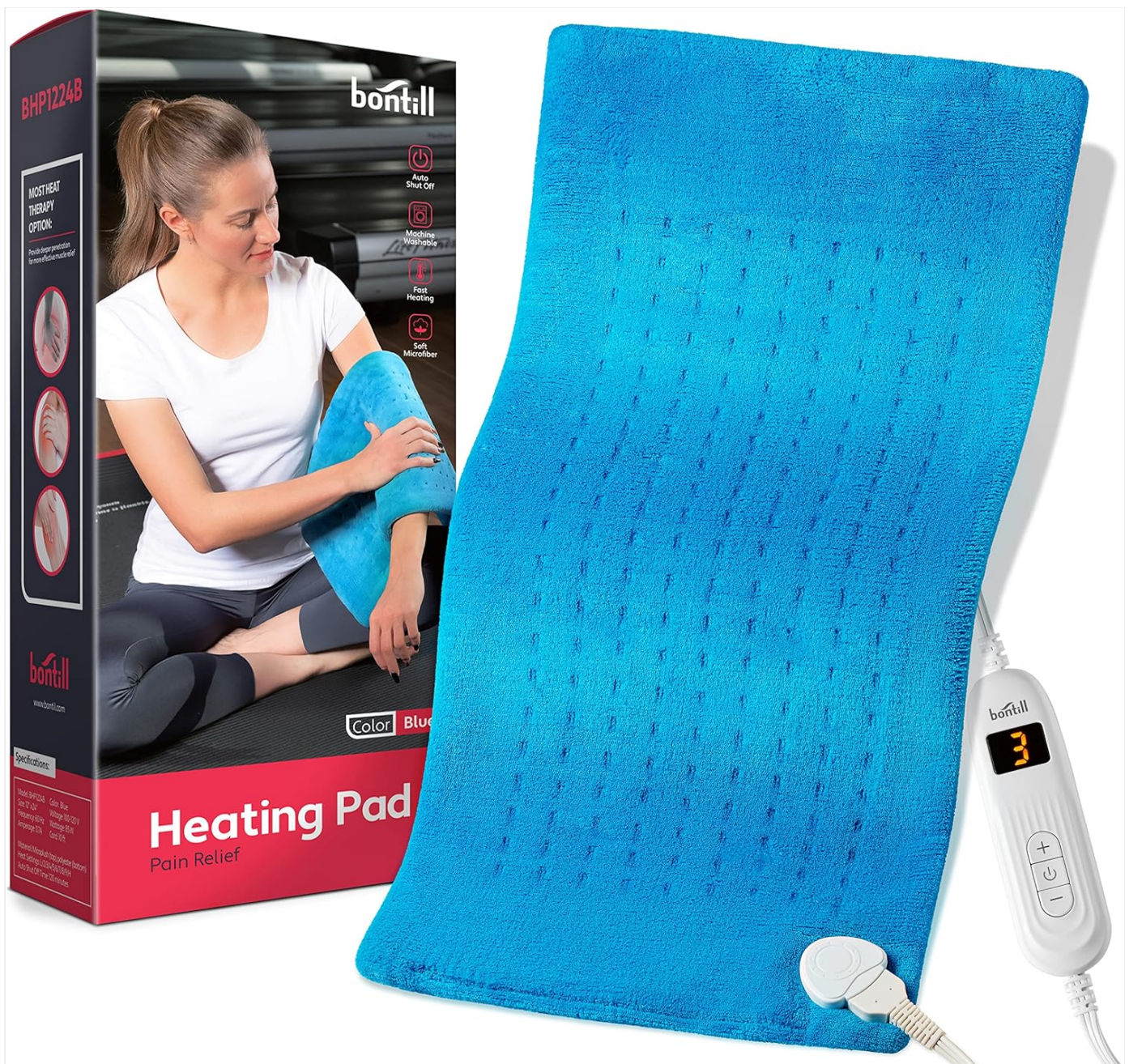
Image: The bontill Electric Heating Pad, its controller, and product packaging. The pad is blue and measures 12x24 inches.