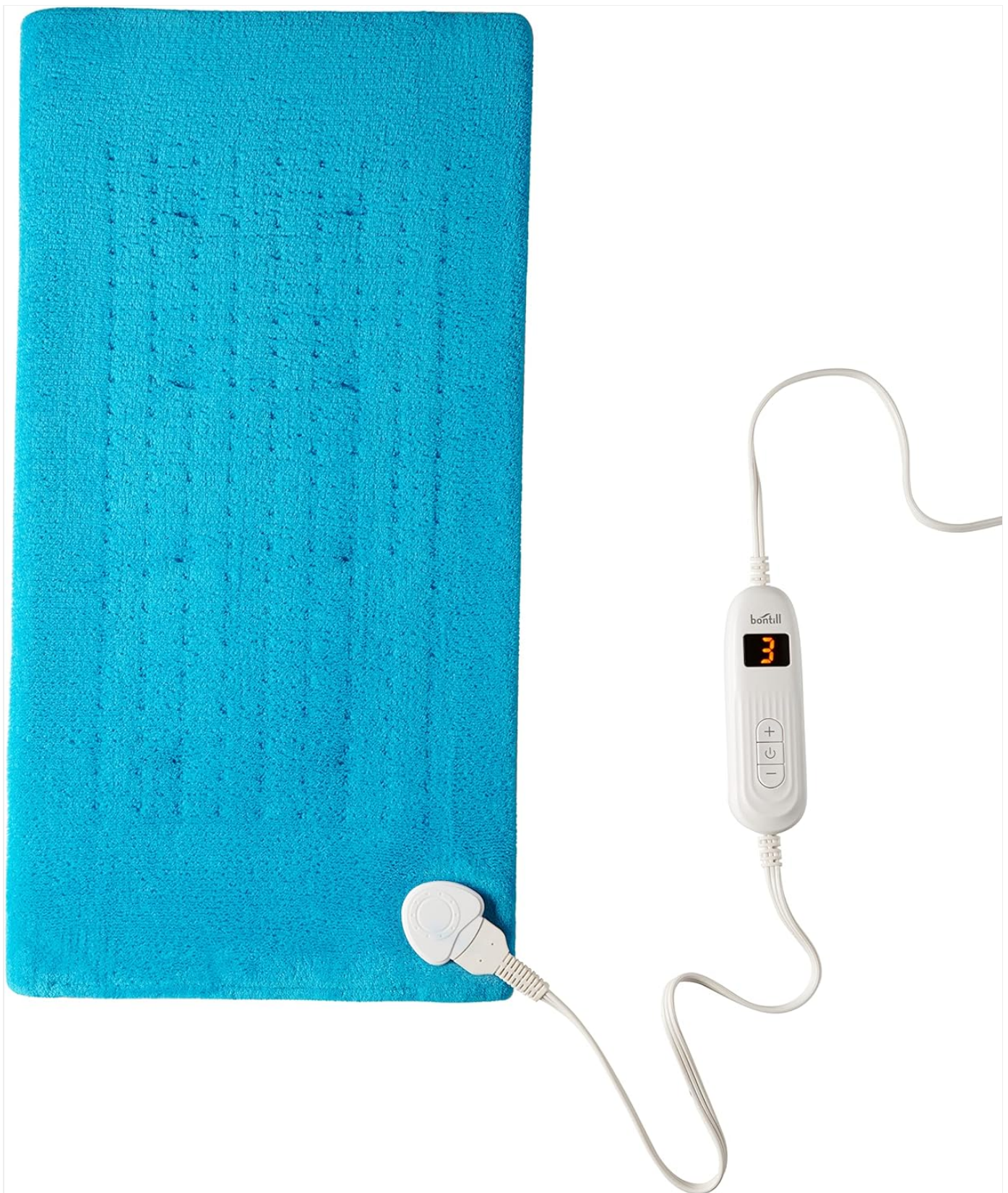
Image: A detailed view of the white LCD controller for the bontill heating pad, displaying a heat setting of '3' and indicating 10 heating levels, a temperature range of 104°F-140°F, and a 2-hour auto shut-off feature.