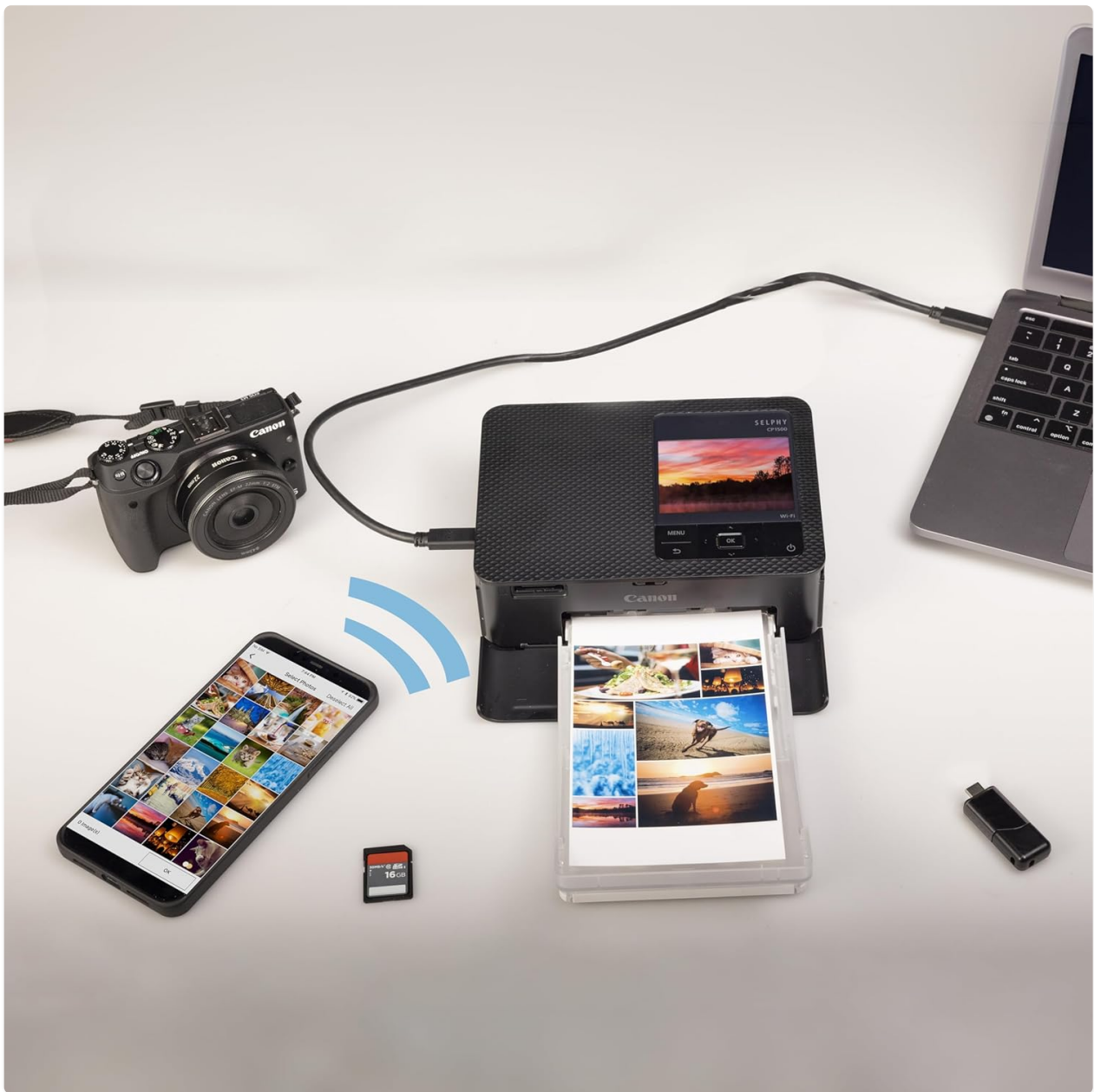
Image: The Canon Selphy CP1500 printer is shown with multiple devices, including a smartphone, a digital camera, and a laptop, highlighting its versatile connectivity options via Wi-Fi, memory card, and USB.