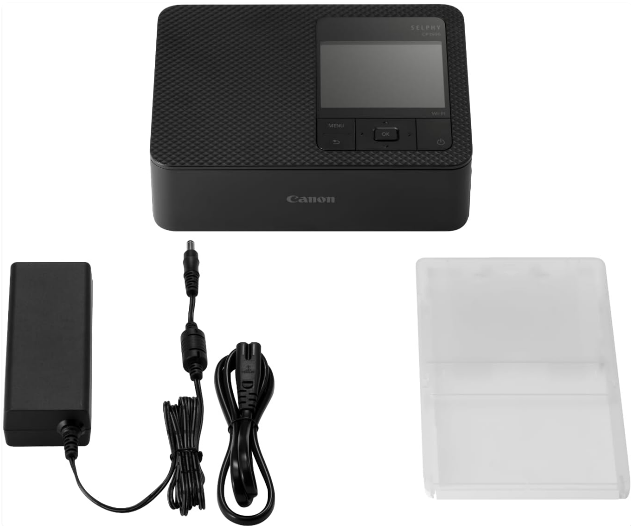
Image: The Canon Selphy CP1500 printer shown with its essential accessories, including the power adapter, paper cassette, and initial paper and ink supplies.