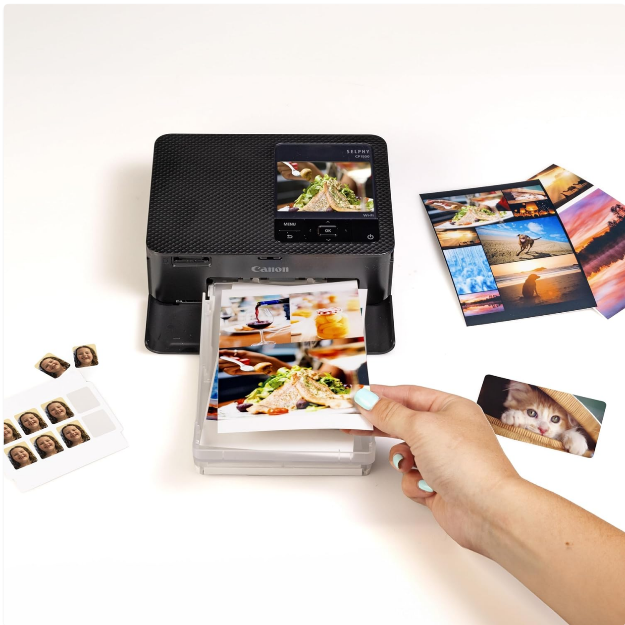
Image: A hand is shown retrieving a freshly printed photo from the Canon Selphy CP1500 printer, with several other printed photos scattered nearby, demonstrating the ease of photo output.