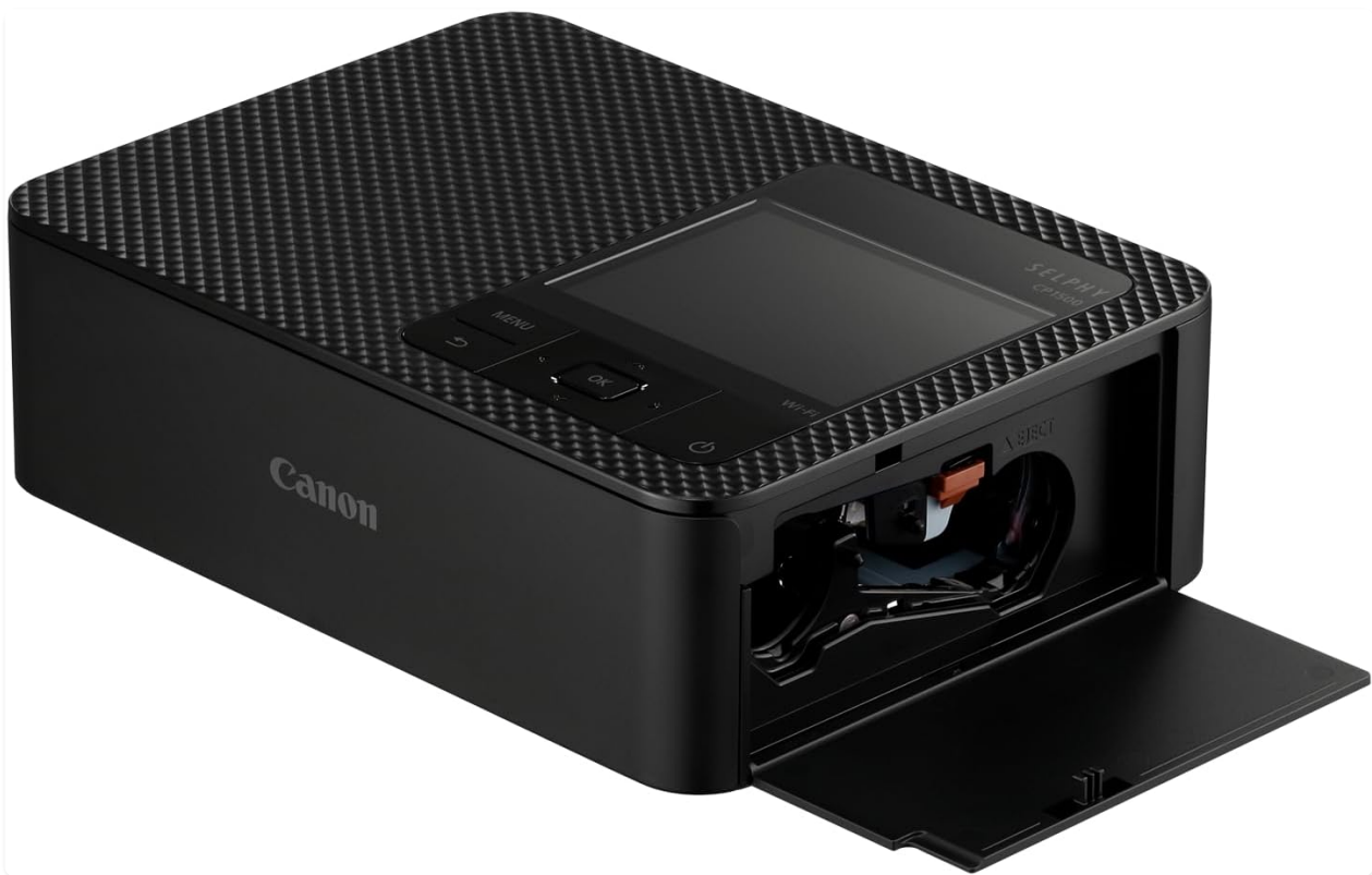
Image: The side of the Canon Selphy CP1500 printer showing the open compartment for inserting the ink cassette.