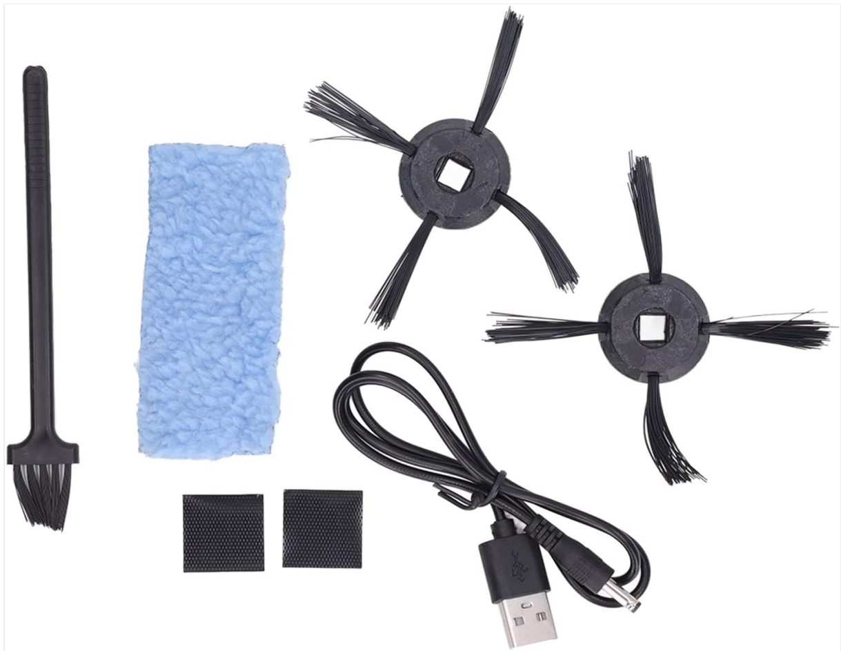
Image: A detailed view of the individual accessories provided with the robot vacuum cleaner.