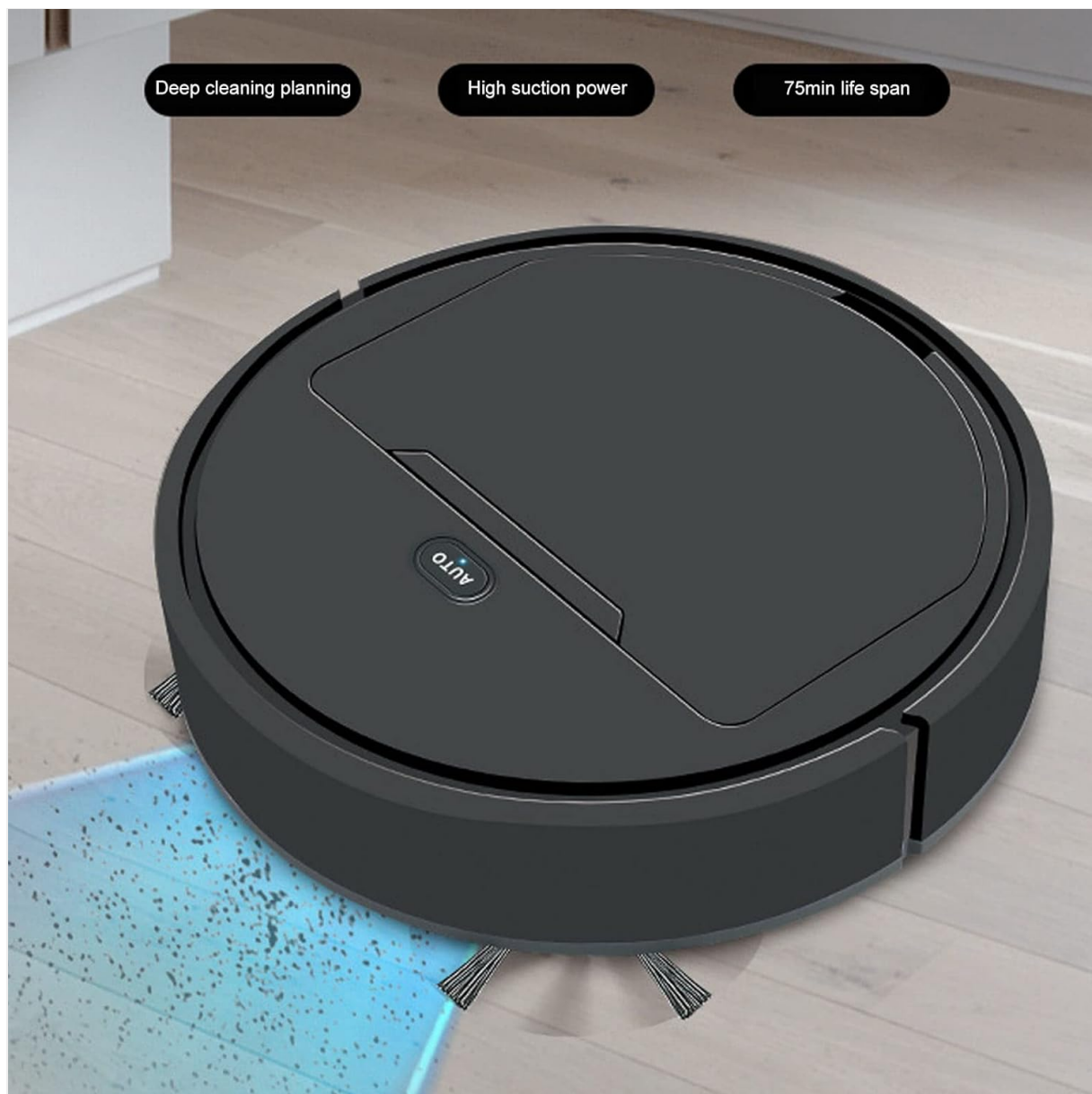
Image: The robot vacuum cleaner actively cleaning a hard floor, demonstrating its compact form factor and the action of its side brushes.