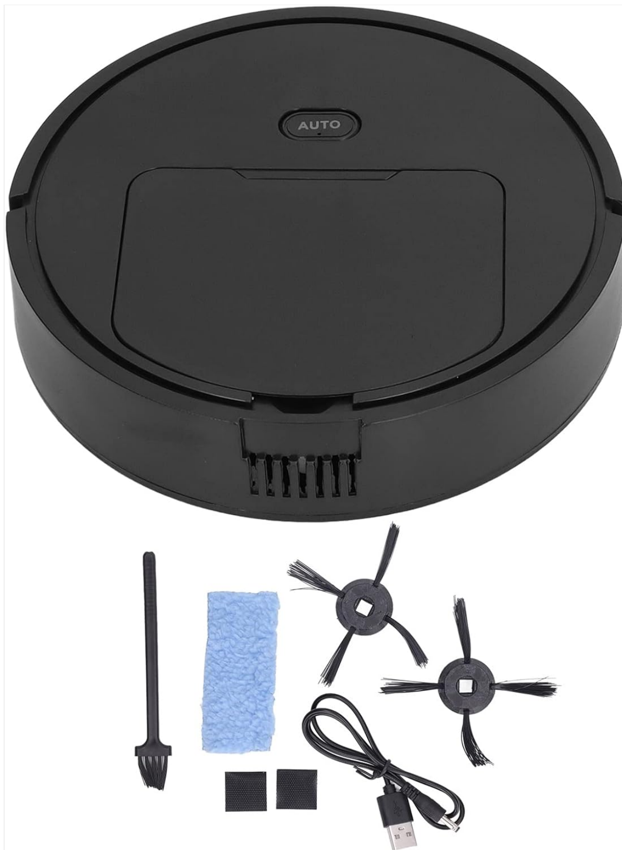
Image: A complete view of the product package contents, showing the main robot unit and all included accessories.