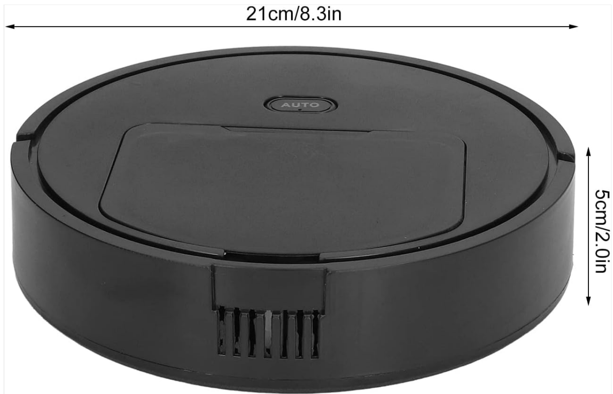
Image: Dimensions of the robot vacuum cleaner, showing its diameter and height.