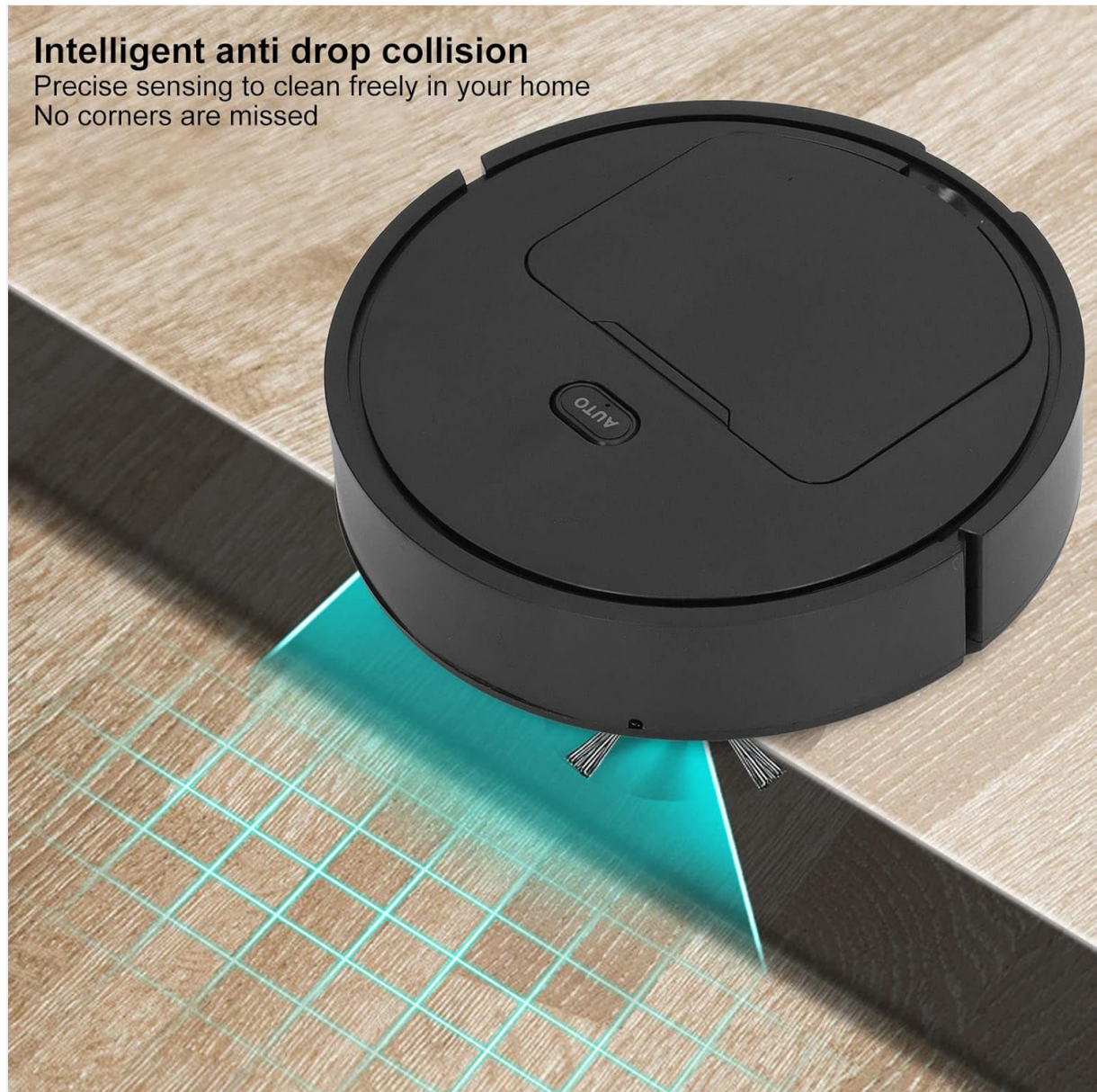
Image: The robot vacuum cleaner illustrating its intelligent anti-drop and anti-collision capabilities, showing how it senses edges and obstacles.

The robot is equipped with intelligent sensors to detect obstacles and prevent falls. It will navigate around furniture and avoid dropping down stairs.