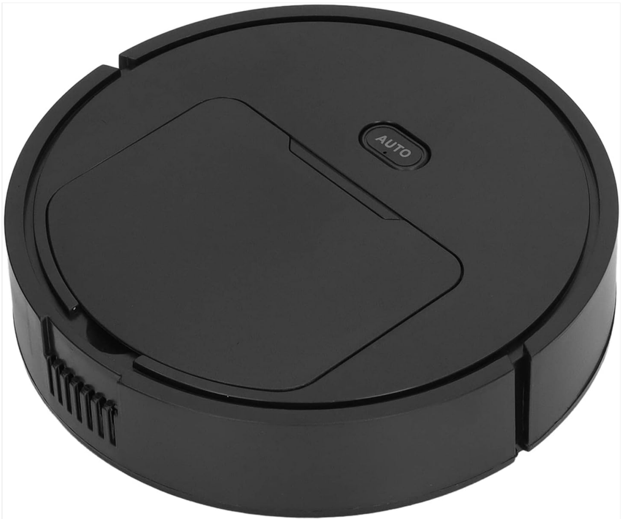
Image: Top view of the robot vacuum cleaner, highlighting the main power/auto button and the dustbin access panel.