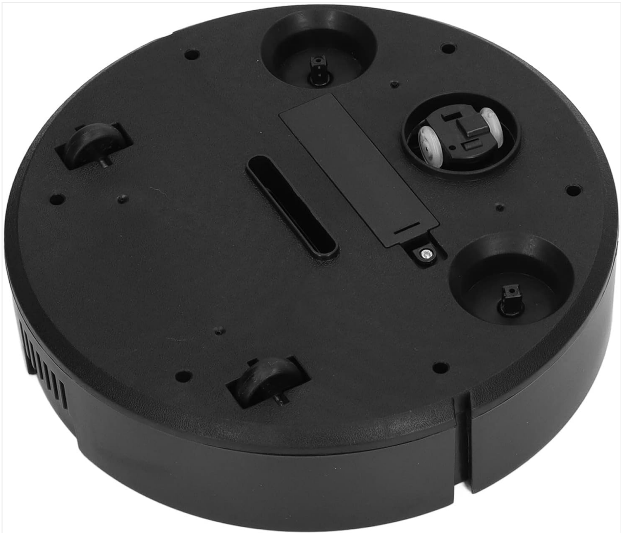
Image: The underside of the robot, detailing the wheels, side brush attachment points, and the main suction area, which should be kept clean for optimal performance.

Wipe the sensors and wheels on the underside of the robot with a dry cloth to remove any dust or debris that might affect navigation or movement.