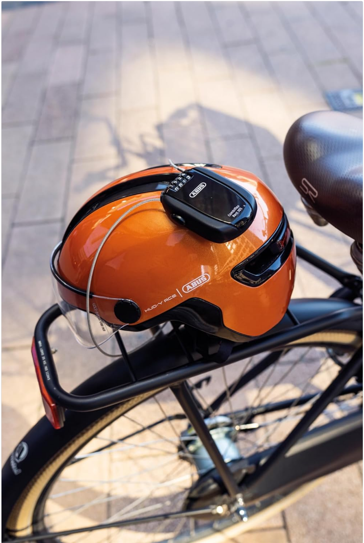
Figure 2: Securing a helmet with the Combiflex lock.