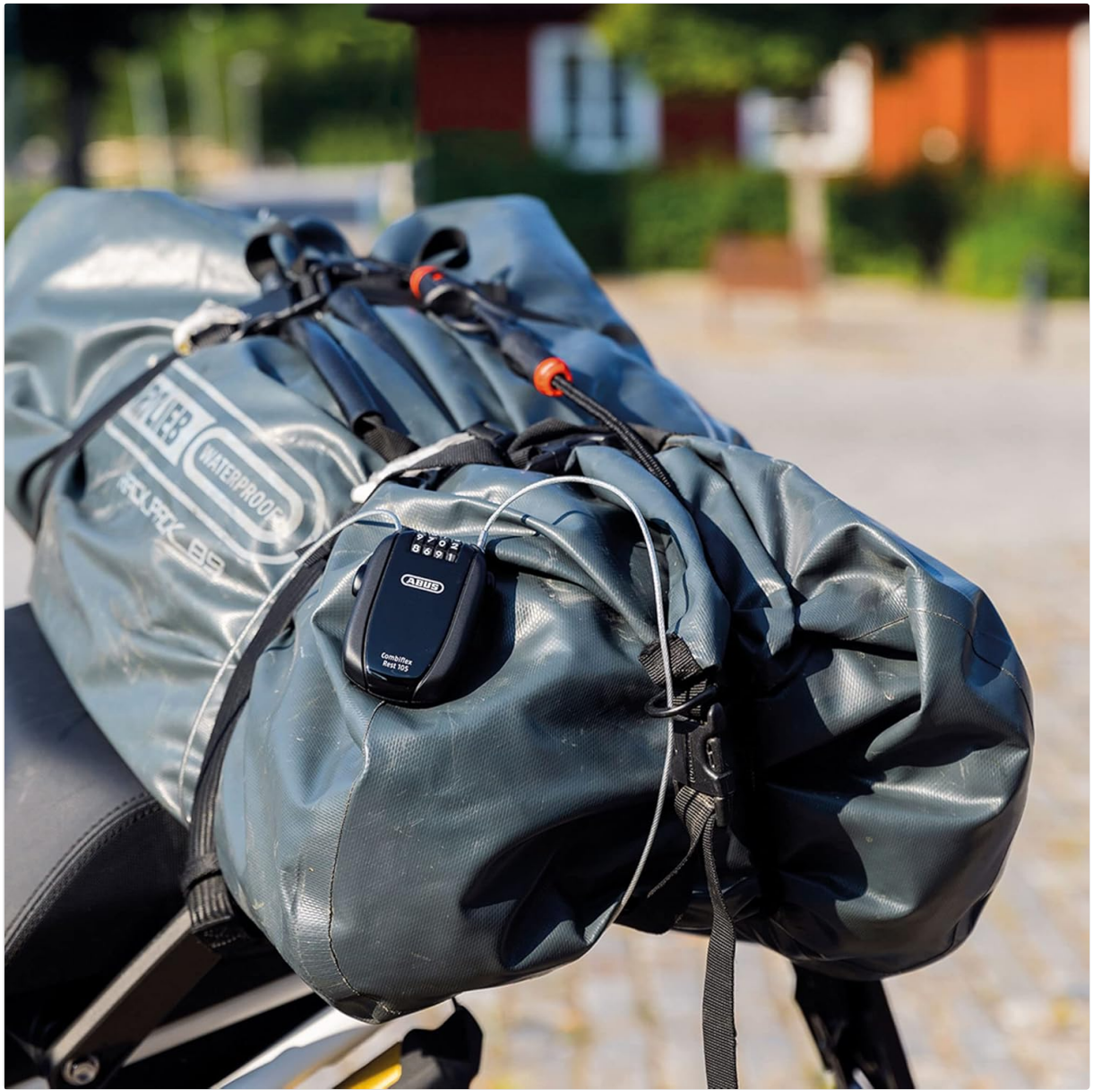
Figure 4: Securing luggage with the Combiflex lock.