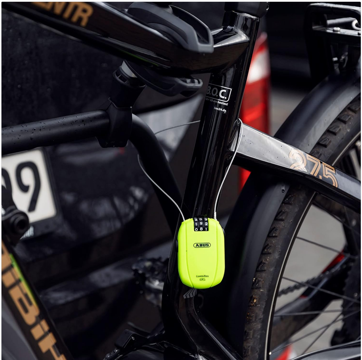
Figure 3: Using the Combiflex lock to secure a bicycle.