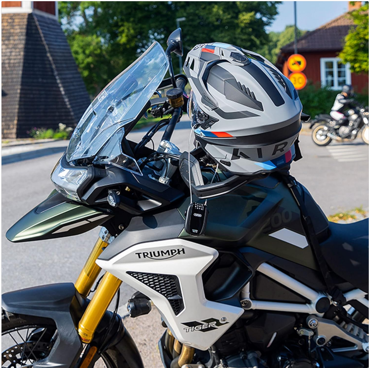
Figure 5: Securing a motorcycle helmet with the Combiflex lock.

Your browser does not support the video tag.