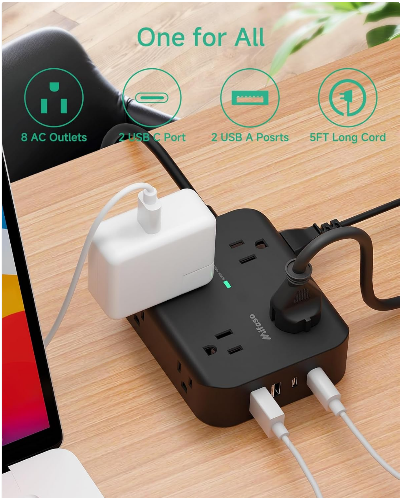
Image: A top-down view of the power strip with various devices plugged into its AC and USB ports, illustrating its "One for All" capability.