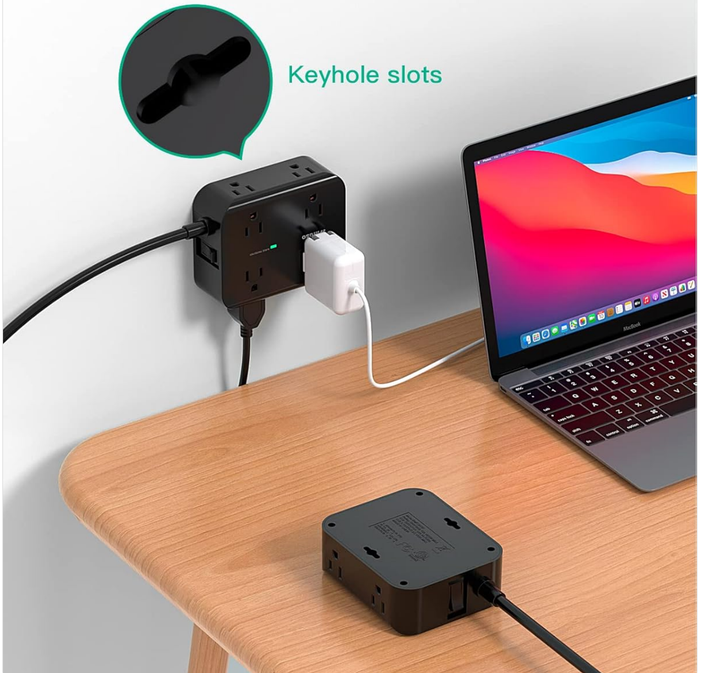
Image: The power strip showing the illuminated green "SURGE PROTECTED" indicator light.