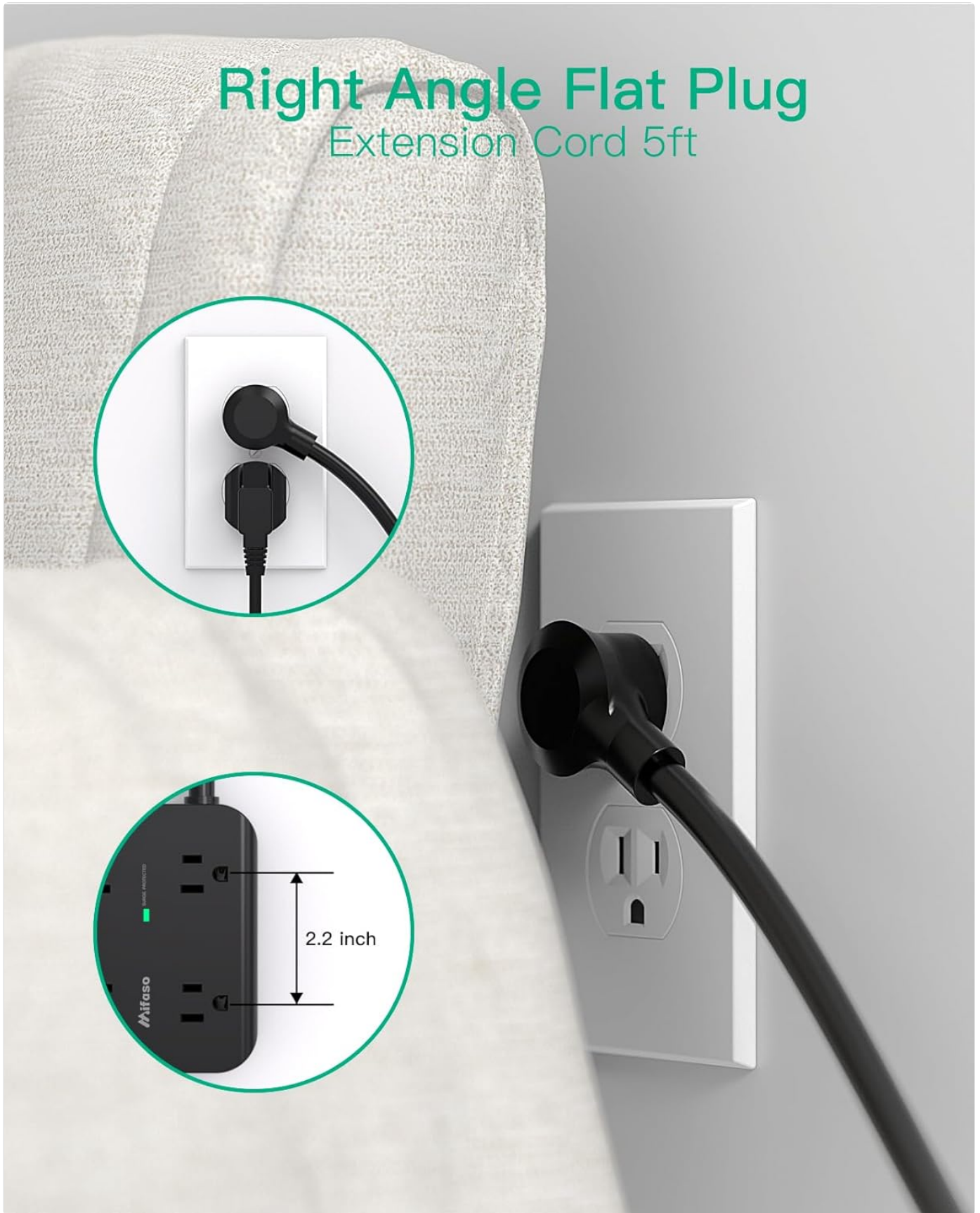
Image: The flat plug design of the power strip, demonstrating how it fits flush against a wall behind furniture.