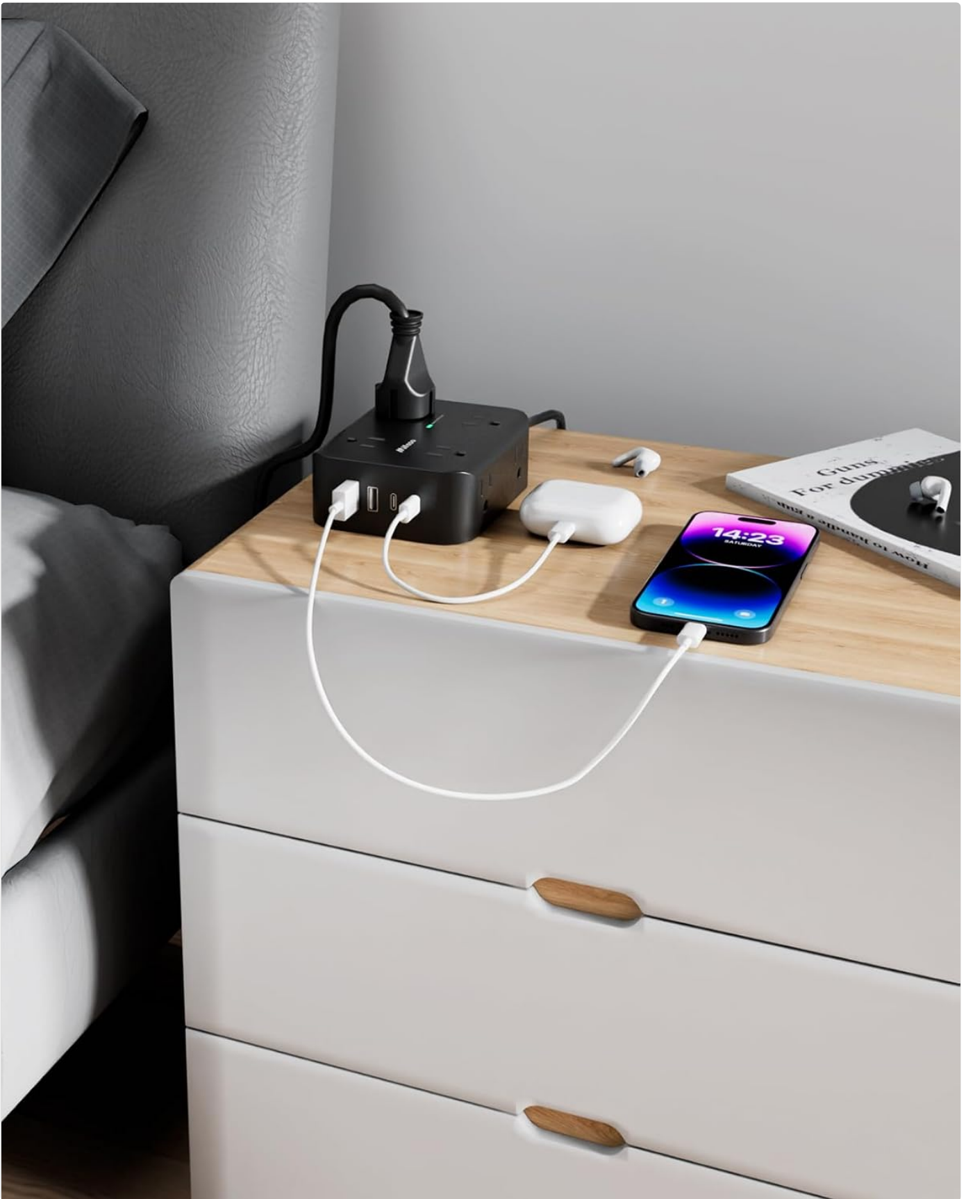
Image: The 5FT extension cord of the power strip, illustrating its length for flexible placement.