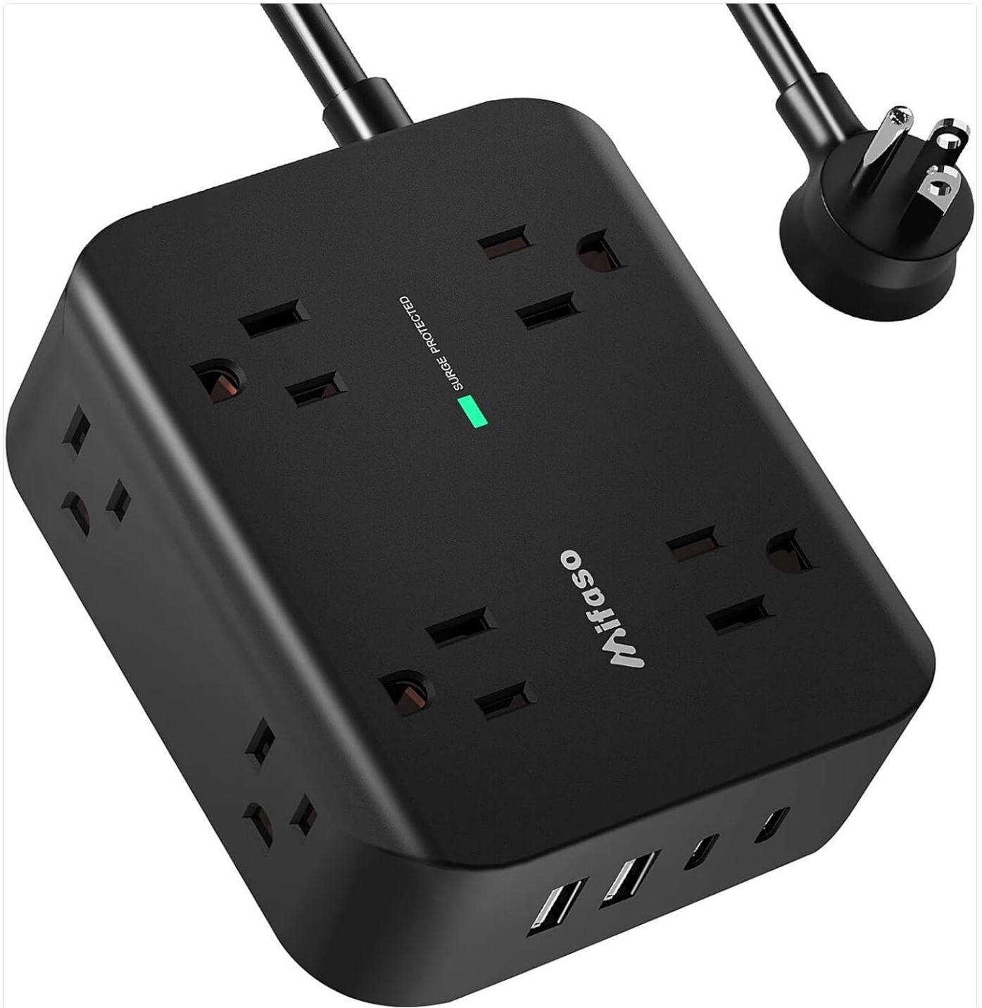
Image: The Mifaso Power Strip Surge Protector, showing its compact design and multiple outlets.