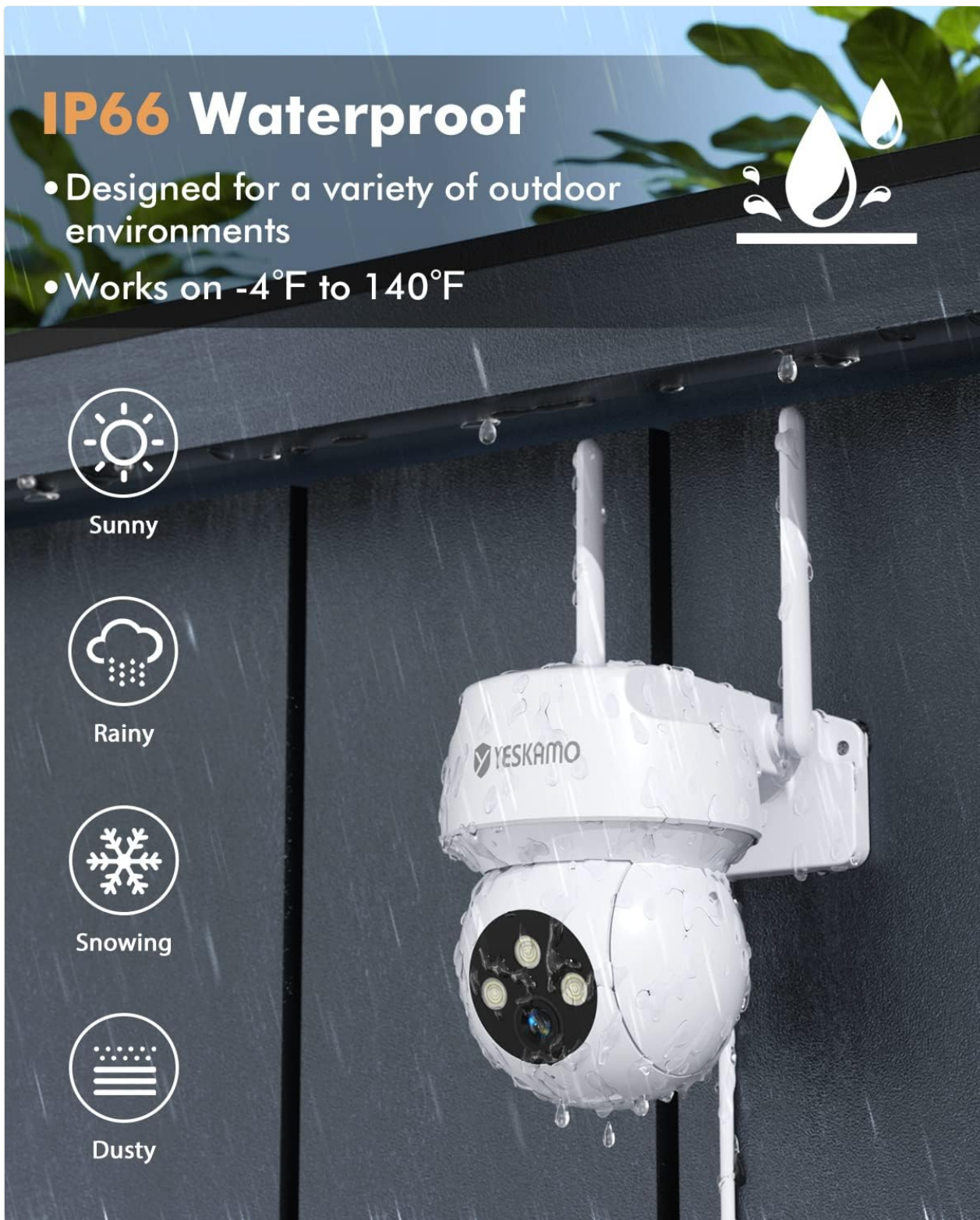
Image: The YESKAMO camera demonstrating its IP66 waterproof and weather-resistant design, suitable for sunny, rainy, snowy, and dusty outdoor environments.