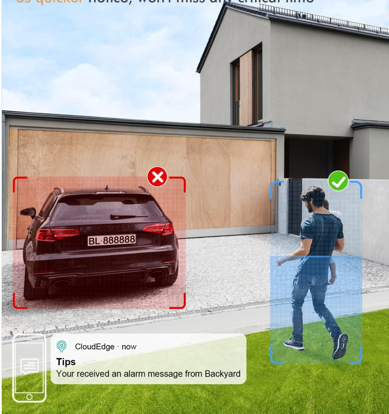
Image: The smart PIR sensor in action, accurately detecting a person entering a monitored zone while disregarding a parked car, accompanied by a smartphone notification.

3s quicker notice, won't miss any critical time