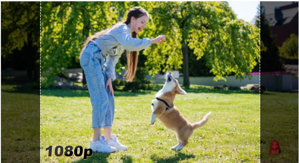
Image: A visual comparison demonstrating the enhanced clarity of 2K resolution compared to 1080p, captured by the YESKAMO camera.