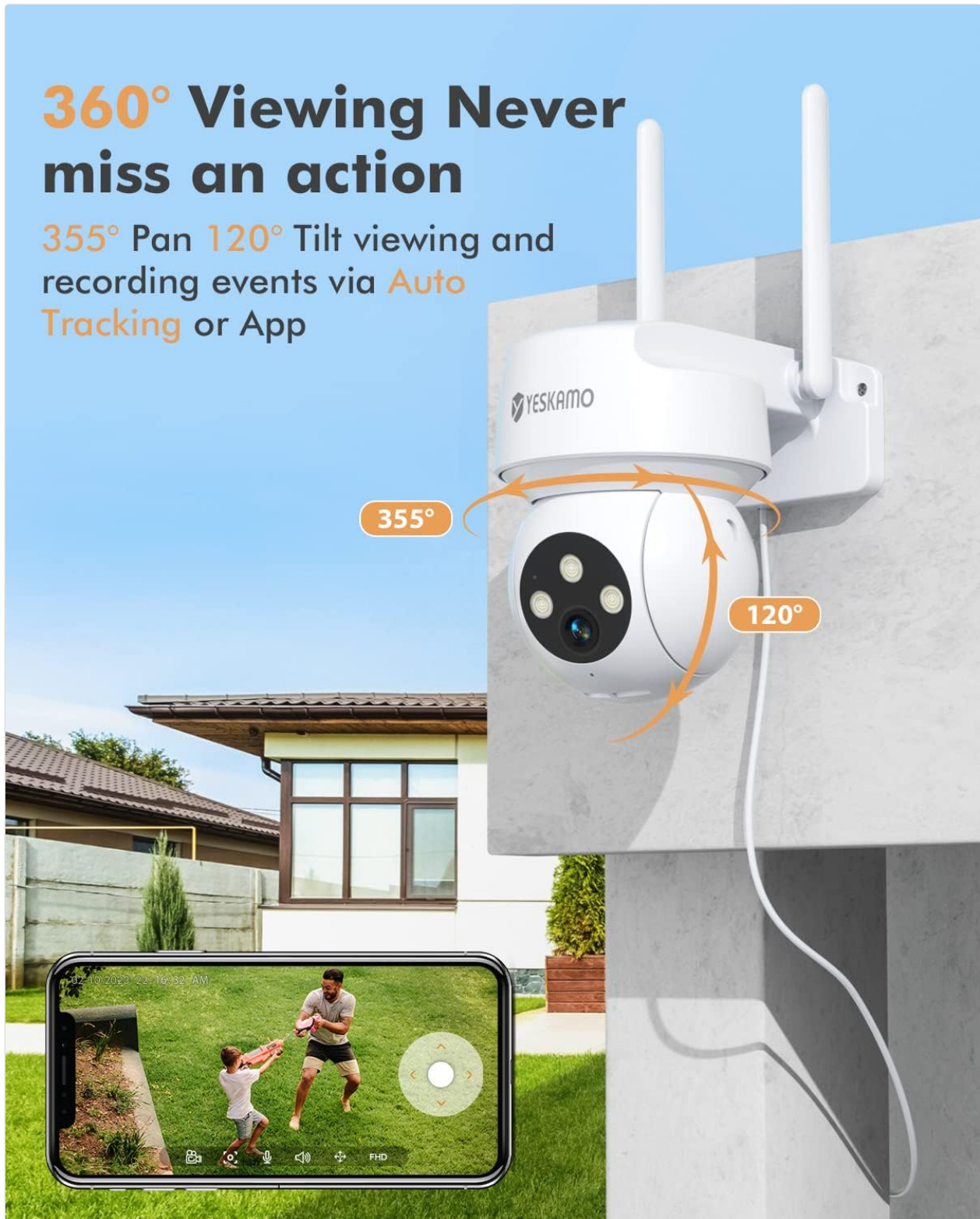
Image: The YESKAMO camera mounted on an exterior wall, illustrating its 355° pan and 120° tilt viewing capabilities.