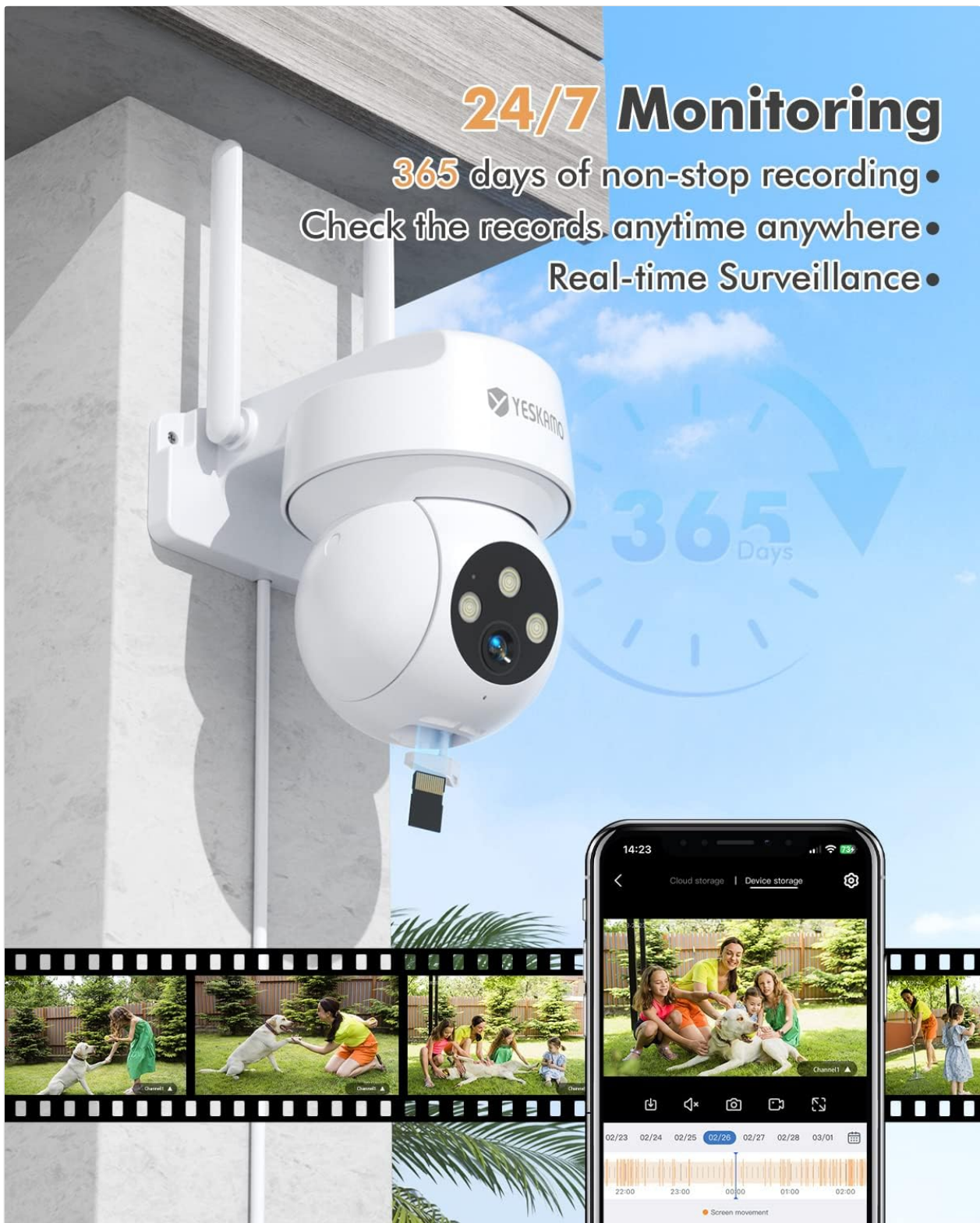
Image: The YESKAMO camera demonstrating 24/7 monitoring capabilities, including continuous recording and real-time surveillance accessible via a smartphone app.