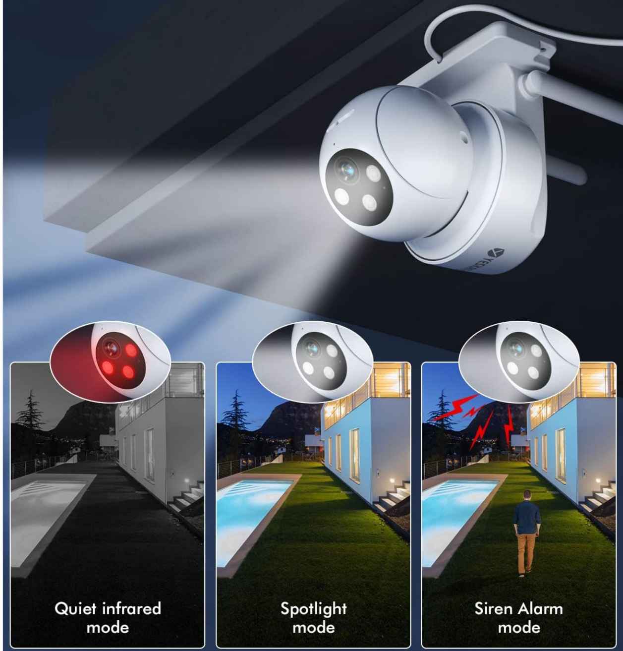
Image: Illustrations of the camera's three night vision modes: Quiet Infrared (standard B&W), Spotlight (color with floodlights), and Siren Alarm (color with floodlights and siren).