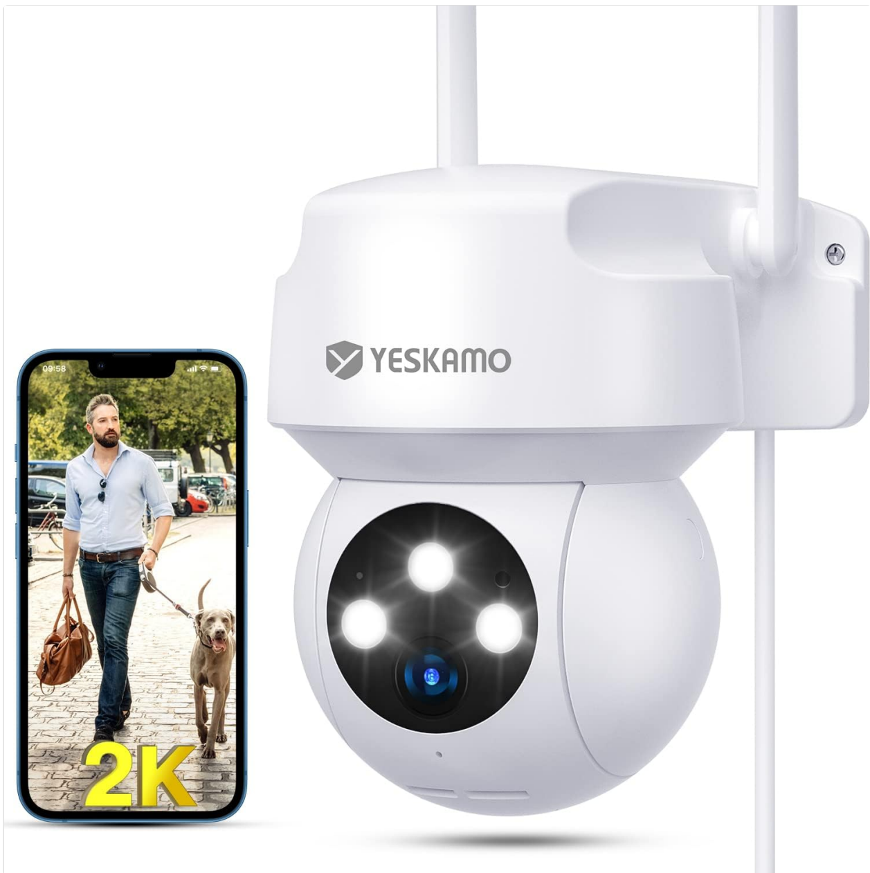
Image: The YESKAMO 360° Auto Tracking Camera, Model AP55, shown with a smartphone displaying its live monitoring capabilities.