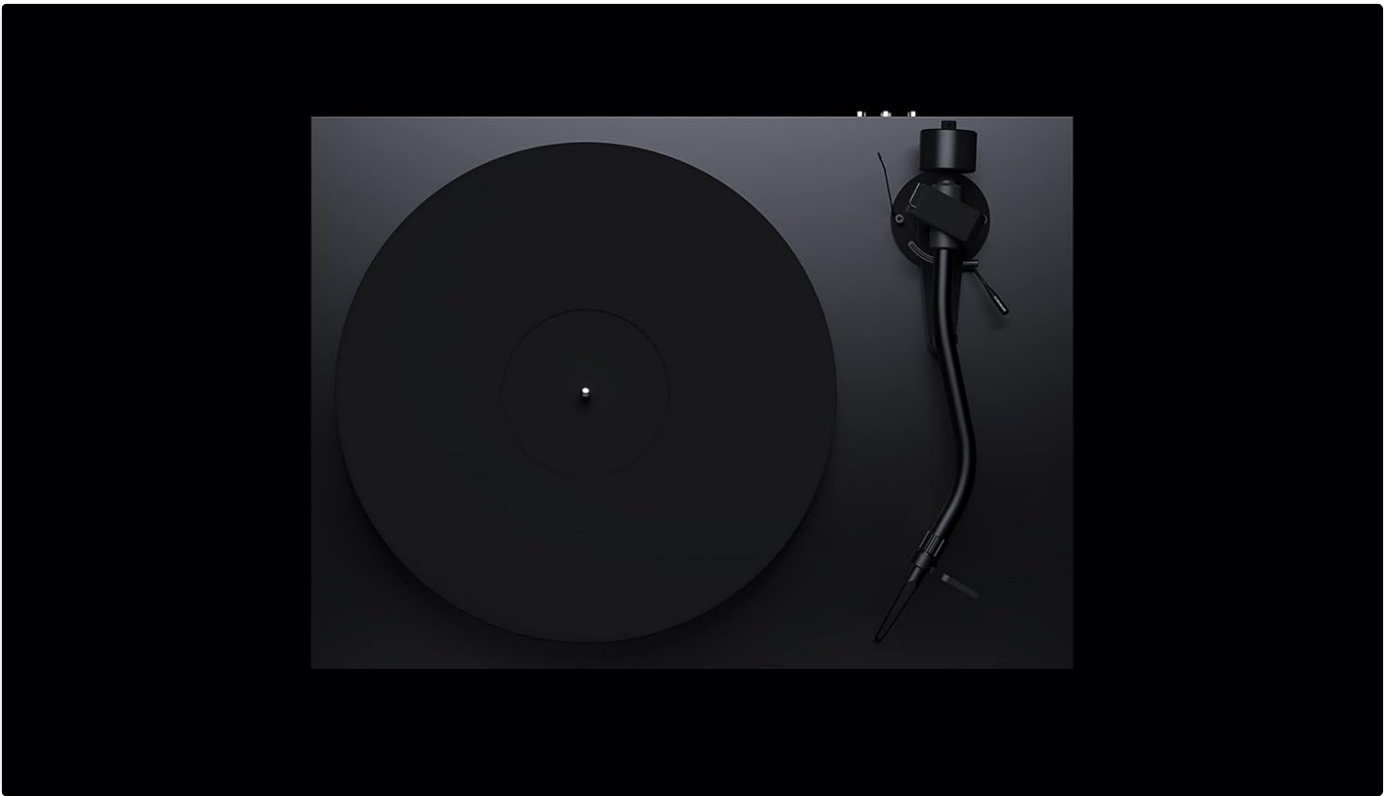
Image: An overhead view of the Pro-Ject Debut PRO S Turntable, providing a clear perspective of the platter, tonearm, and the overall layout. This angle is useful for understanding the operational components.