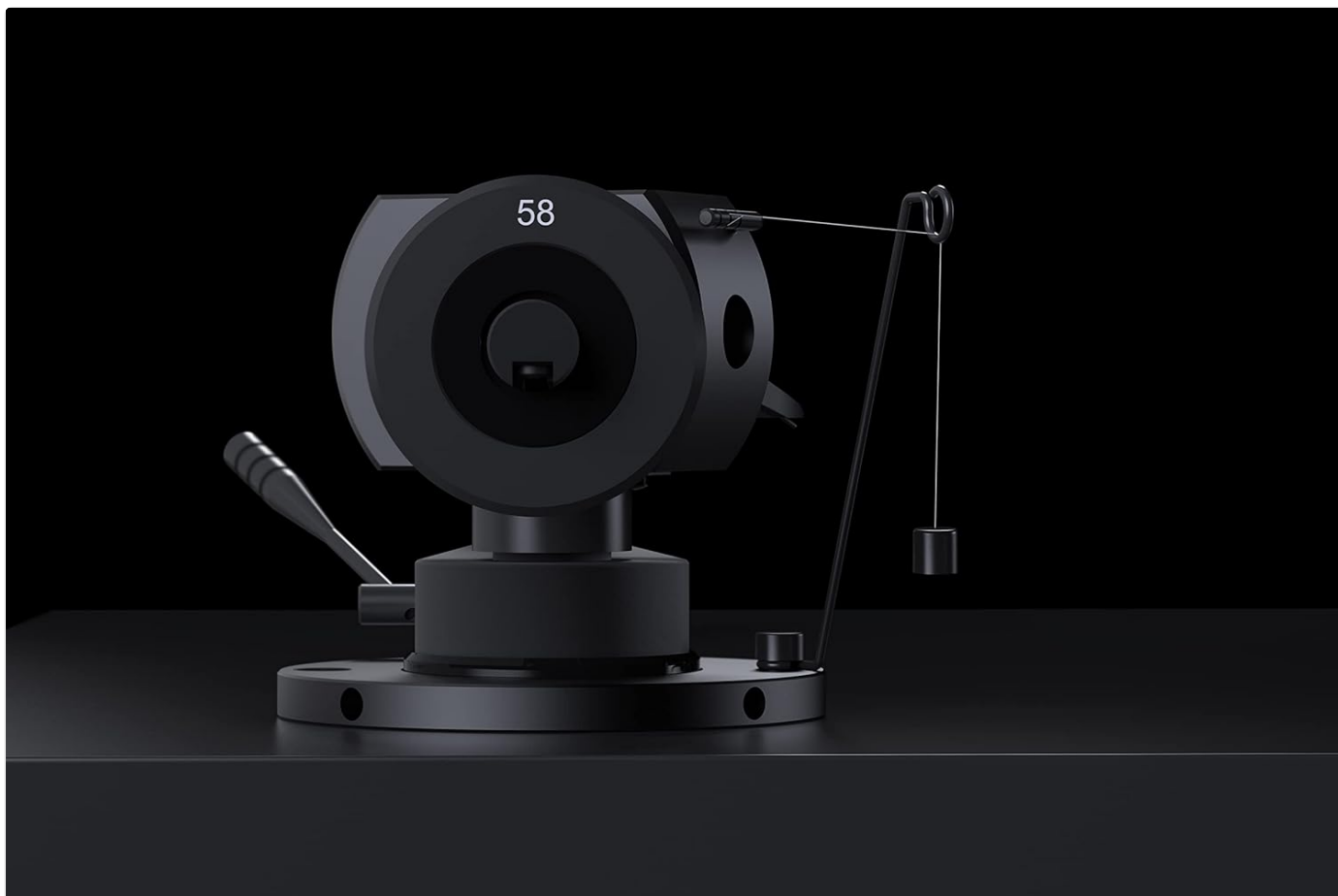
Image: A close-up of the tonearm's pivot area, clearly showing the anti-skate weight and its attachment point. This detail assists users in correctly setting the anti-skate force.

The tonearm also supports VTA (Vertical Tracking Angle) and Azimuth adjustment for fine-tuning cartridge performance. Refer to advanced setup guides if you wish to adjust these parameters.