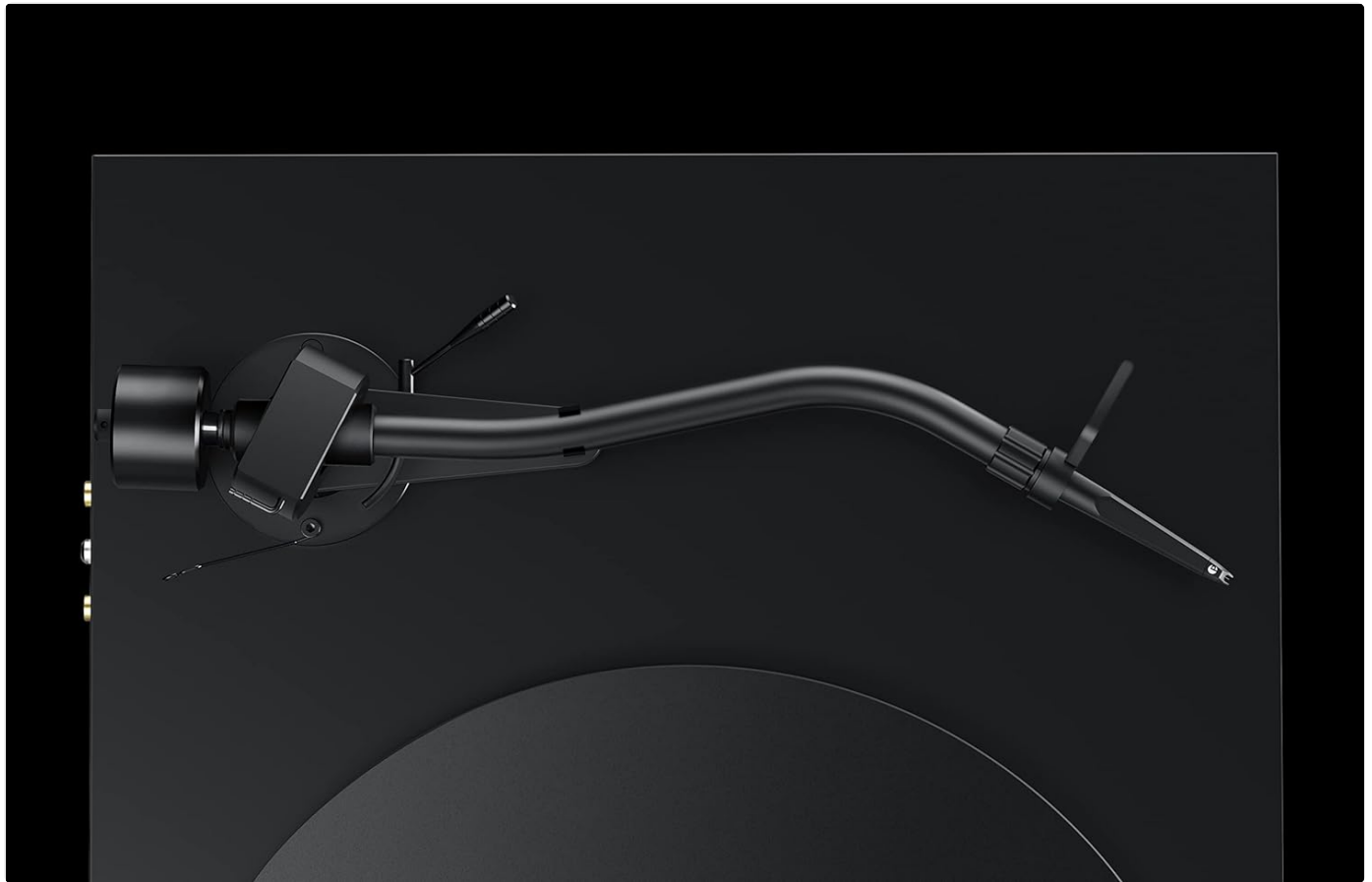
Image: A detailed view of the S-shaped tonearm, highlighting the counterweight and anti-skate mechanism. This image is crucial for understanding the physical components involved in balancing the tonearm and setting the tracking force.