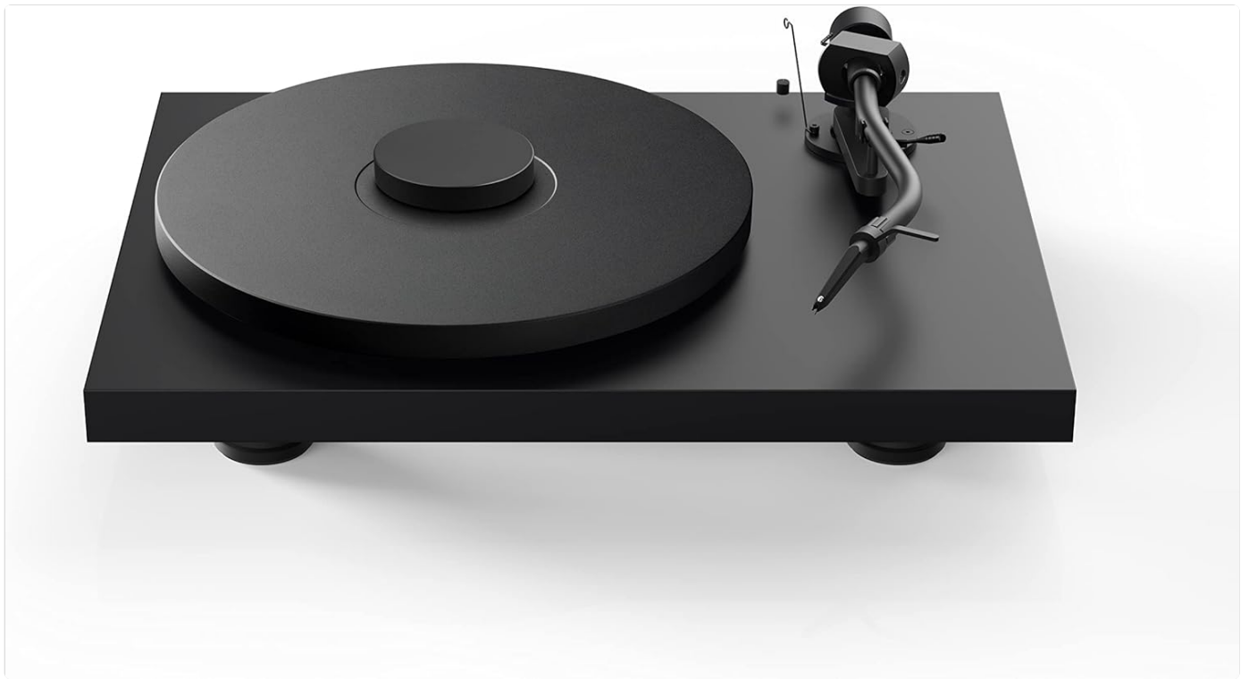
Image: The Pro-Ject Debut PRO S Turntable, showcasing its sleek satin black finish and the S-shaped tonearm. This view highlights the overall design and footprint of the unit, important for placement considerations.

The turntable features height-adjustable TPE-damped metal feet. Adjust these feet to ensure the turntable chassis is perfectly level. This minimizes resonance and improves playback stability.