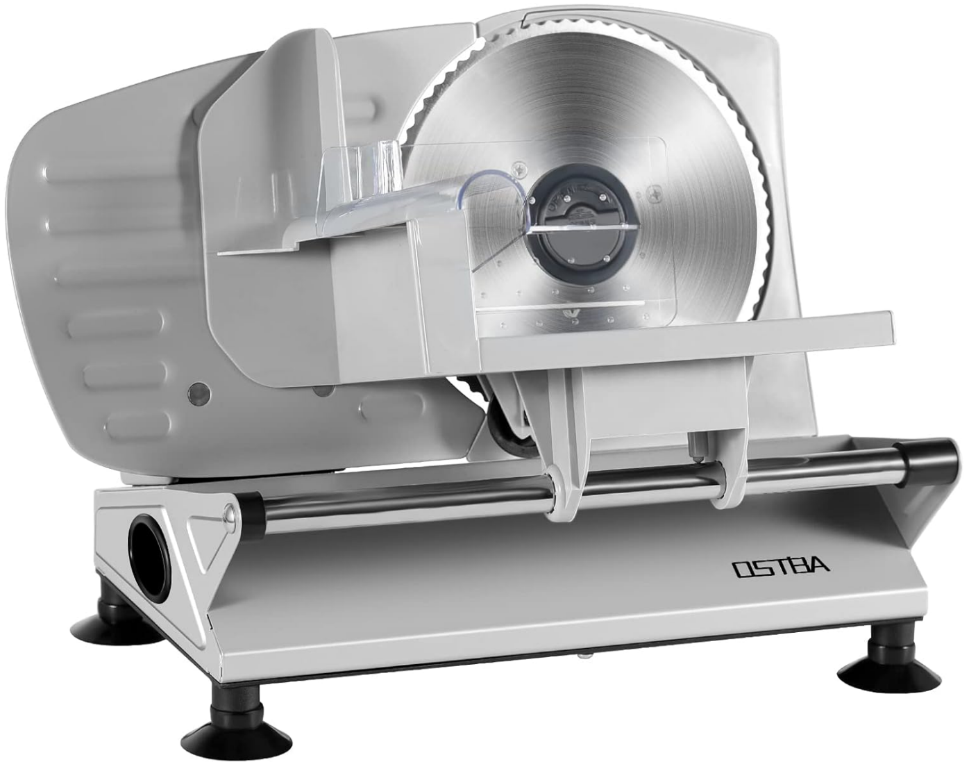
Figure 1: Overview of the OSTBA Electric Meat Slicer.