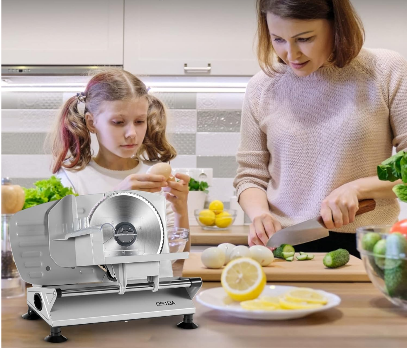
Figure 6: Smart design elements for greater safety and control, and efficient cleaning.