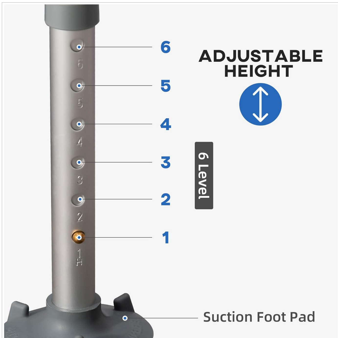
Image 5.1: Close-up view of the adjustable leg with numbered height settings and the spring pin mechanism.