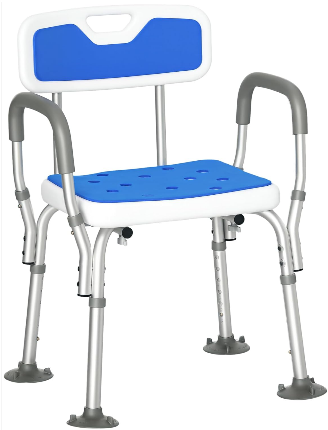
Image 1.1: The HOMCOM EVA Padded Shower Chair, featuring a blue padded seat and backrest, with adjustable aluminum legs and armrests.