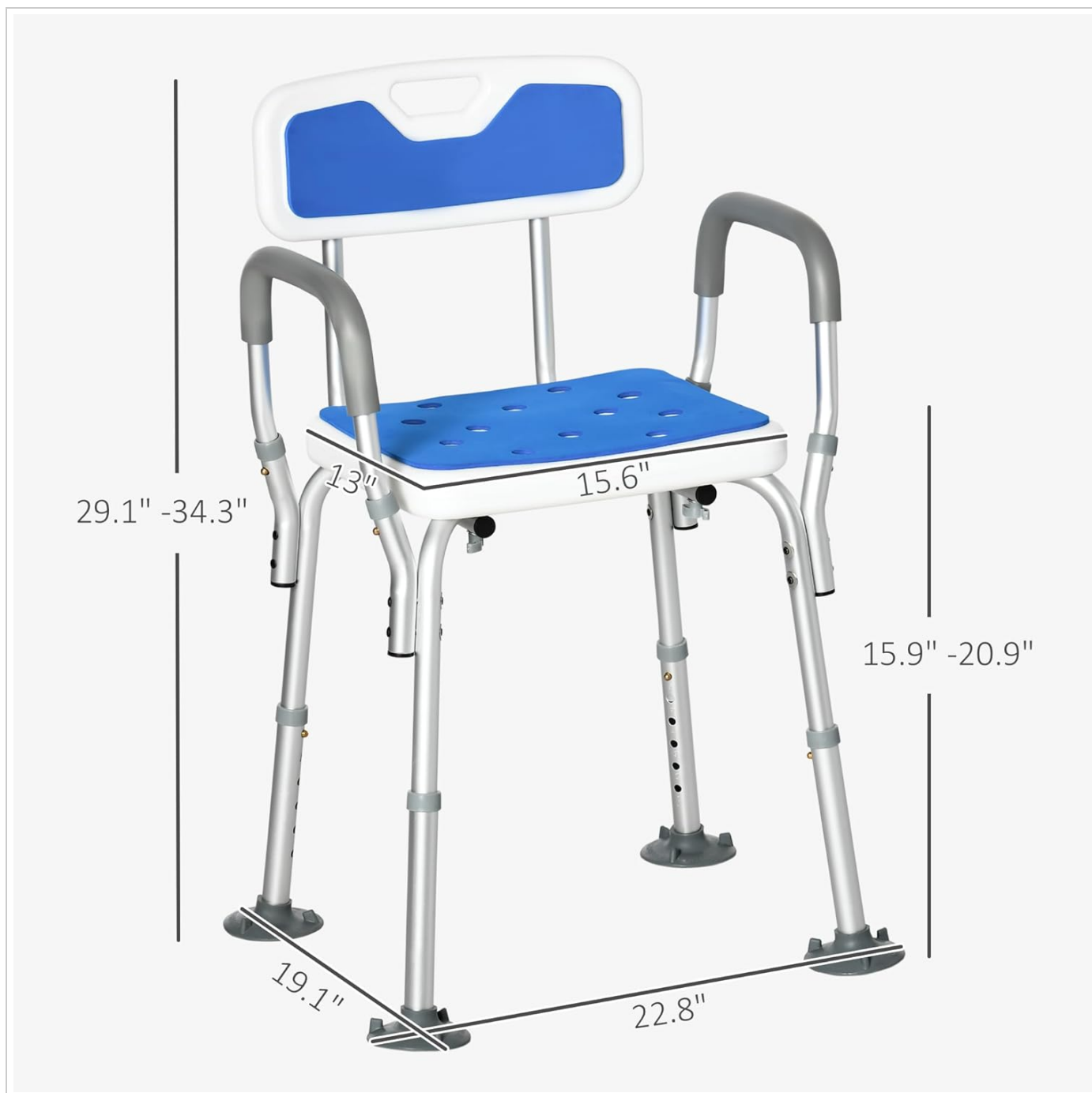
Image 8.1: Detailed diagram showing the key dimensions of the shower chair, including overall height, width, and seat measurements.