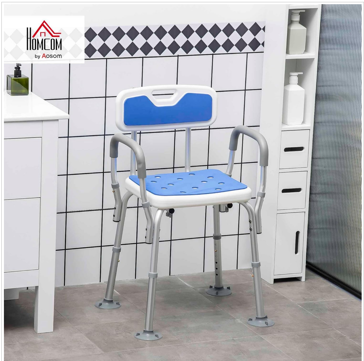
Image 5.2: The shower chair positioned in a bathroom next to a bathtub, demonstrating its intended use.

Video 5.3: An official product video demonstrating the features and use of the HOMCOM EVA Padded Shower Chair, including its adjustable height and padded surfaces.