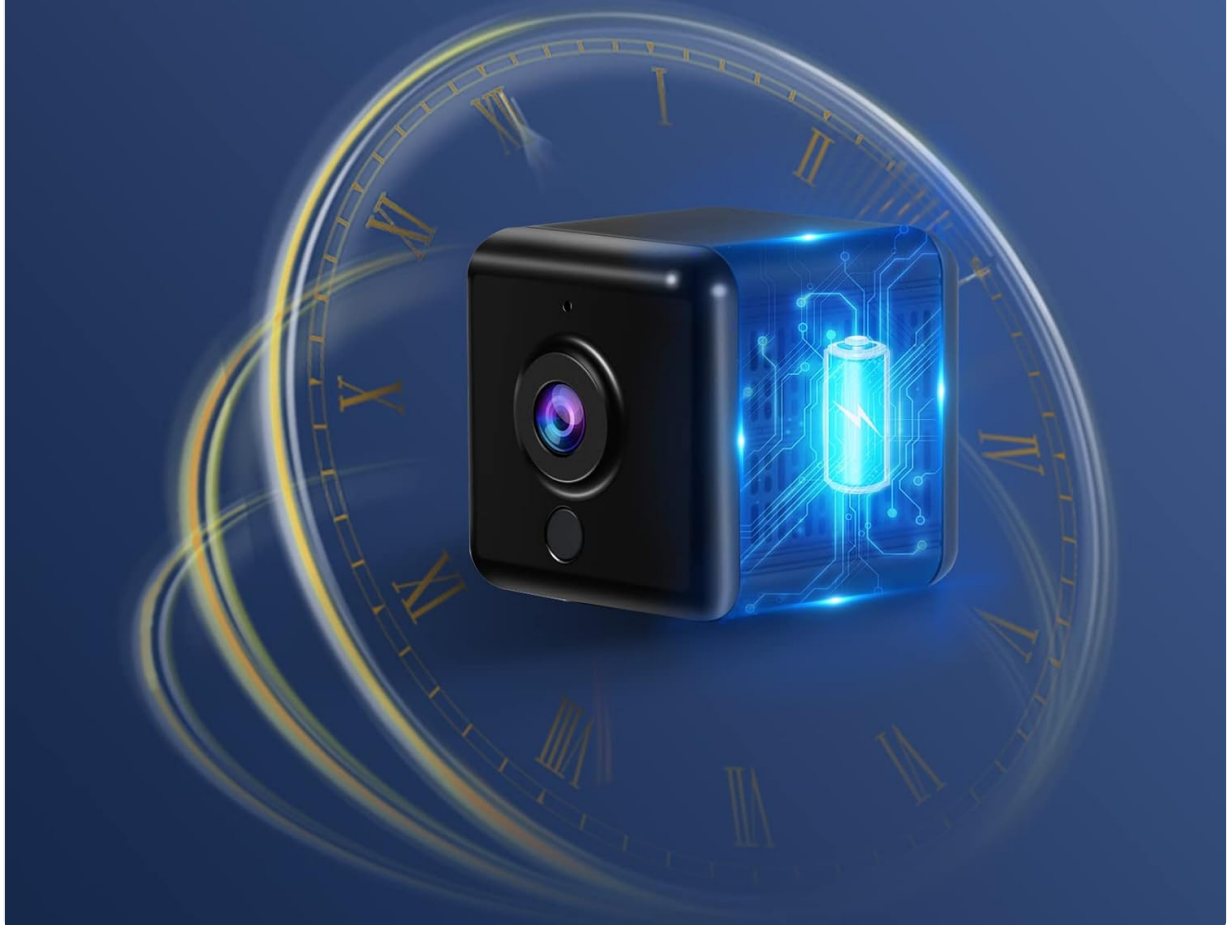
Illustration demonstrating the camera's improved battery life, featuring a 1400 mAh integrated battery that functions for up to 6-8 hours once fully charged.