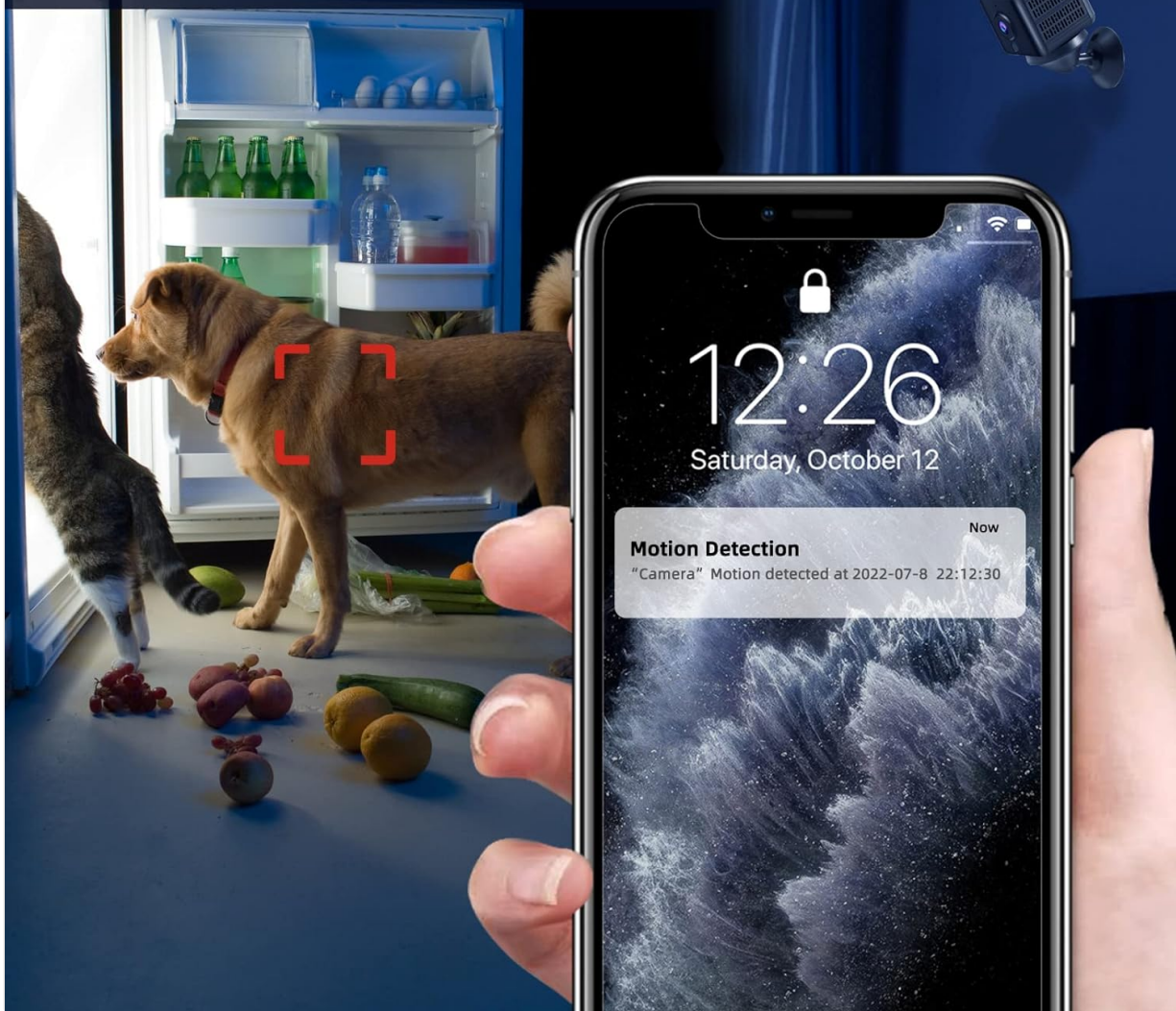
Image depicting the motion detection feature with a sound alarm, showing a smartphone screen displaying a motion detection notification while a cat and dog are active near a refrigerator.