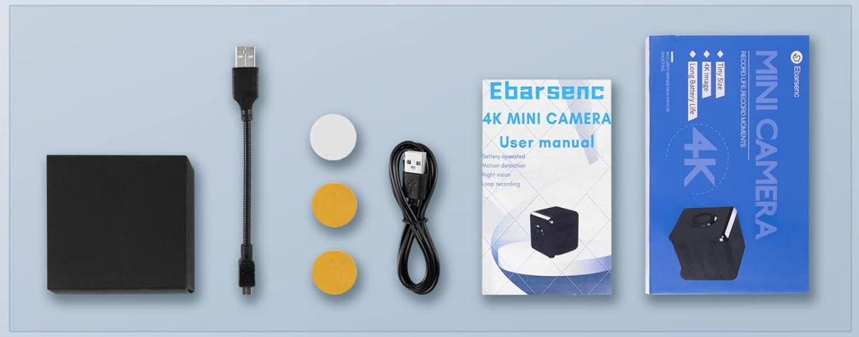
Image showing the compact size of the camera next to a smartphone, along with the included accessories: USB cable, adhesive pads, plastic mount, and user manual.