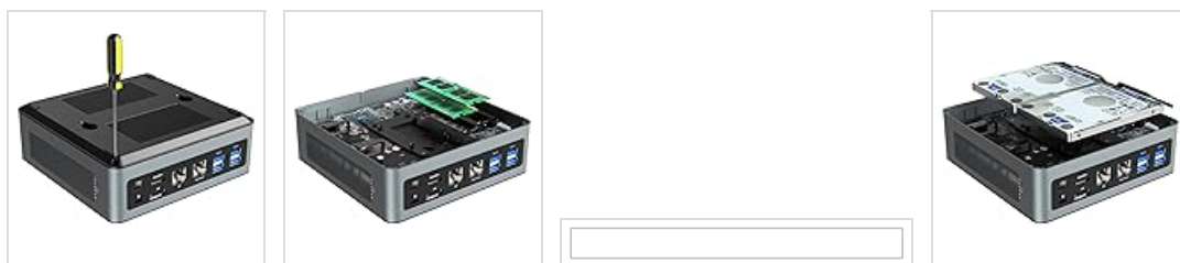
Images: Steps for opening the HM80 Mini PC and installing RAM, SSD, and HDD components.

The HM80 Mini PC allows for easy upgrades of RAM, SSD, and HDD.