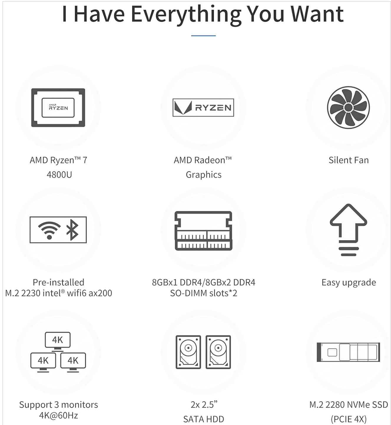
Image: Exploded view of the HM80 Mini PC showing internal components like RAM, SSD, and HDD slots.

The HM80 Mini PC is designed for easy access to internal components for upgrades.