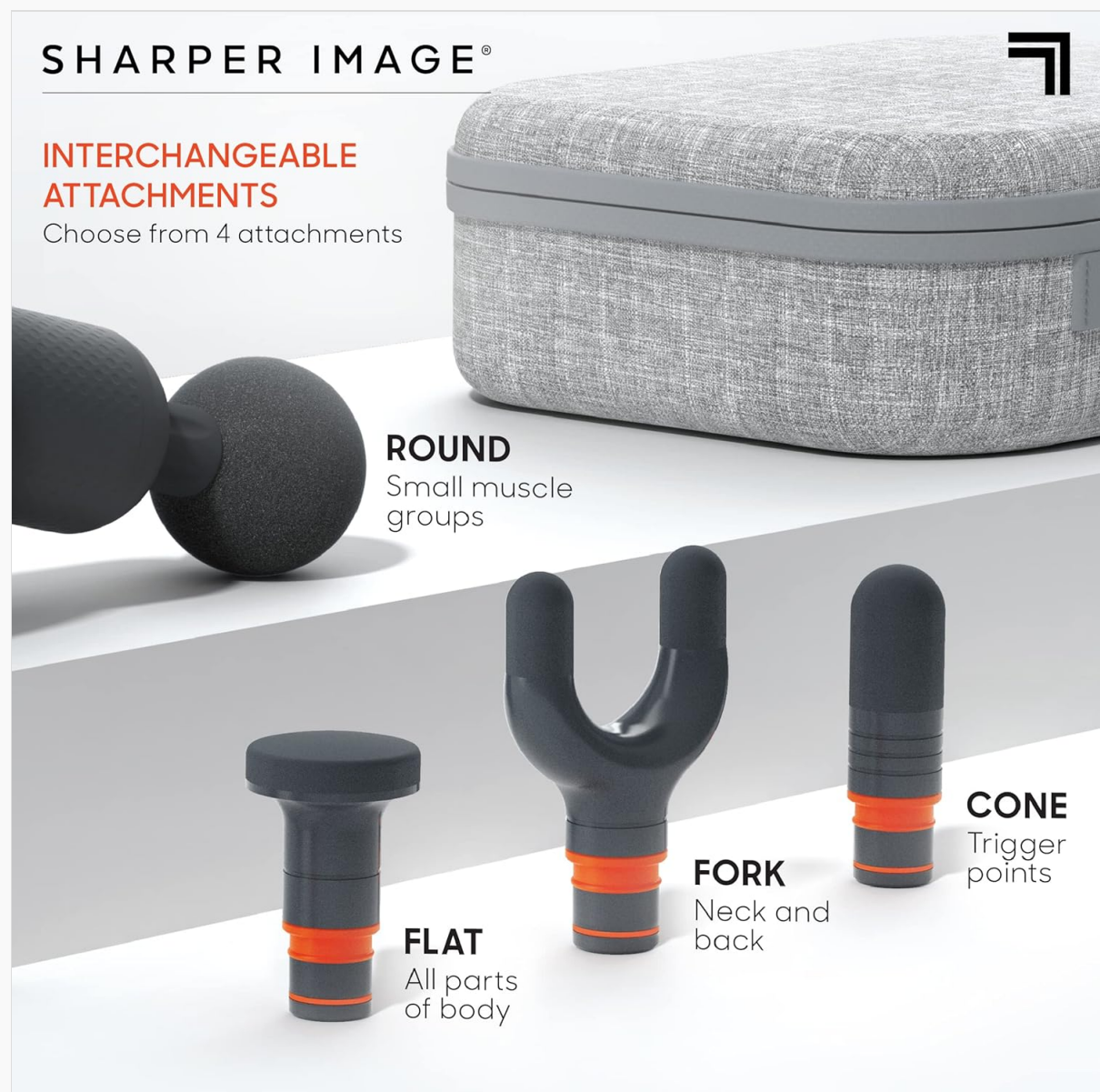
Figure 5: Interchangeable Attachments