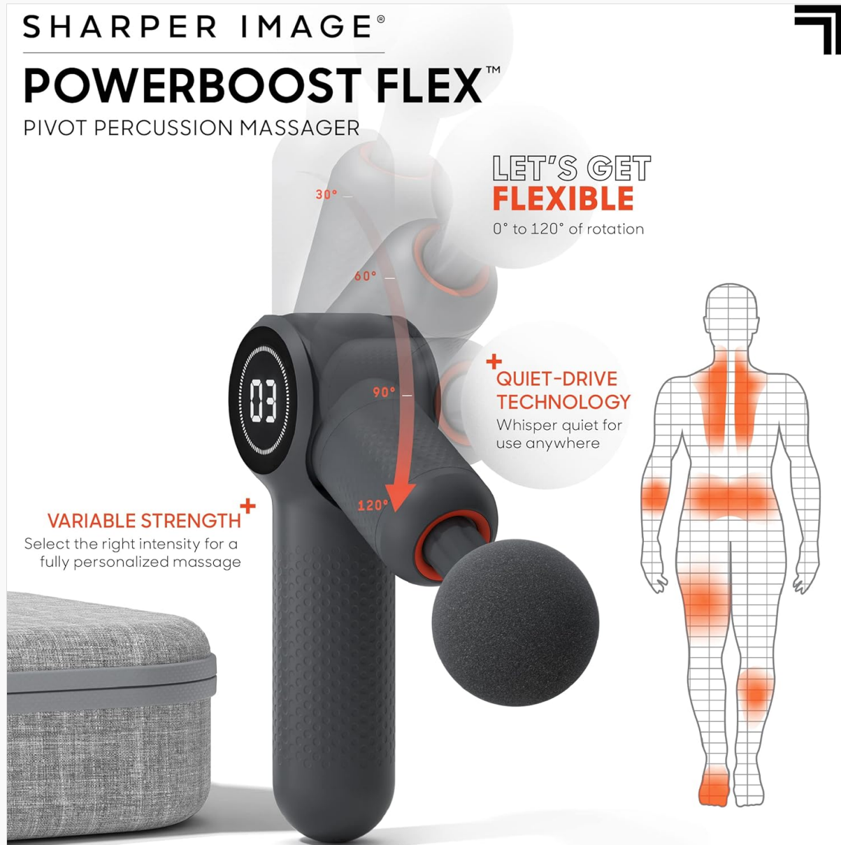
Figure 2: Flex Pivot Feature