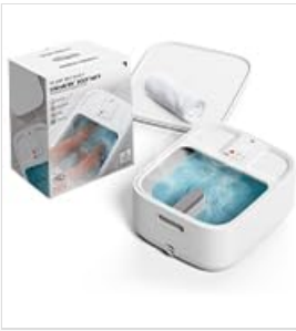
Figure 6: Attachment Usage Guide