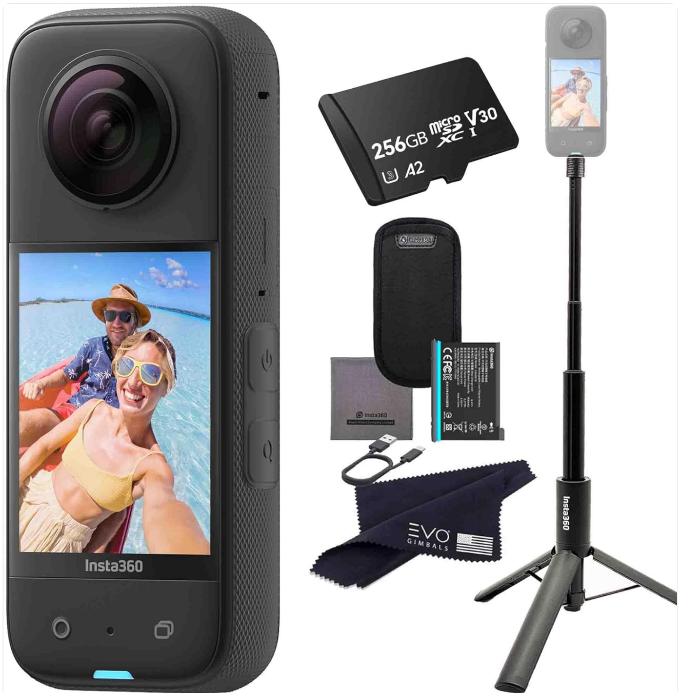
The Insta360 X3 camera shown alongside its bundled accessories, including the 2-in-1 selfie stick and 256GB microSD card.