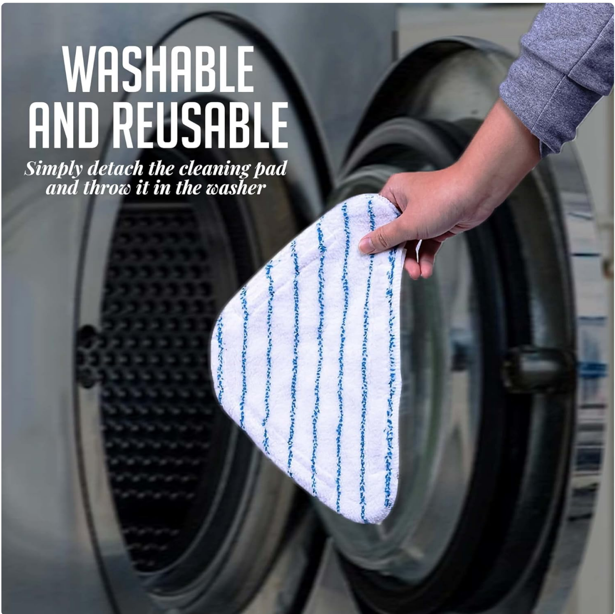
Image: A hand is shown placing a white microfiber steam mop pad into the open drum of a washing machine, illustrating its washable and reusable nature.

Simply detach the cleaning pad and throw it in the washer