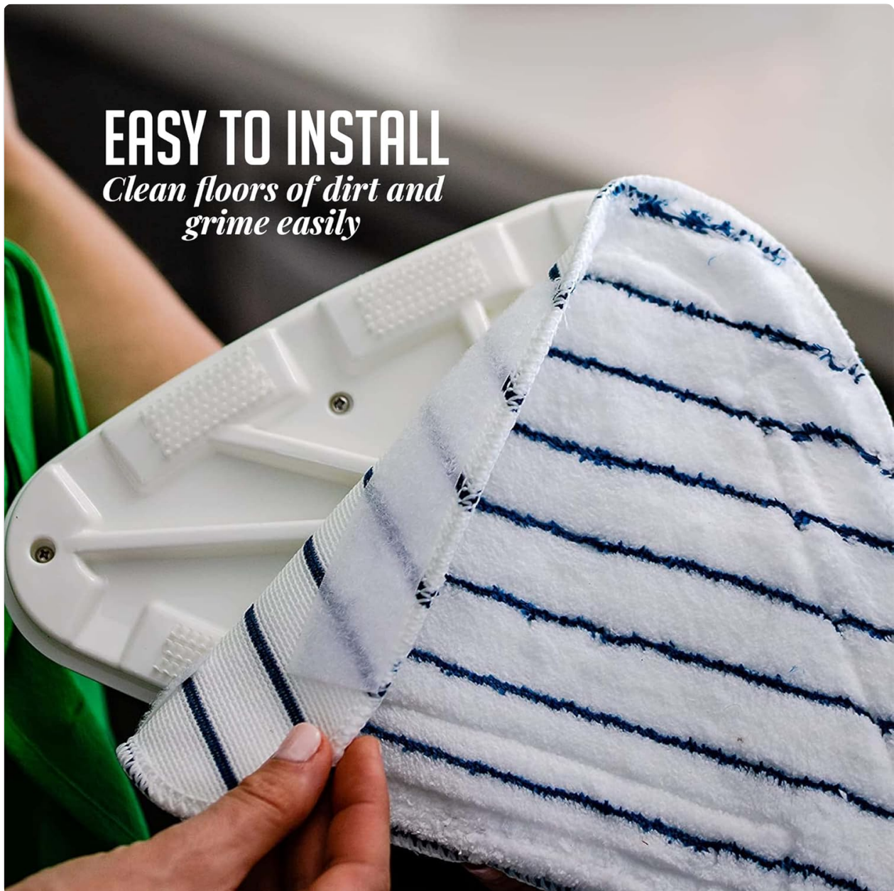
Image: A close-up of a hand attaching a white microfiber replacement pad to the triangular head of a steam mop using Velcro fasteners.