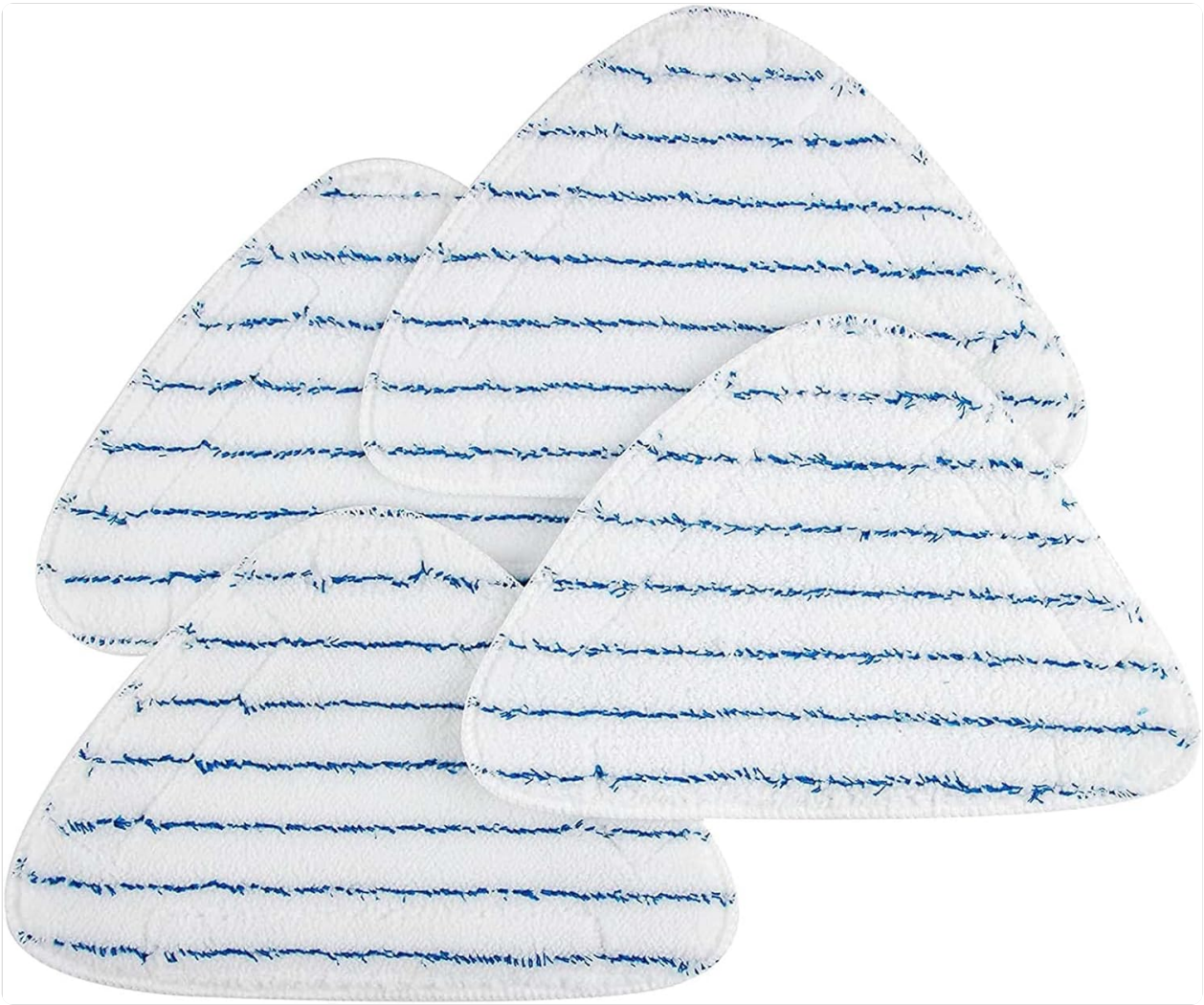
Image: A pack of four white OVENTE steam mop replacement pads with blue striped patterns.