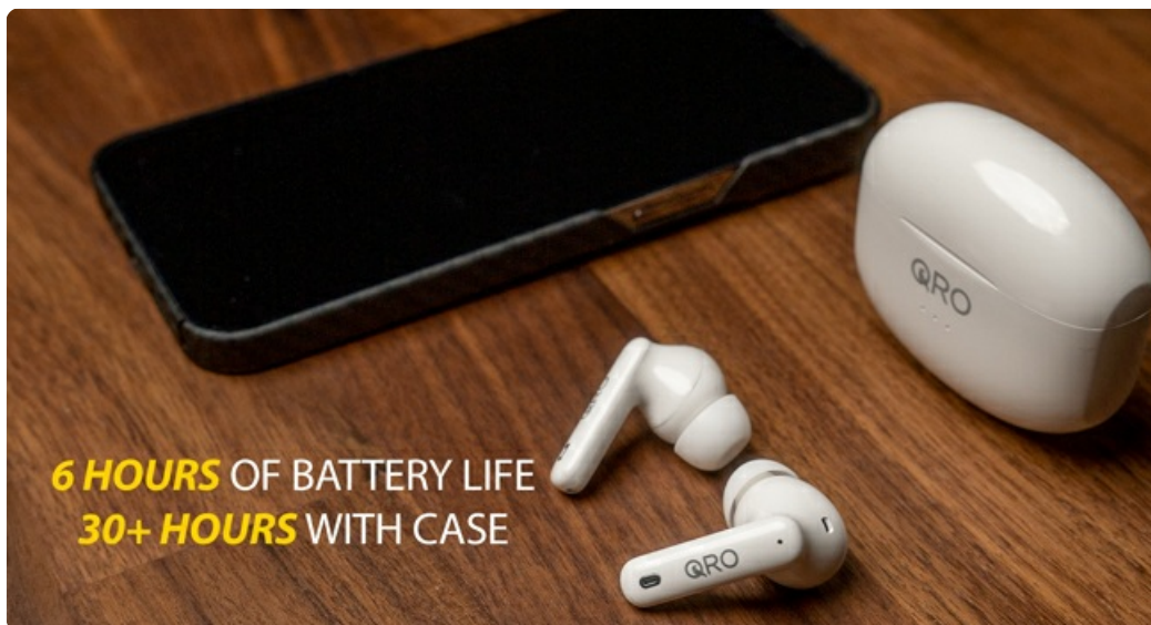
Image: Qro earbuds and their charging case positioned beside a smartphone on a wooden surface, with text overlay highlighting "6 HOURS OF BATTERY LIFE" and "30+ HOURS WITH CASE".