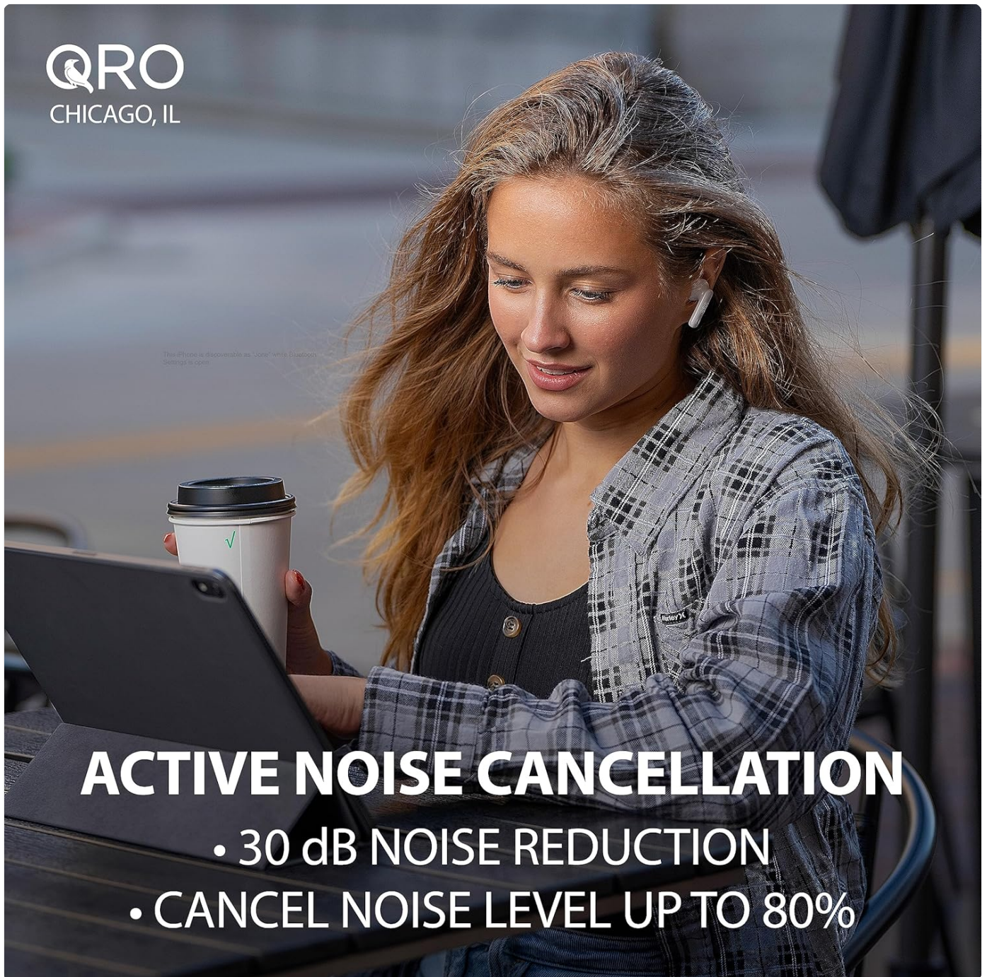
Image: A woman wearing Qro earbuds, focused on her laptop in a cafe setting, illustrating the benefit of Active Noise Cancellation in a busy environment.