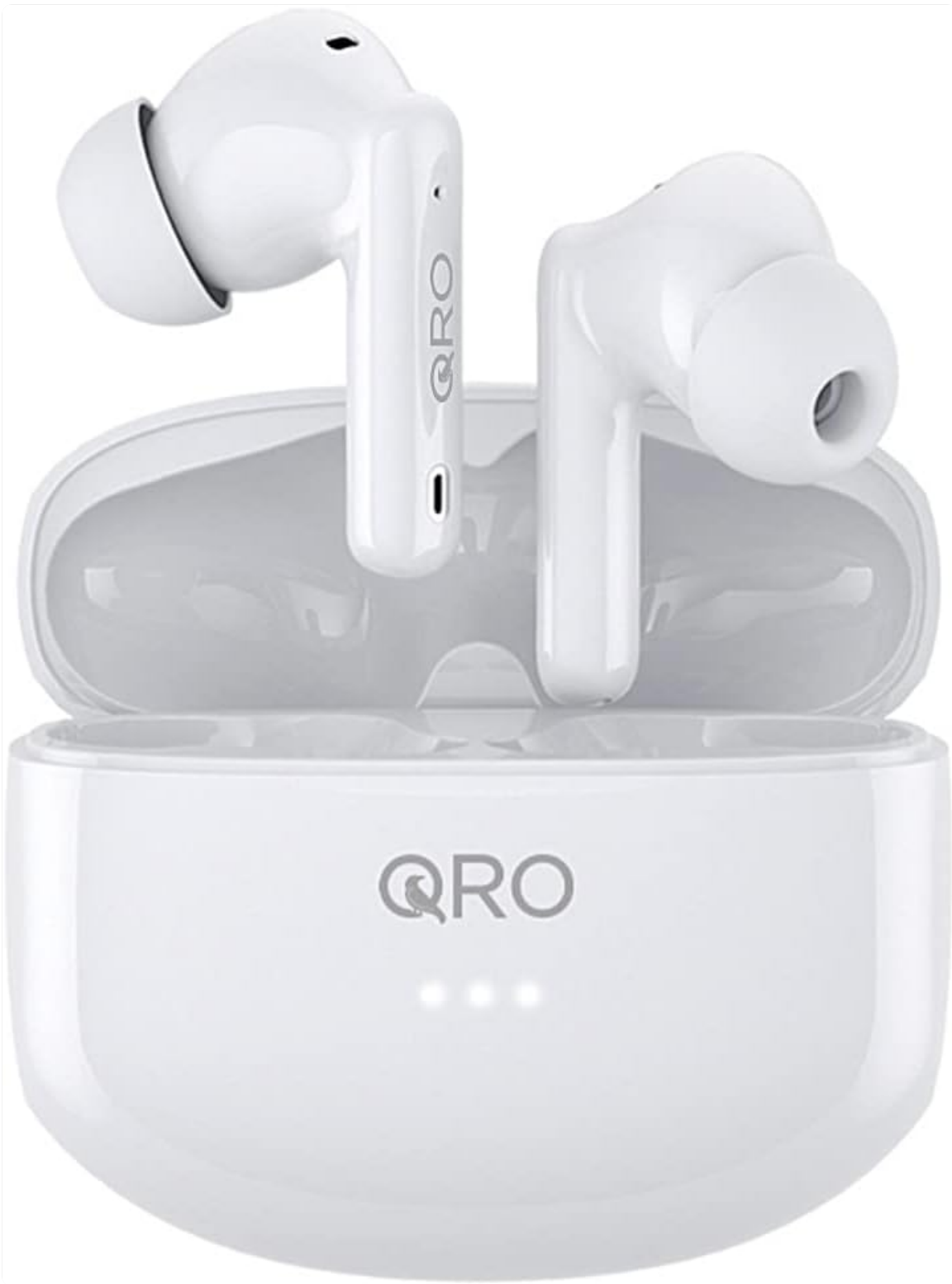
Image: Qro A40 Pro Wireless Earbuds, white, resting in their open charging case, showcasing their sleek design and compact form factor.